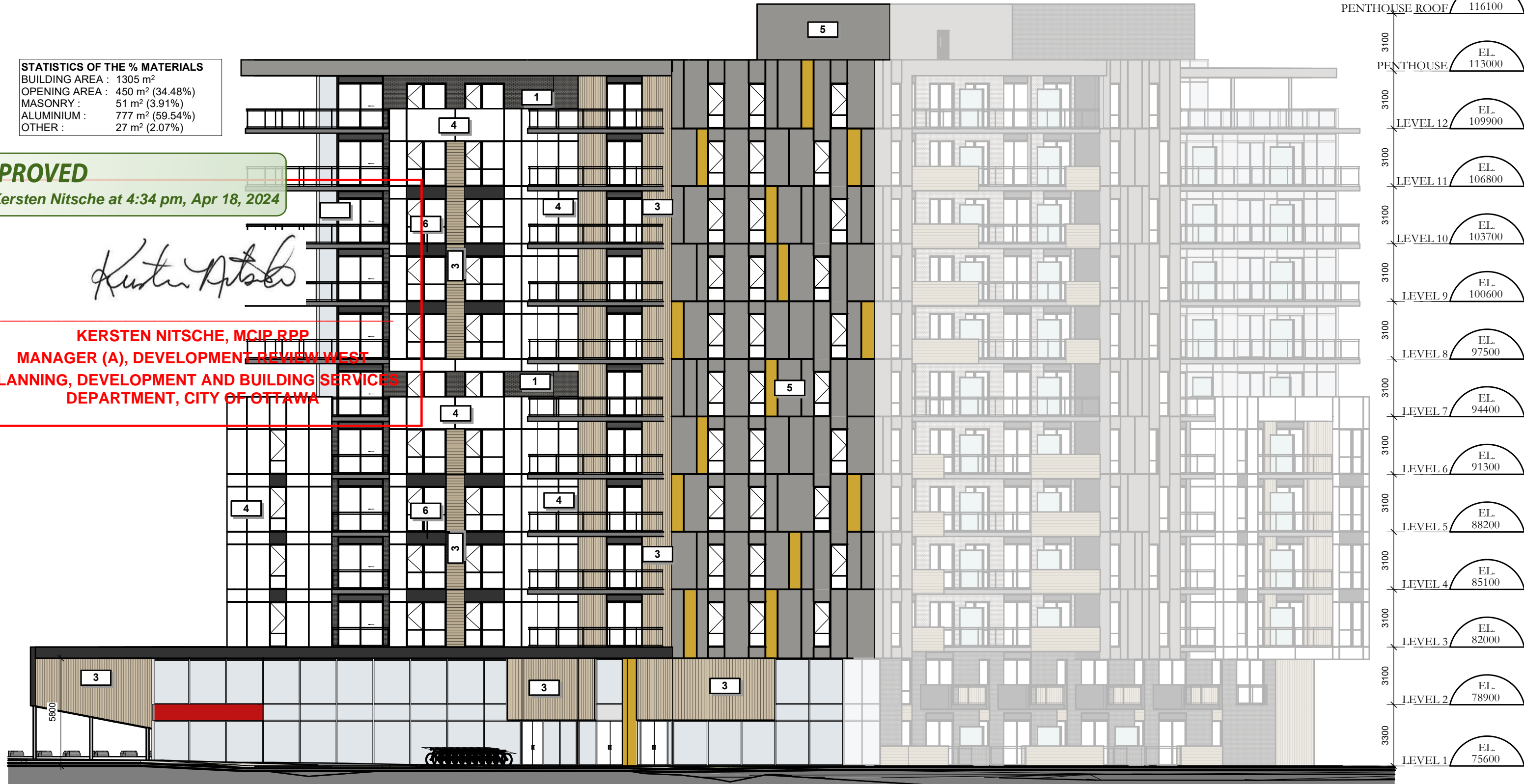
TOWER A - LEFT SIDE ELEVATION (RICHMOND ROAD)

KERSTEN NITSCHÉ, MCIP RPP MANAGER (A), DEVELOPMENT REVIEW WEST PLANNING, DEVELOPMENT AND BUILDING SERVICES DEPARTMENT, CITY OF OTTAWA