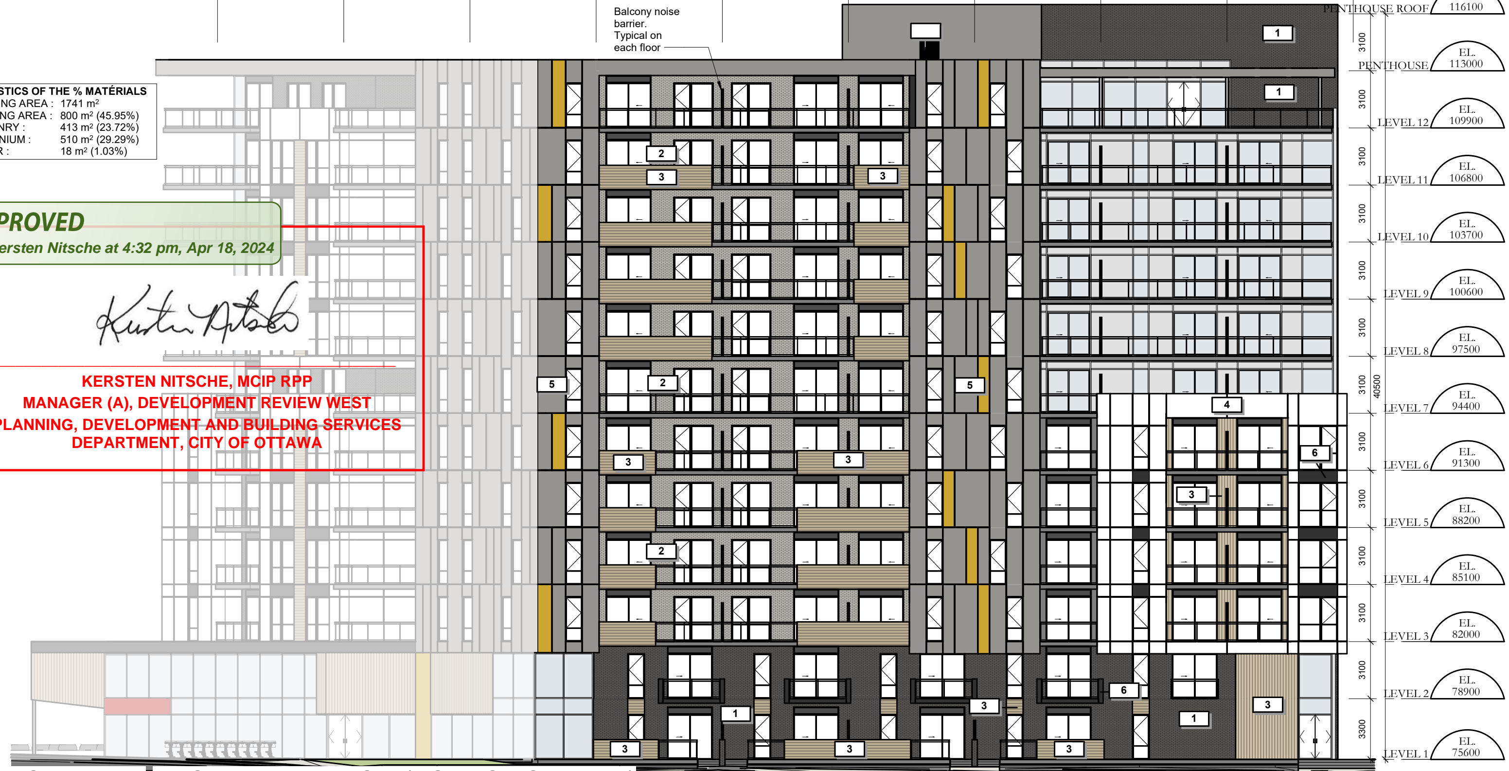
TOWER A - FRONT ELEVATION (FOREST STREET)

Balcony noise barrier. Typical on each floor