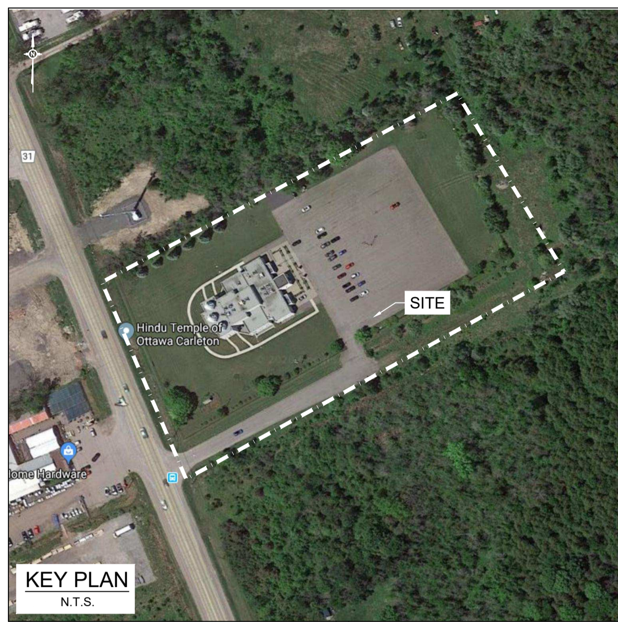
KEY PLAN N.T.S.