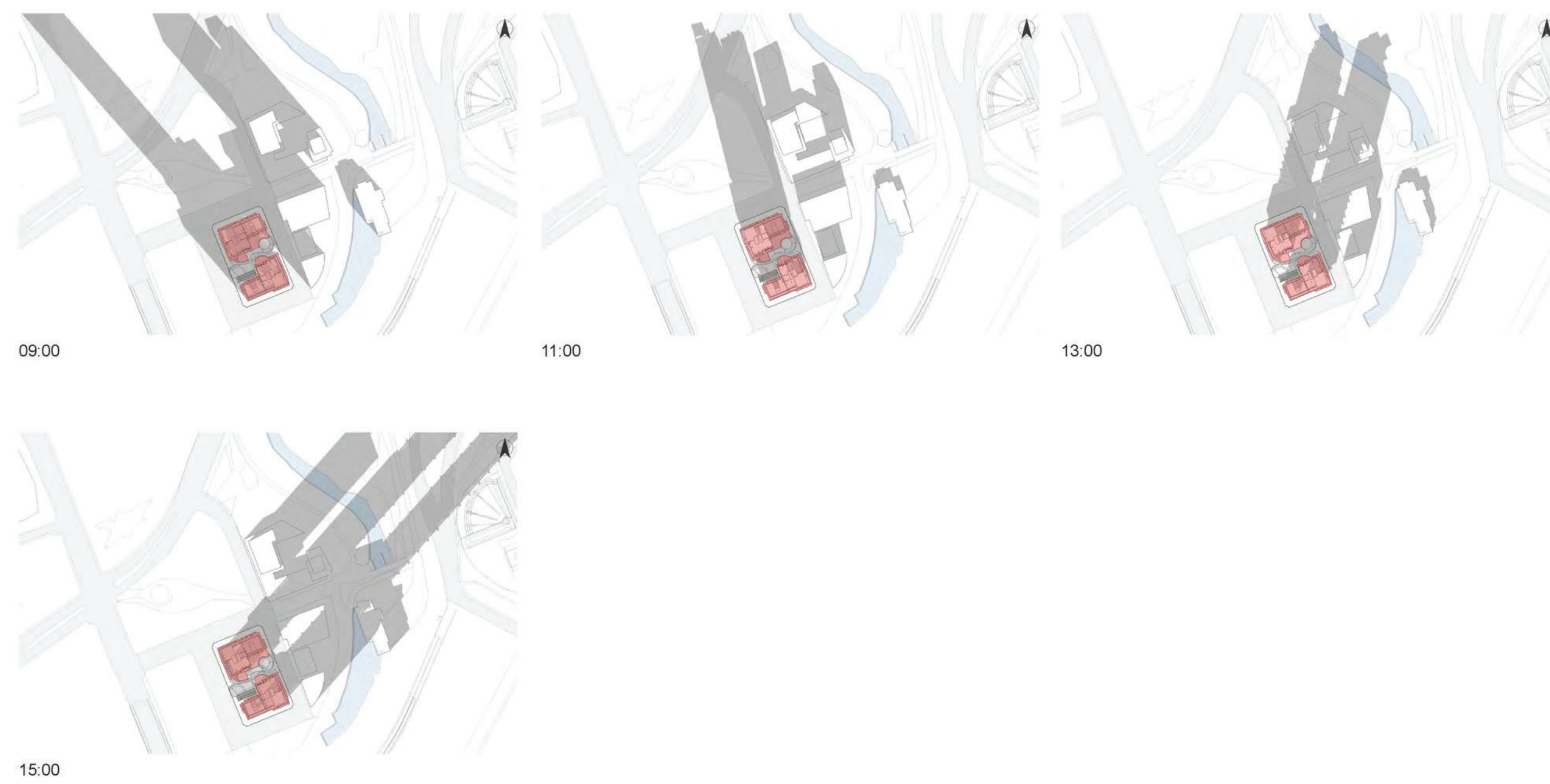
WINTER SOLSTICE 21/12