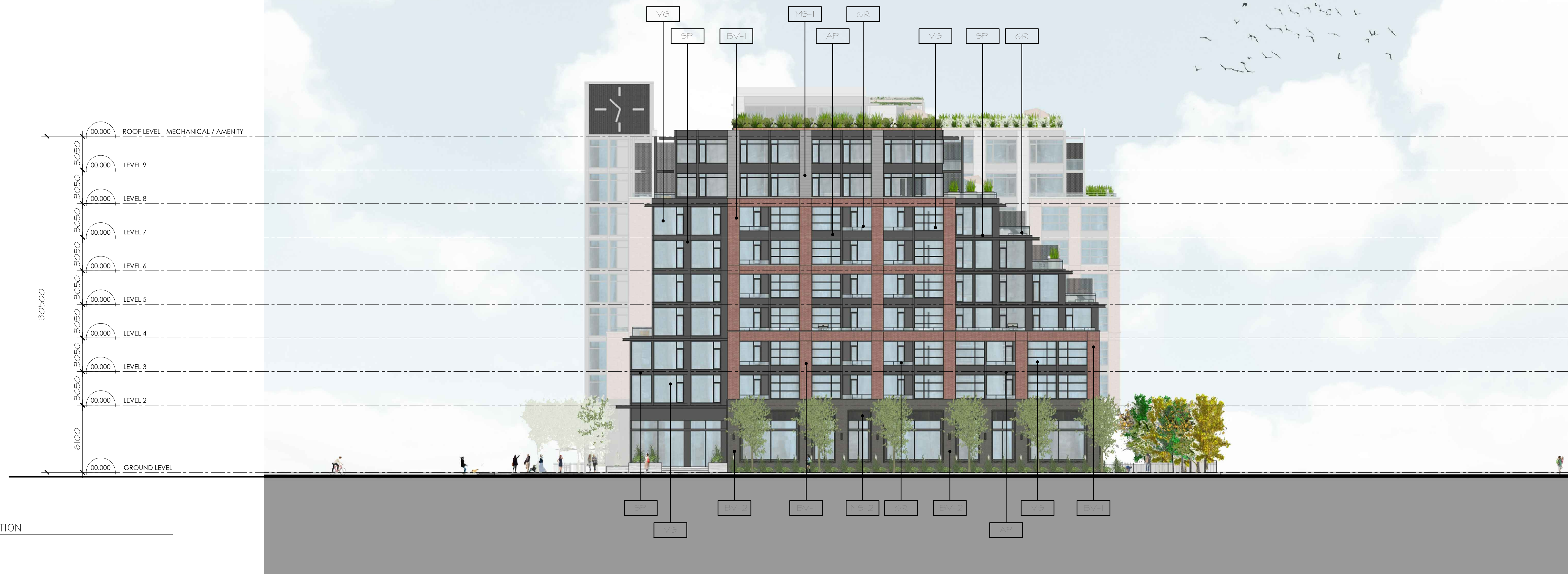
1 EAST ELEVATION A3.03 1:200