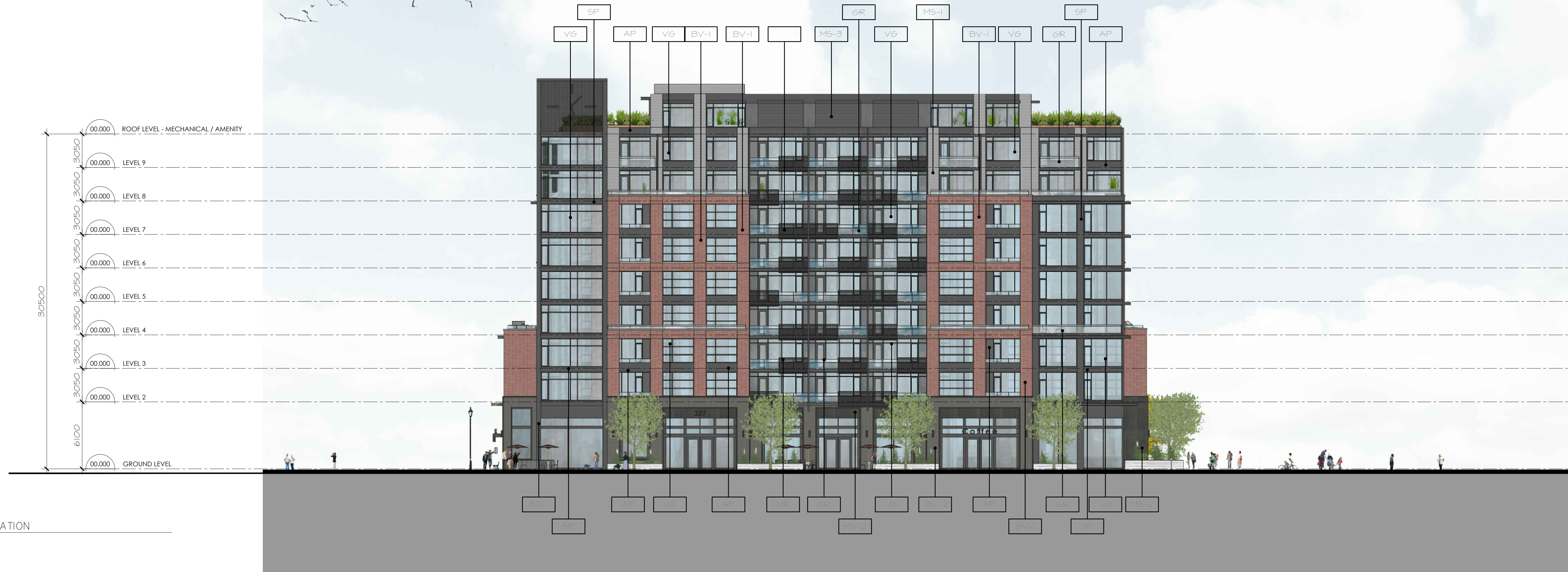
1 SOUTH ELEVATION A3.02 1:200