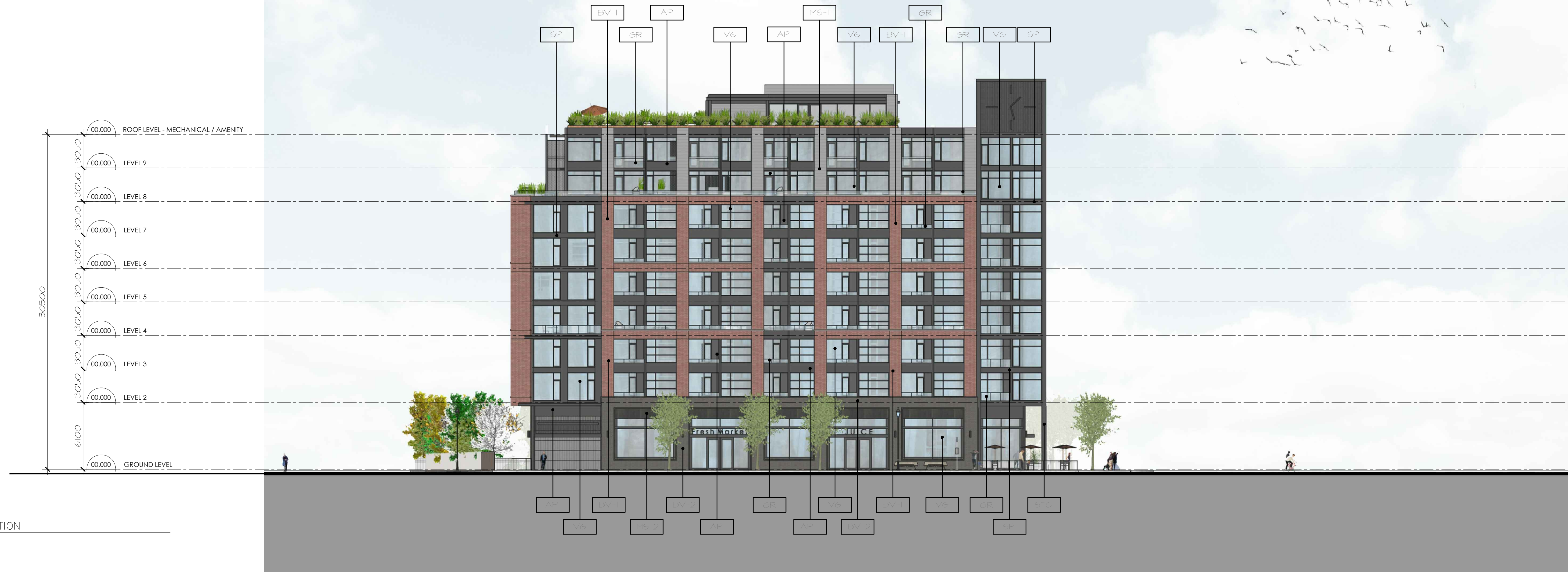
1 WEST ELEVATION A3.01 1:200