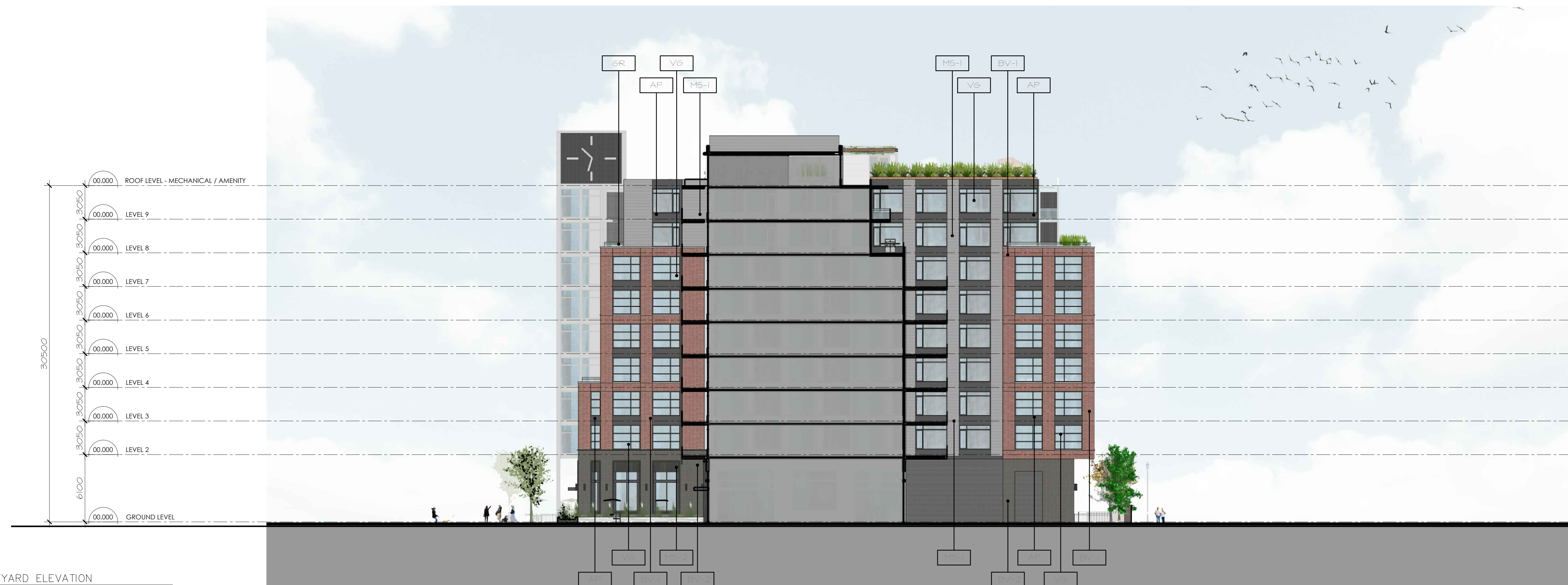
2 EAST COURTYARD ELEVATION A3.03 1:200