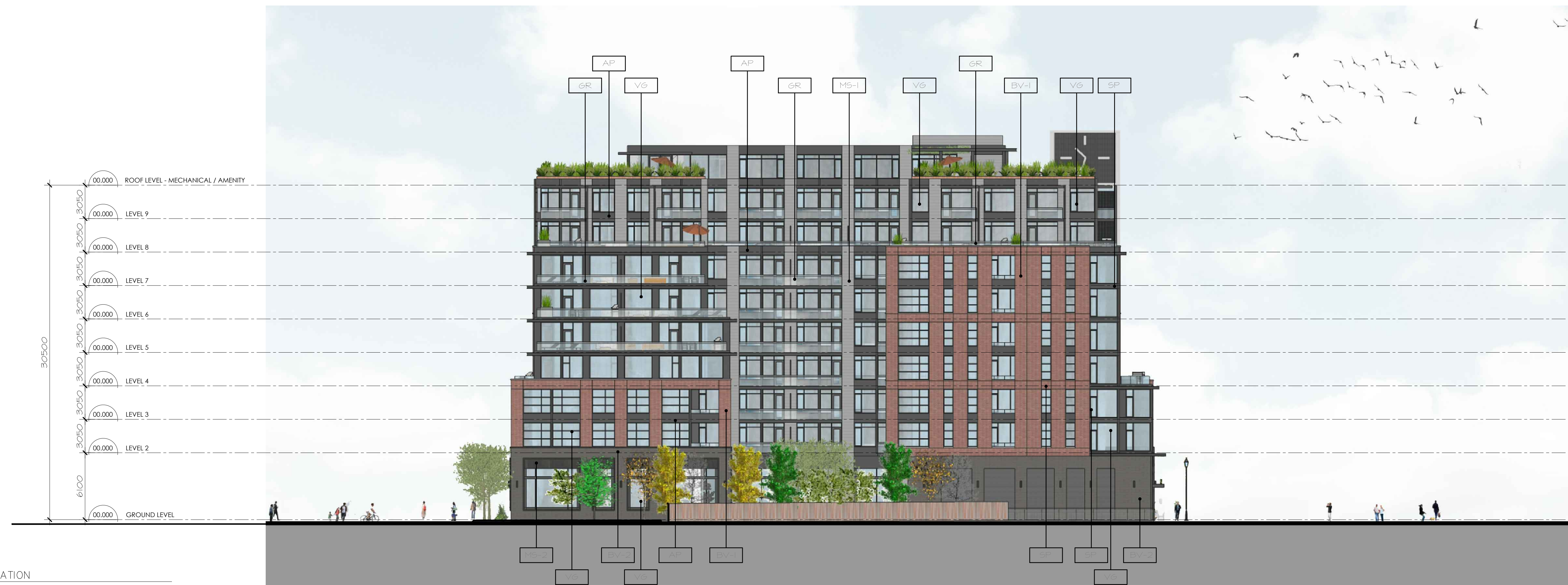
2 NORTH ELEVATION A3.02 1:200