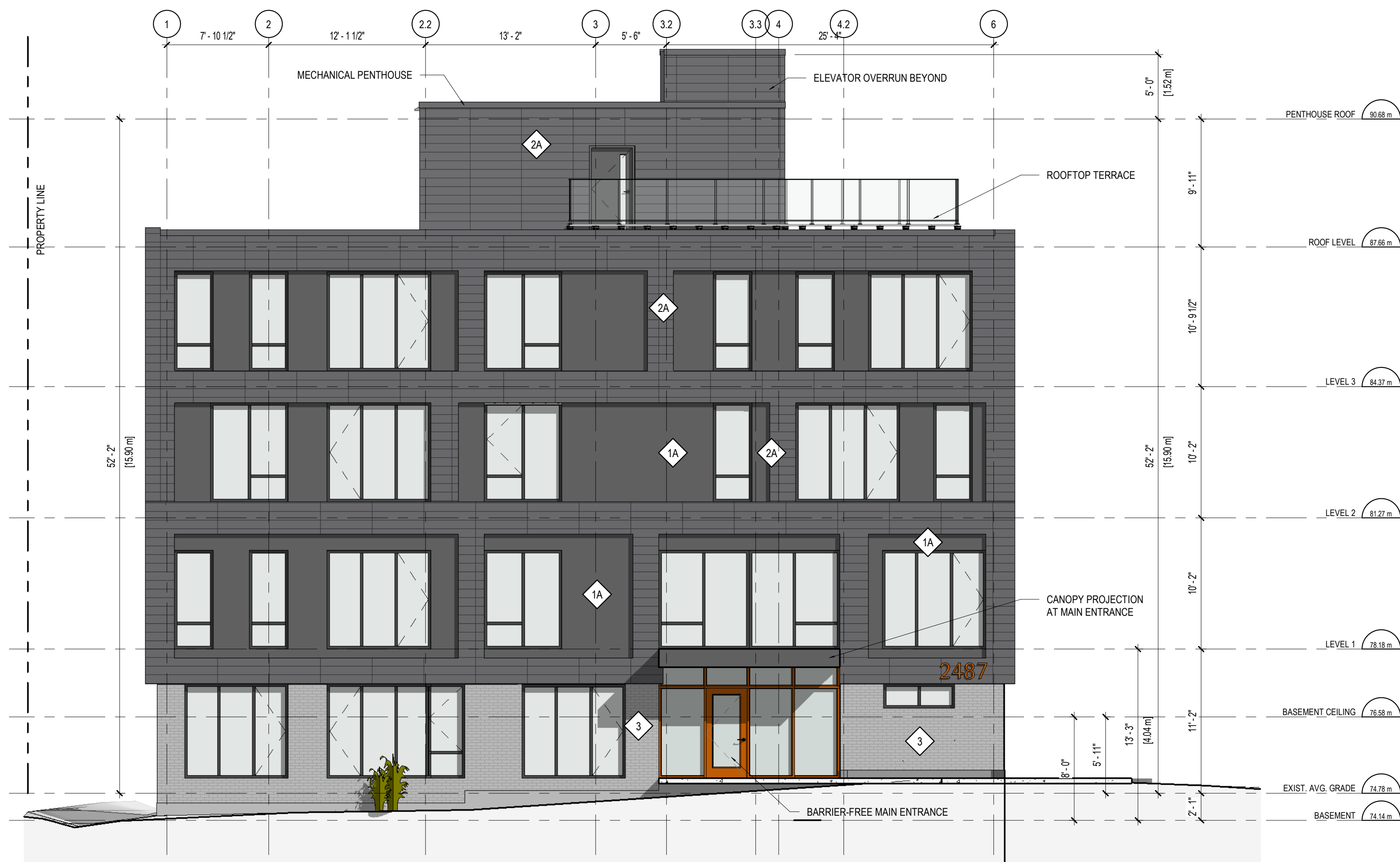
2 SOUTH ELEVATION A200 1 : 75

GERALDINE WILDMAN A/MANAGER, DEVELOPMENT REVIEW EAST BRANCH PLANNING, INFRASTRUCTURE & ECONOMIC DEVELOPMENT DEPARTMENT, CITY OF OTTAWA