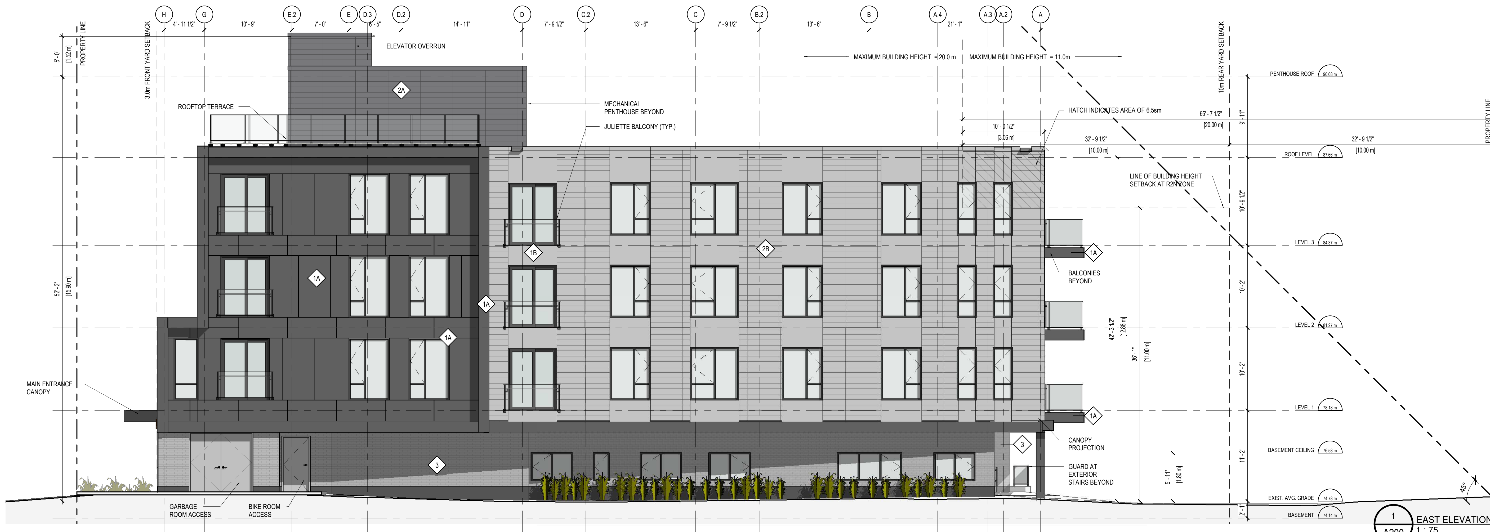
1 EAST ELEVATION A200 1 : 75