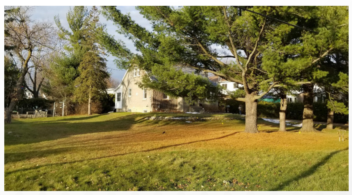
The house at 2487 Innes Road