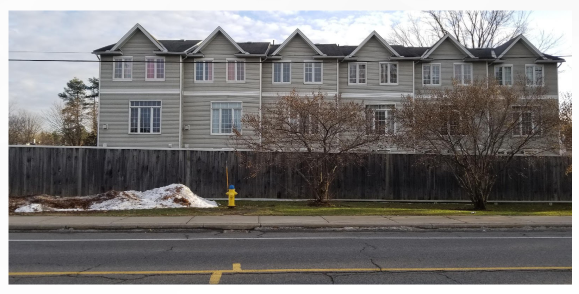
The view to the south and the rear yards of 6-unit townhouse row on Scotland Private.