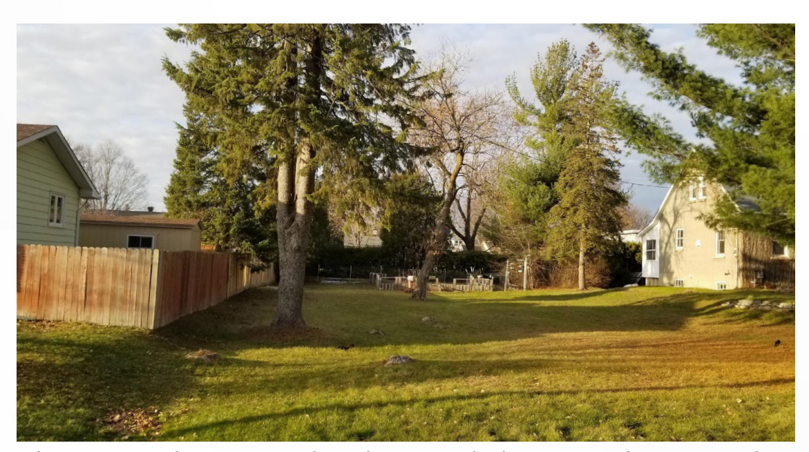
The western and rear property boundary – note hedge at rear to be maintained.