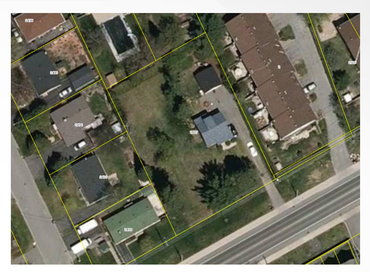
Aerial view of 2487 Innes Road