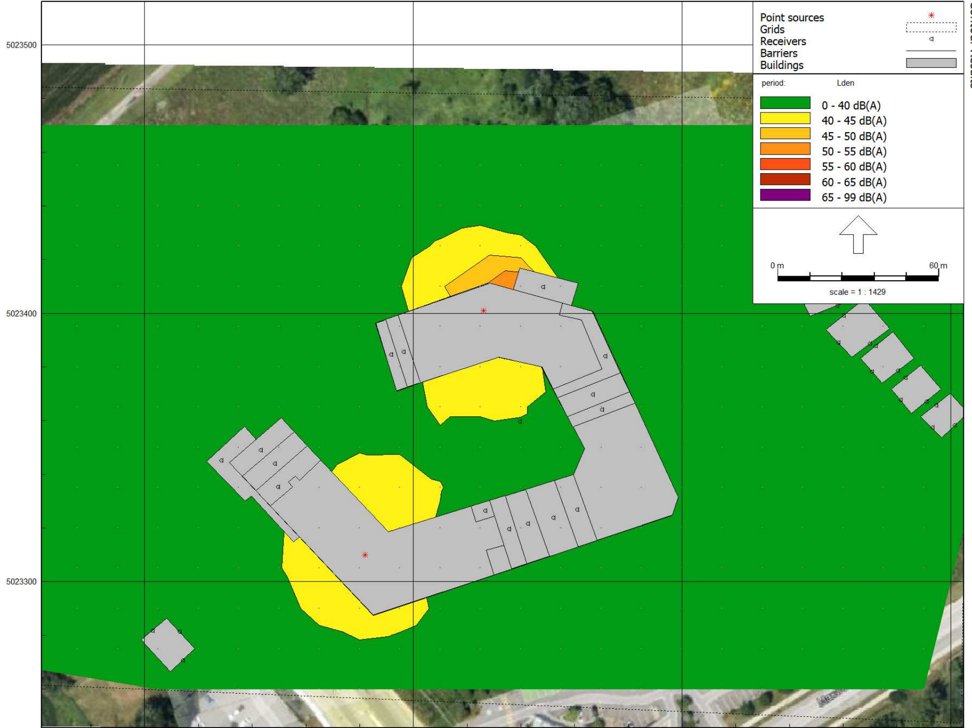
Figure 2 - Initial Analysis (Contour Results)