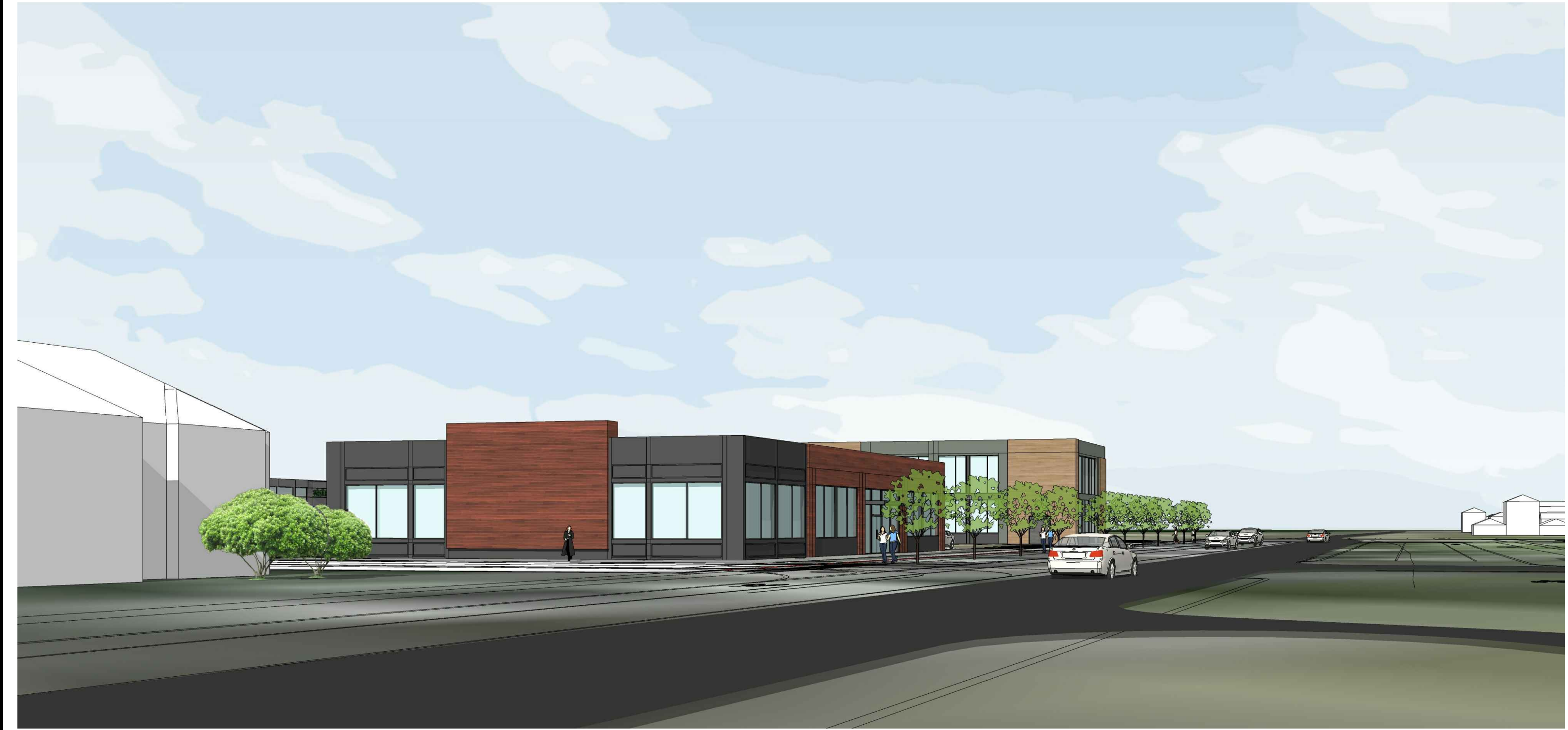
STREET VIEW LOOKING WEST DOWN CAMBRIAN ROAD