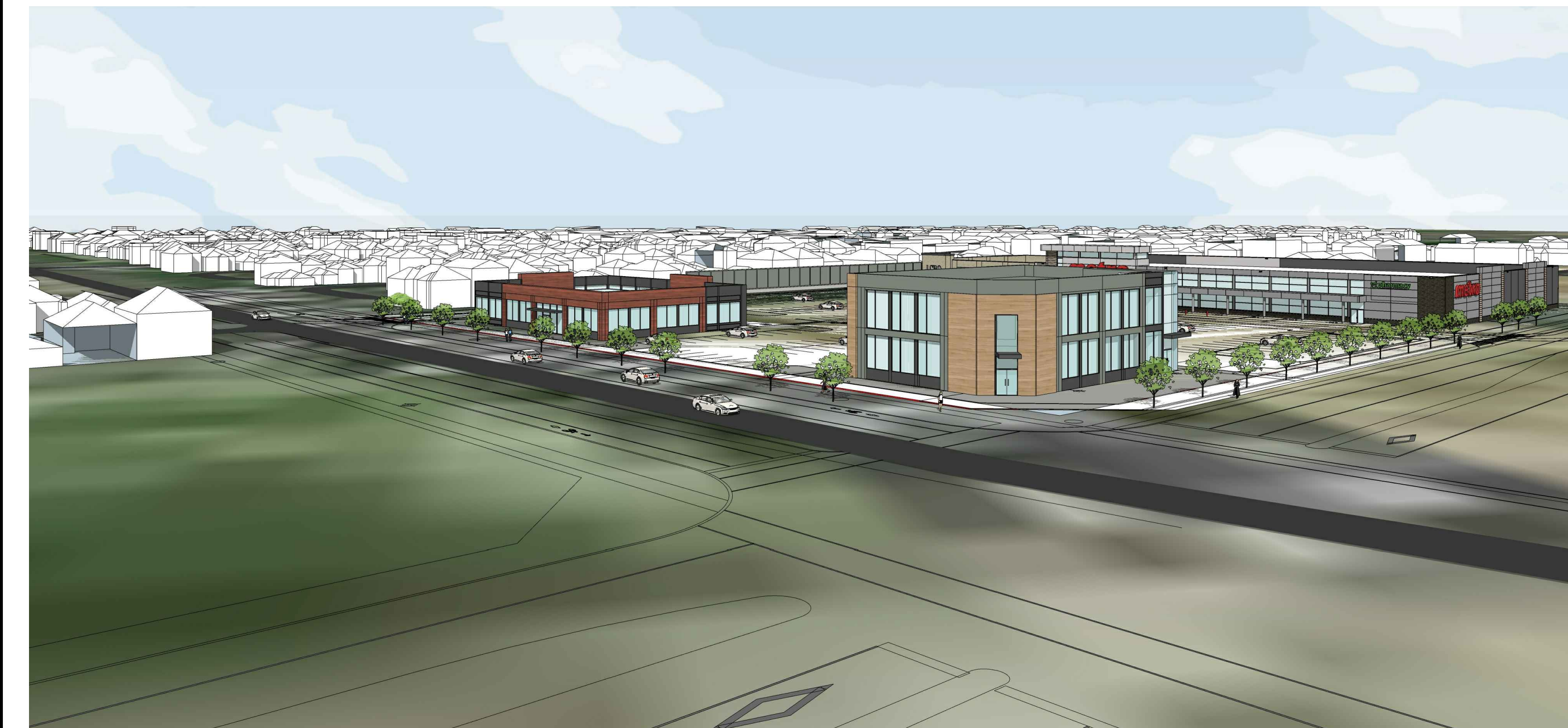
AERIAL VIEW LOOKING WEST

IT IS THE RESPONSIBILITY OF THE APPROPRIATE CONTRACTOR TO CHECK AND VERIFY ALL DIMENSIONS ON SITE AND TO REPORT ALL ERRORS AND/OR OMISSIONS TO THE ARCHITECT. ALL CONTRACTORS MUST COMPLY WITH ALL PERTINENT CODES AND BY-LAWS. THIS DRAWING MAY NOT BE USED FOR CONSTRUCTION UNTIL SIGNED BY THE ARCHITECT. DO NOT SCALE DRAWINGS. COPYRIGHT RESERVED.