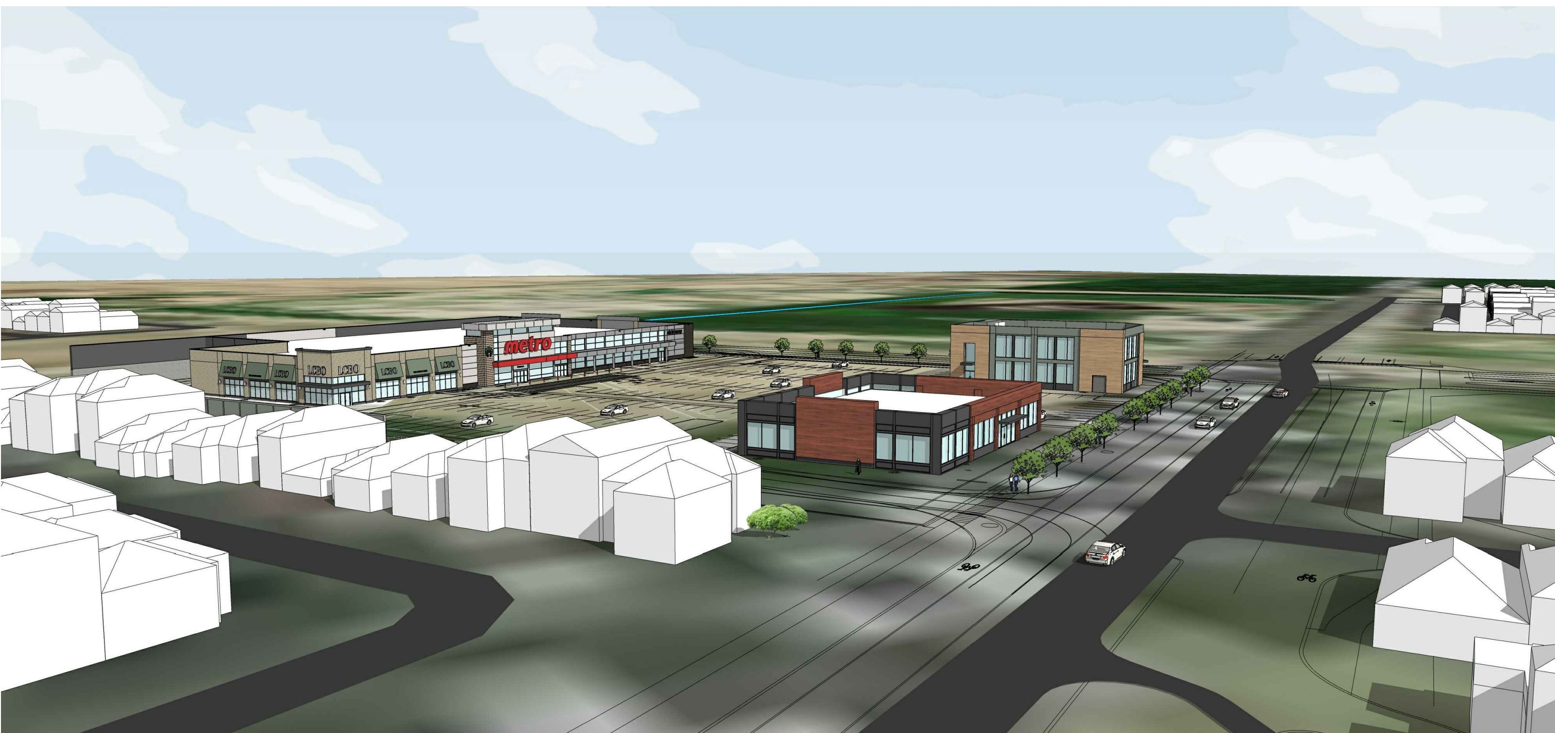
AERIAL VIEW LOOKING SOUTH - EAST