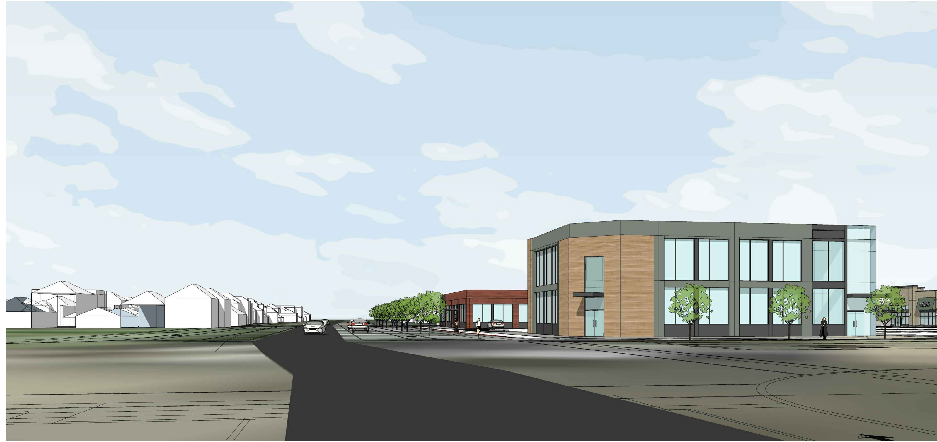
STREET VIEW LOOKING EAST UP CAMBRIAN ROAD