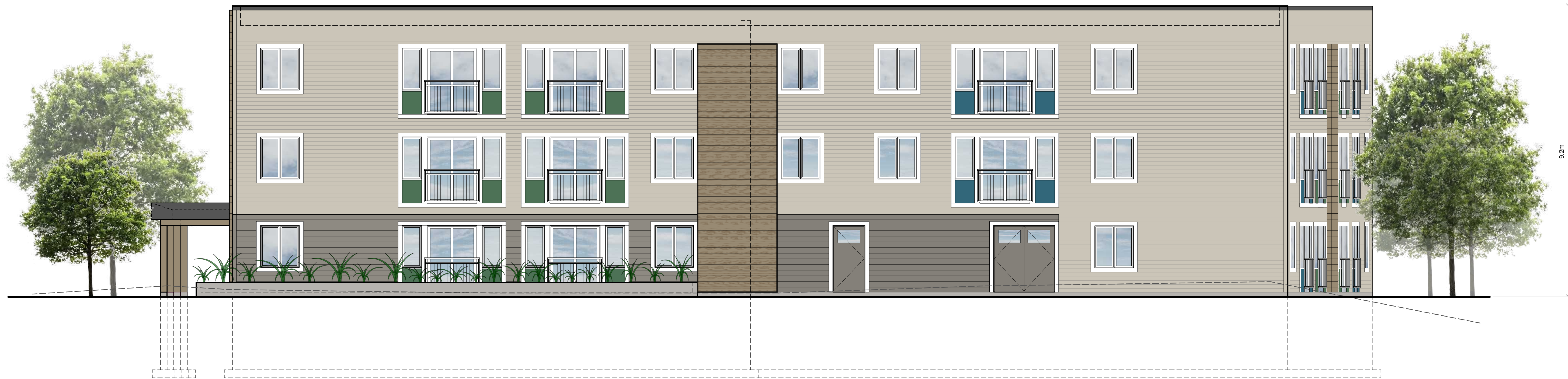
2 SOUTH ELEVATION A-10