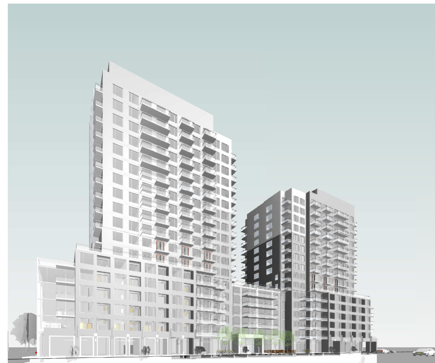
2 3D View LOOKING FROM CARLING AVE. V 01

IT IS THE RESPONSIBILITY OF THE APPROPRIATE CONTRACTOR TO CHECK AND VERIFY ALL DIMENSIONS ON SITE AND TO REPORT ALL ERRORS AND/OR OMISSIONS TO THE ARCHITECT. ALL CONTRACTORS MUST COMPLY WITH ALL PERTINENT CODES AND BY-LAWS. THIS DRAWING MAY NOT BE USED FOR CONSTRUCTION UNTIL SIGNED BY THE ARCHITECT. DO NOT SCALE DRAWINGS. COPYRIGHT RESERVED.