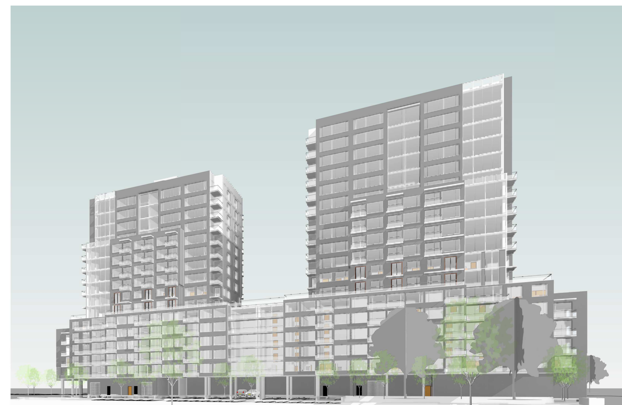
4 3D VIEW LOOKING FROM TILLBURY AVENUE. V 01