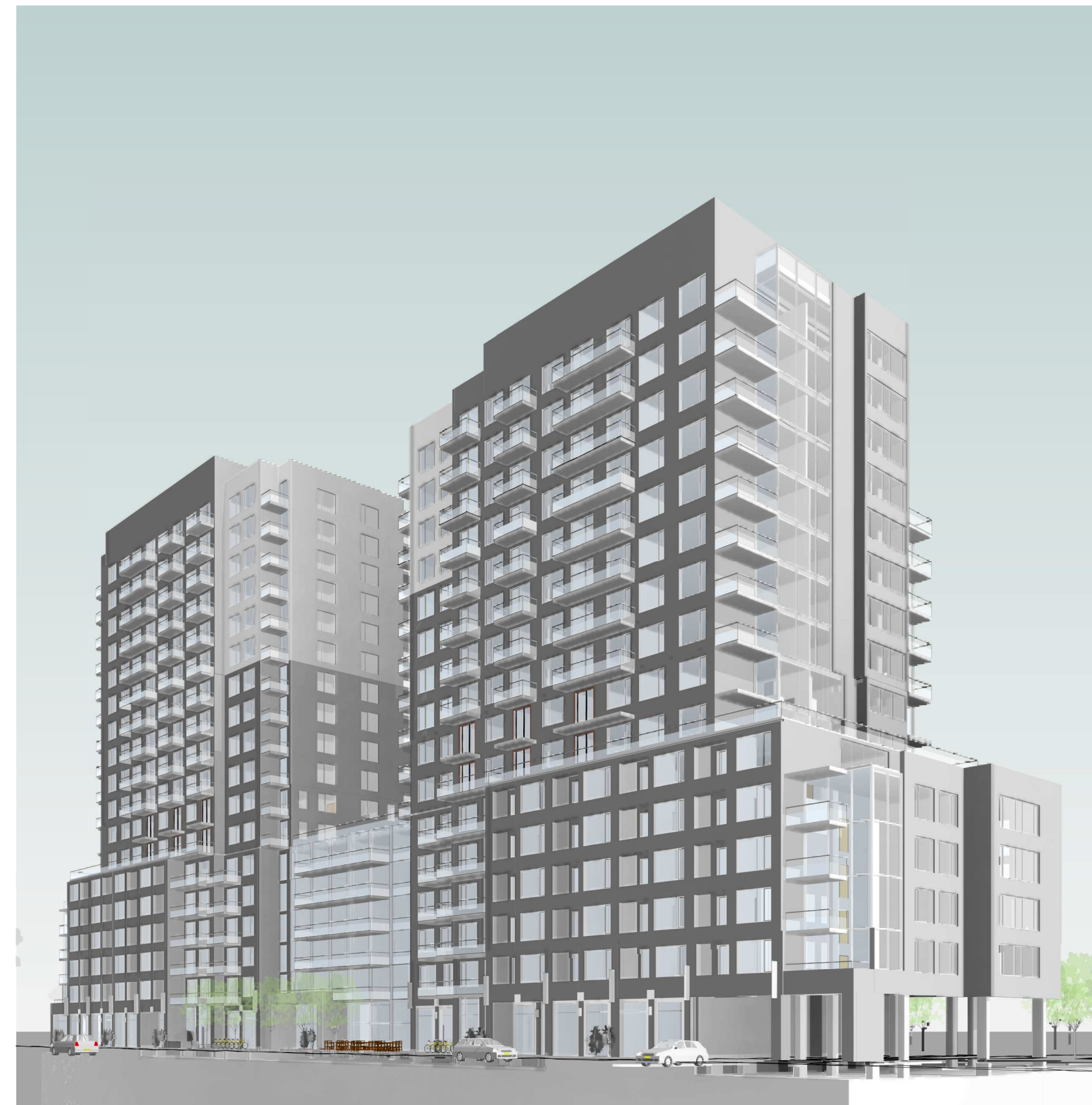
1 3D VIEW LOOKING FROM CARLING AVE. V 01