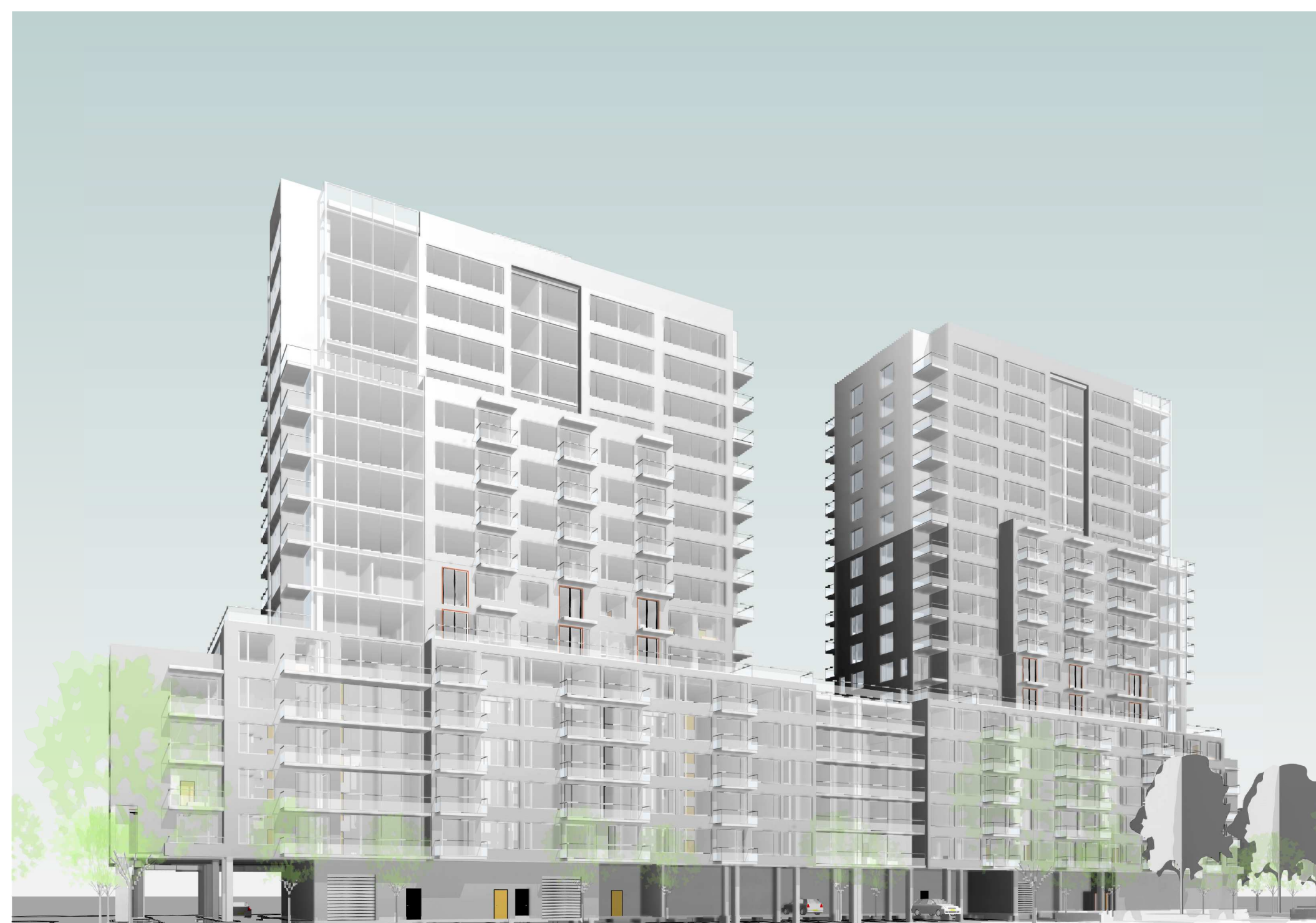
3 3D VIEW LOOKING FROM TILLBURY AVE. V 01