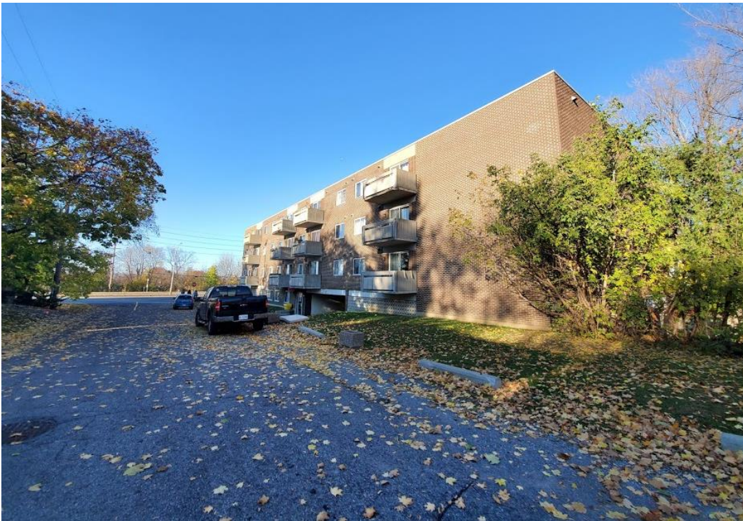
Photo 10: Looking north on Vick Avenue toward Carling Avenue and the apartment building at 2820 Carling Avenue (on the east side of Vick Avenue)