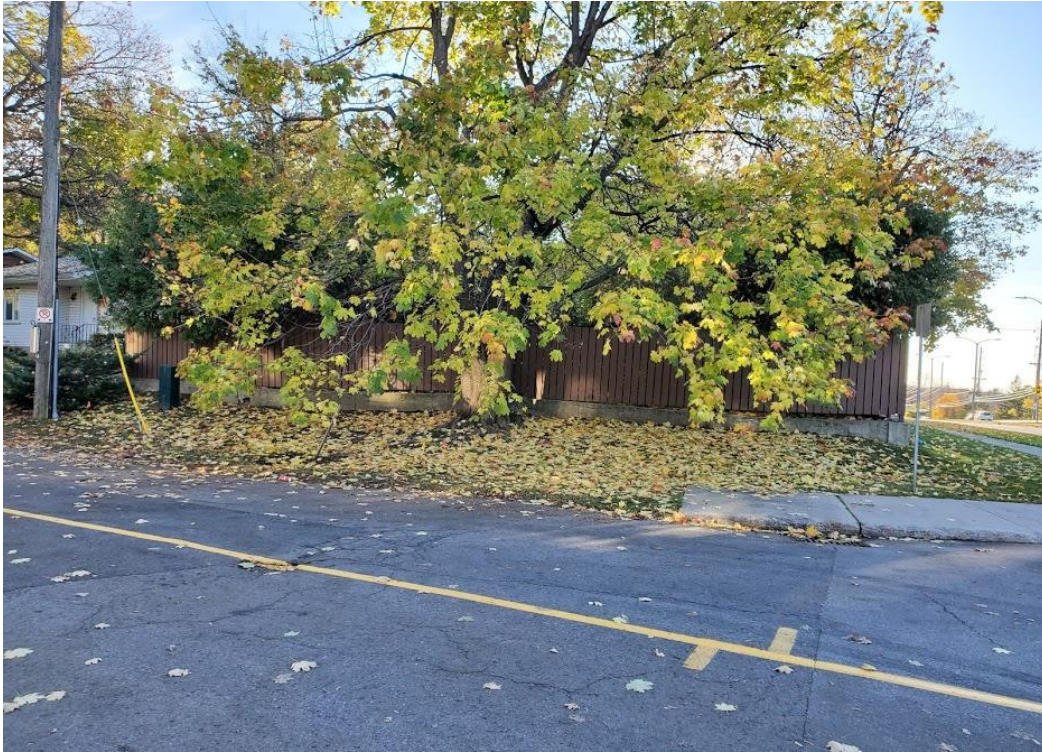
Photo 7: Facing west toward the Subject Property from the east side of Vick Avenue