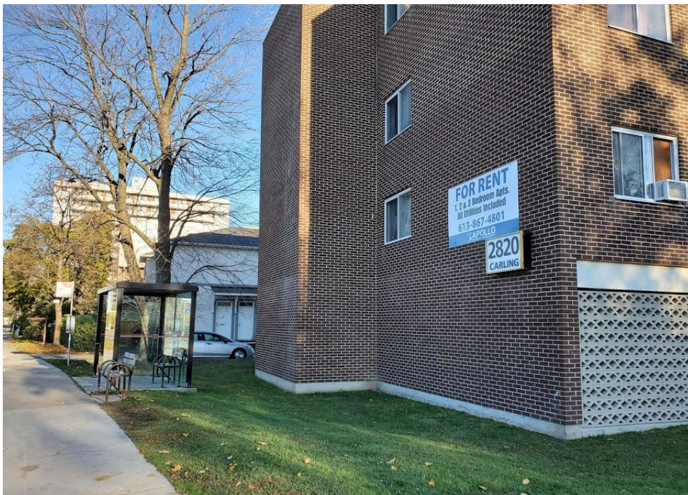
Photo 8: Facing east toward the bus stop in front of 2820 Carling Avenue, just east of the intersection with Vick Avenue