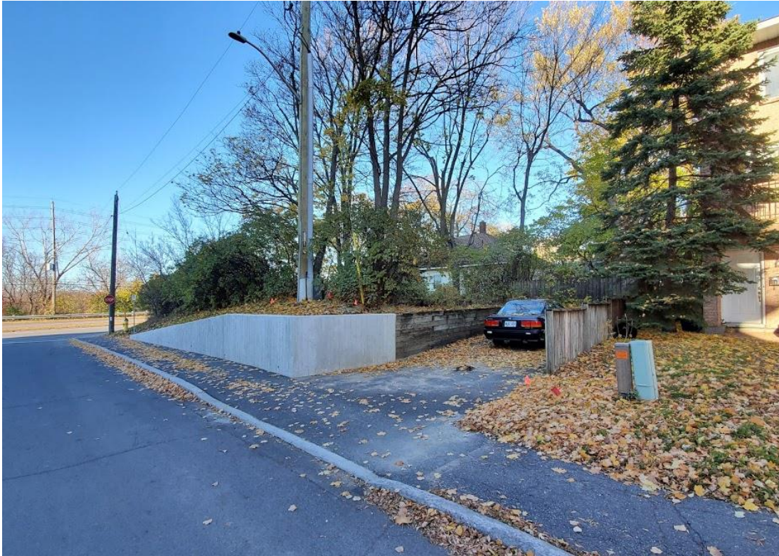
Photo 15: View of the driveway of 2830 Carling Avenue, forming part of the Subject Property