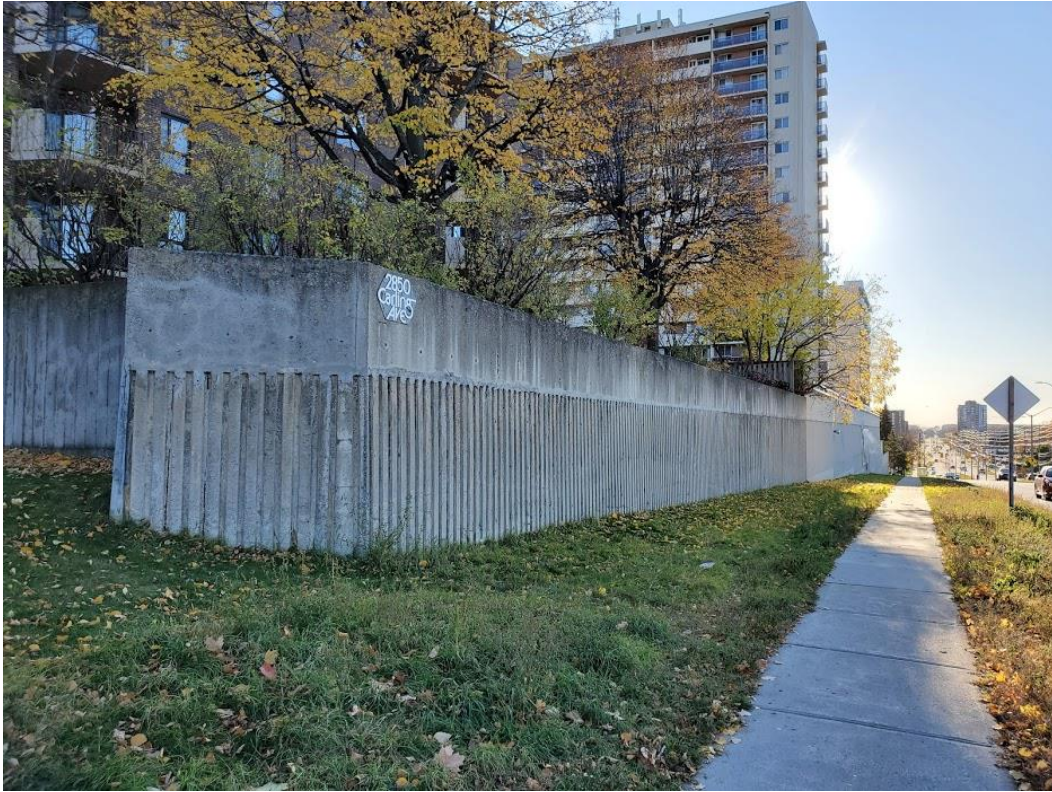
Photo 3: Facing west from 2850 Carling Avenue at the intersection of Carling Avenue and Judge Street