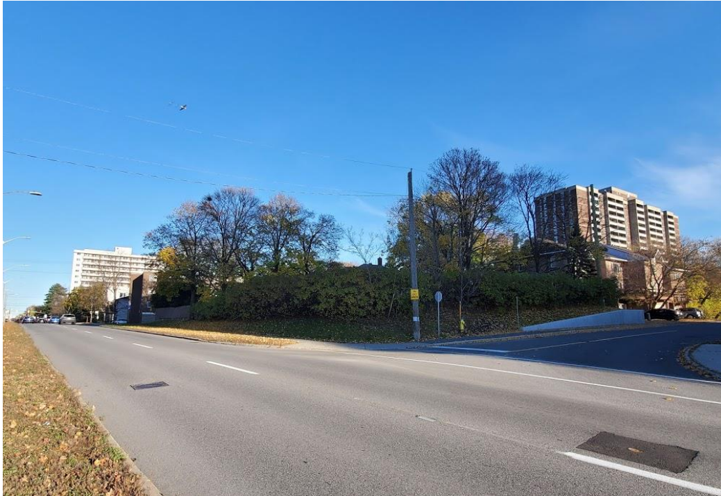
Photo 1: View of the Subject Property from the Carling Avenue median at Judge Street