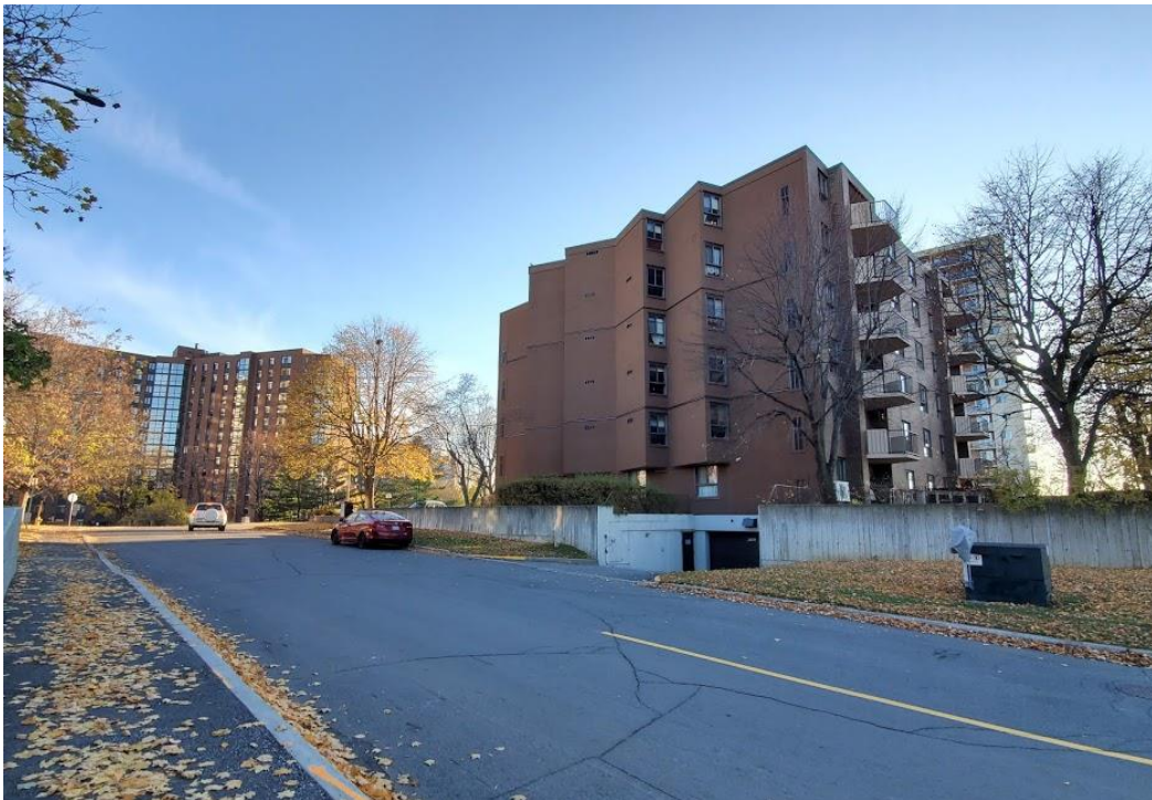
Photo 4: View of the apartment building at 2850 Carling Avenue from the west side of Judge Street