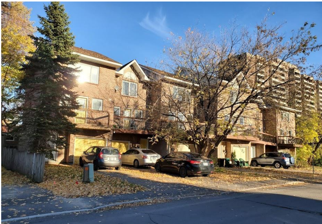
Photo 12: View of the townhouses at 101, 103, 105, 107, 109 and 113 Judge Street