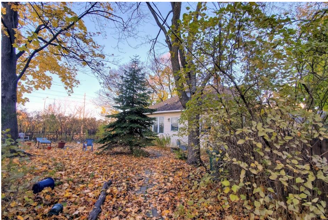
Photo 16: View of the house at 2830 Carling Avenue, forming part of the Subject Property