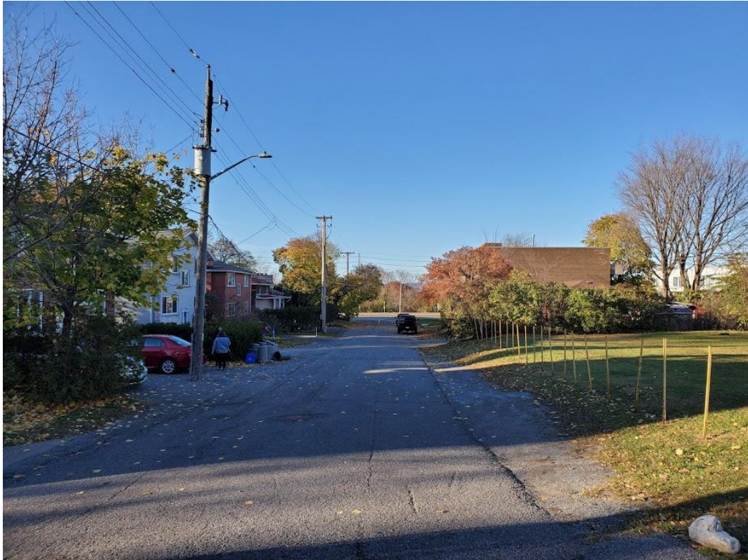
Photo 11: View of Vick Avenue from its south end, with Carling Avenue in the distance