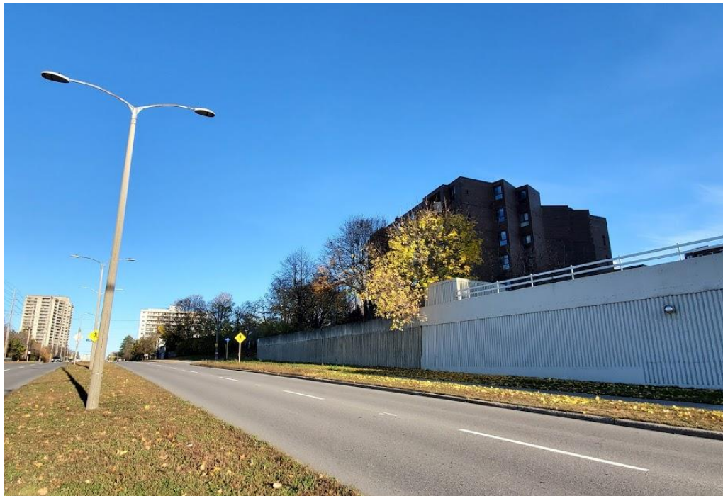
Photo 2: Facing east, adjacent to the retaining wall of the apartment building at 2880 Carling Avenue