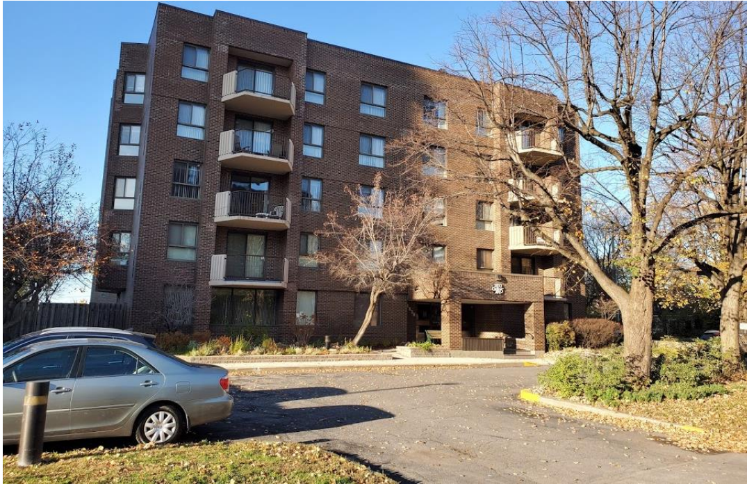
Photo 13: View of the apartment building at 2850 Carling Avenue, from its main entrance off of Judge Street