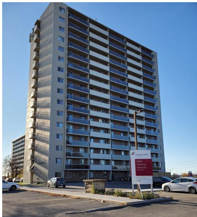
Photo 14: View of the apartment building at 2880 Carling Avenue from Judge Street