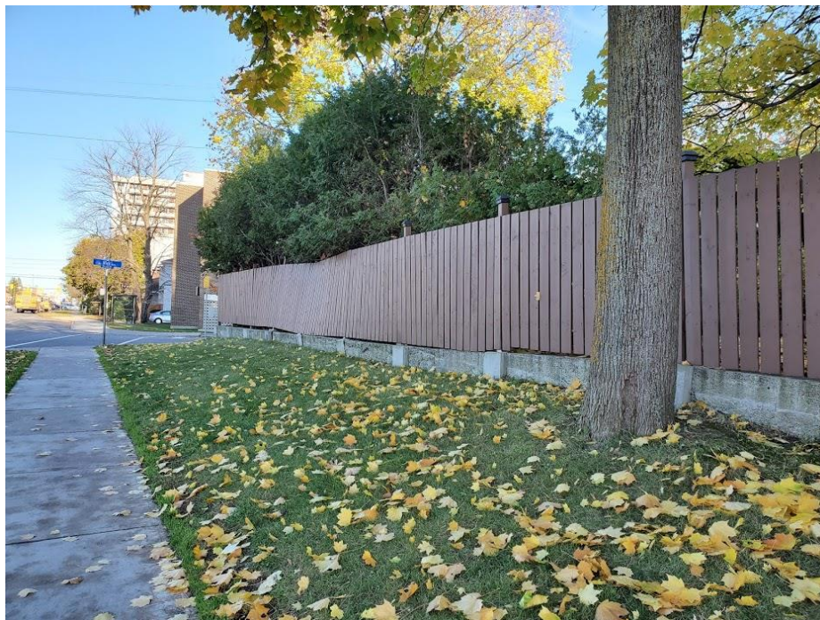
Photo 6: Facing east along the frontage of the Subject Property near Vick Avenue