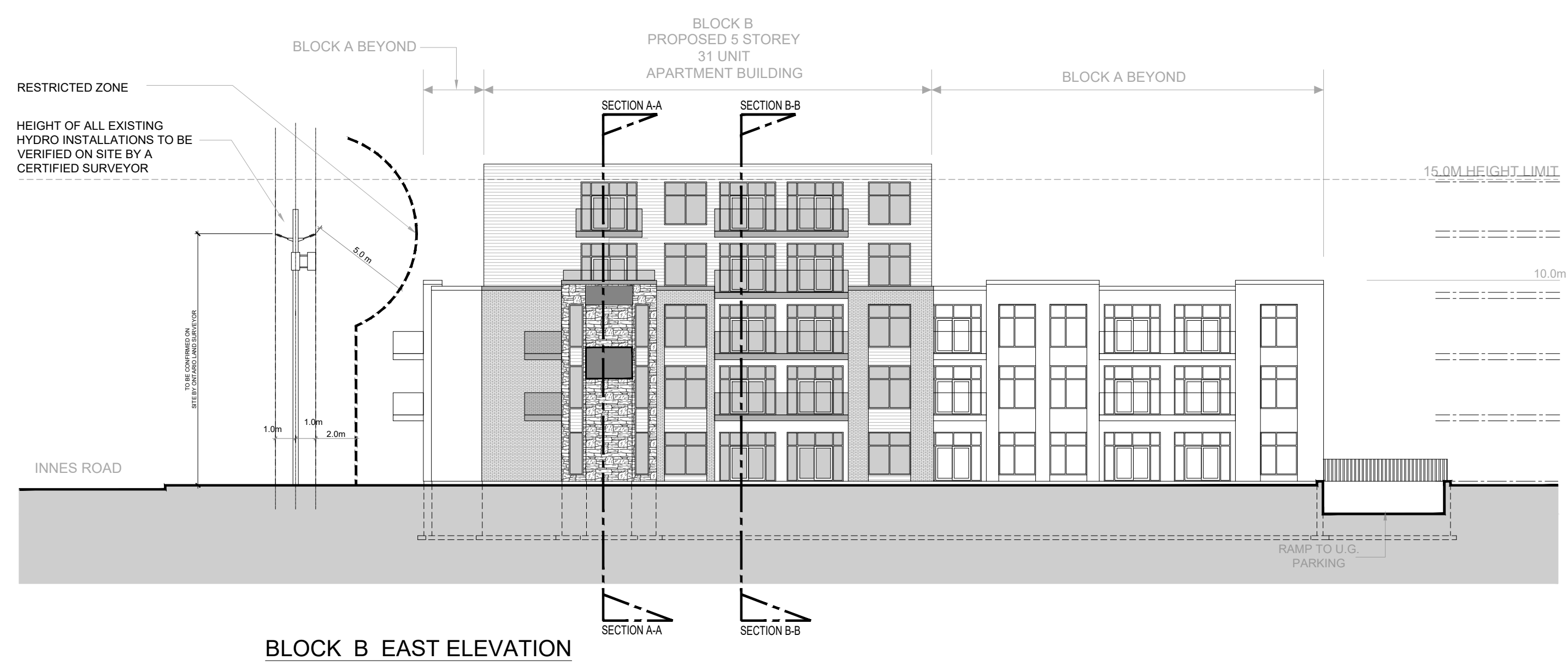
BLOCK B EAST ELEVATION