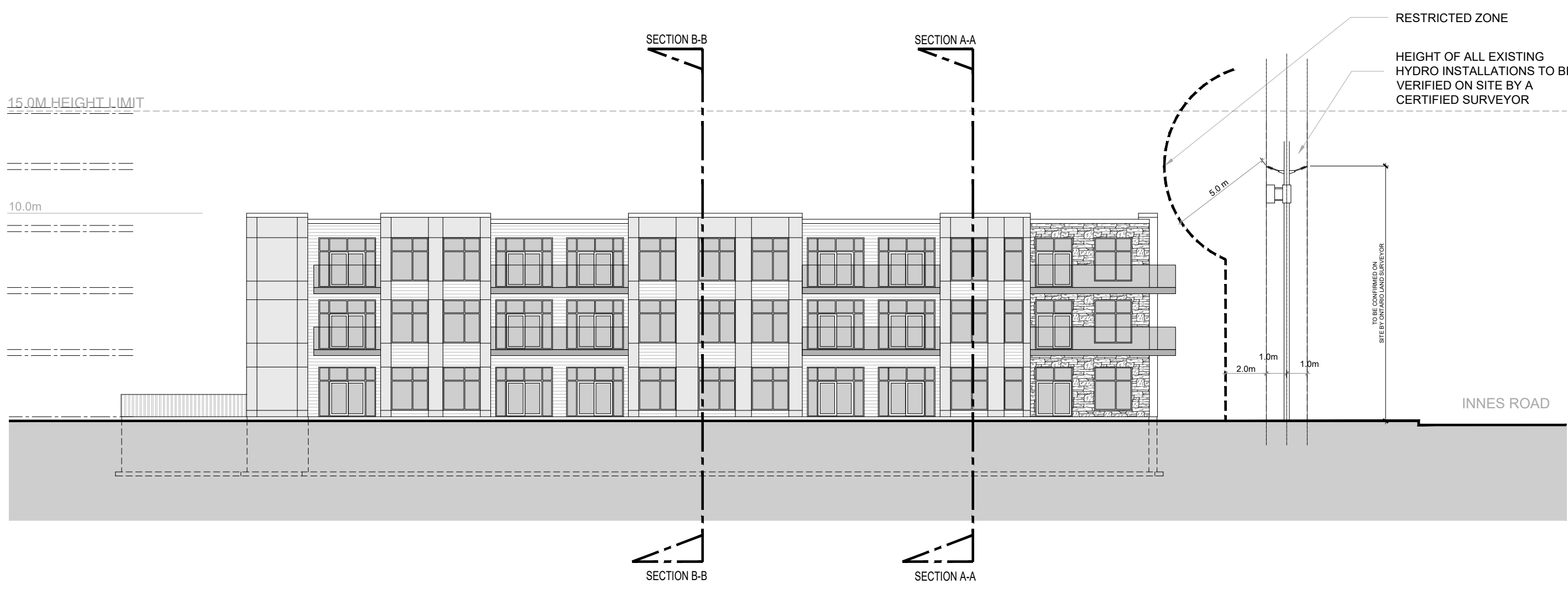
BLOCK A WEST ELEVATION (BLOCK C MIRRORED)