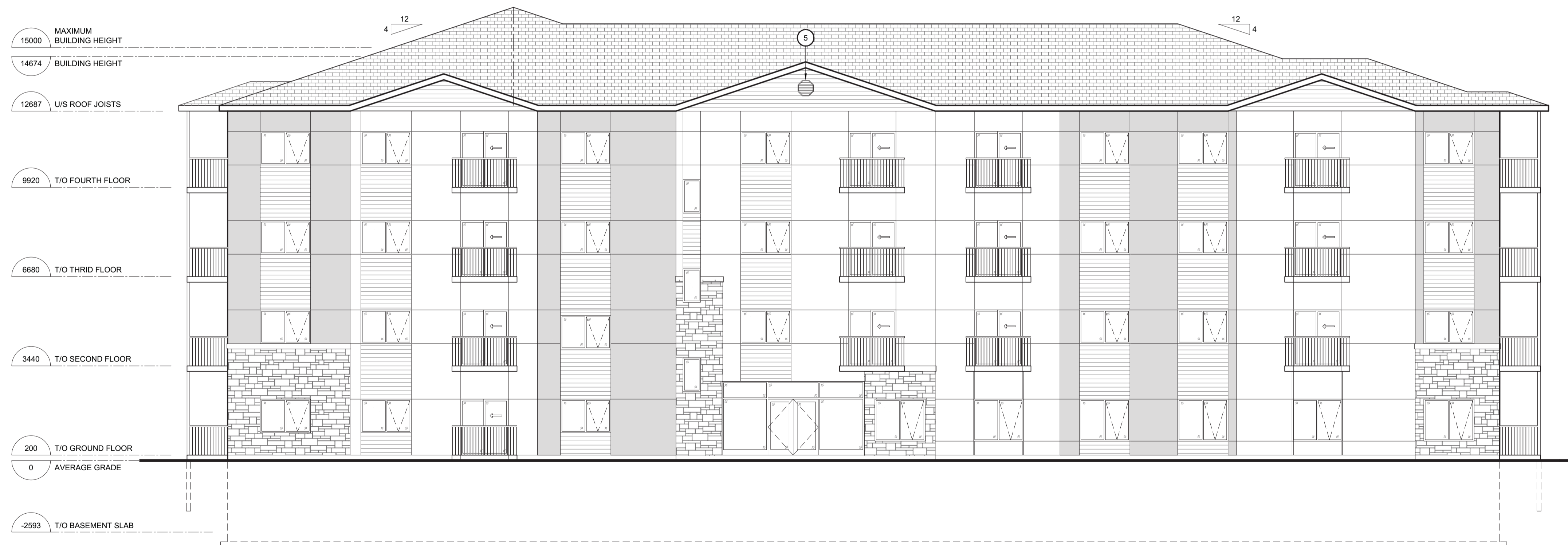
2 South Elevation A5.1 Scale = 1:100

NOTES FOR DRAWING A5.1: REFER TO DRAWING A5.0 FOR NOTES.