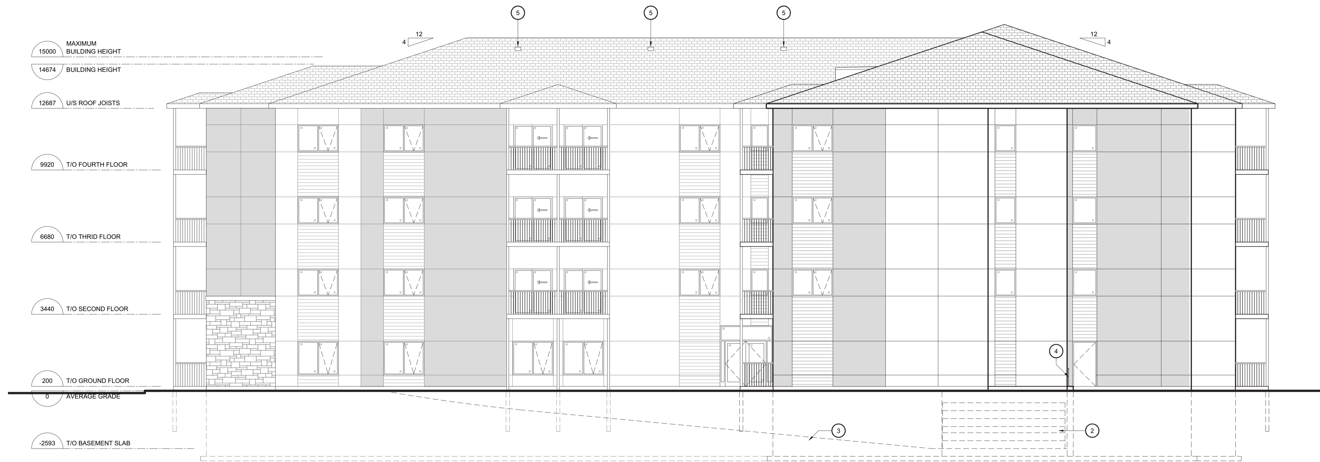
1 North Elevation A5.1 Scale = 1:100