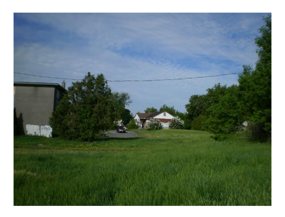
Photo 1 – Central and east portions of the site looking west from the east site edge

No Species at Risk were observed on or adjacent to the site during the field survey. Wildlife observed included American crow, ring-billed gull, European starling, black-capped chickadee, American robin, mourning dove, song sparrow, chipping sparrow. American goldfinch, red squirrel, eastern cottontail, and woodchuck. No potential cavities trees, stick nests or other evidence of raptor use were observed.