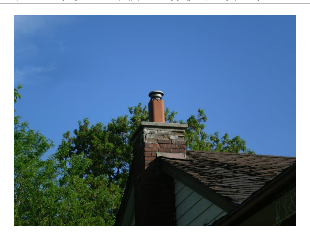
Photo 6 – Chimneys on the central and west residences are vented. This example is on the residence in the northwest portion of the site. View looking north