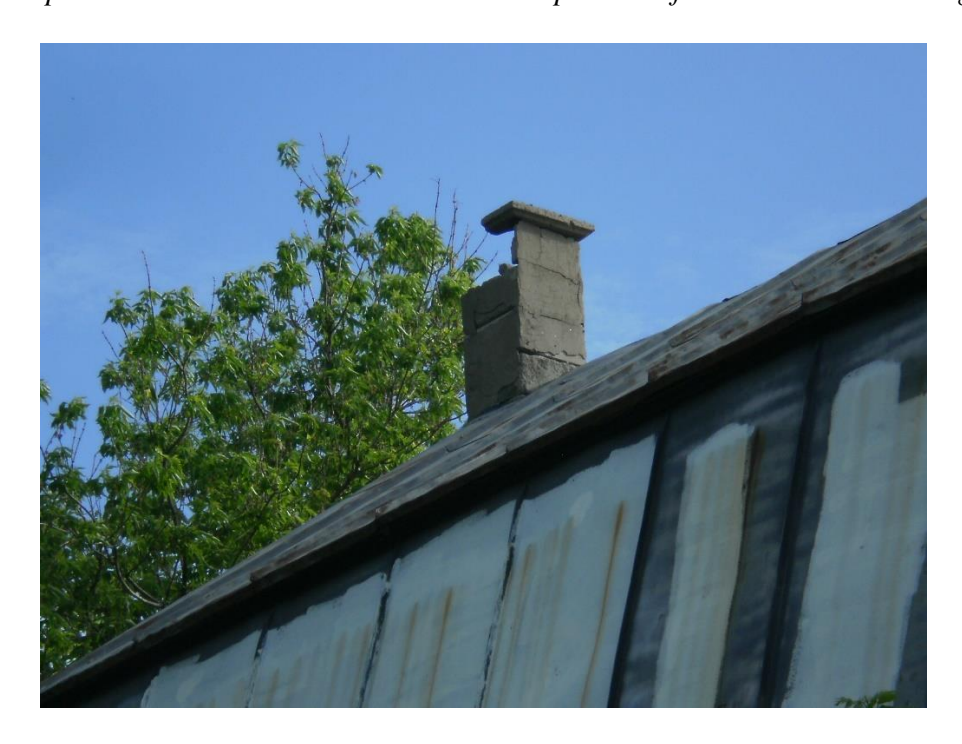
Photo 7 – Concrete chimney on the residence in the northeast portion of the site is in poor condition and open. View looking east