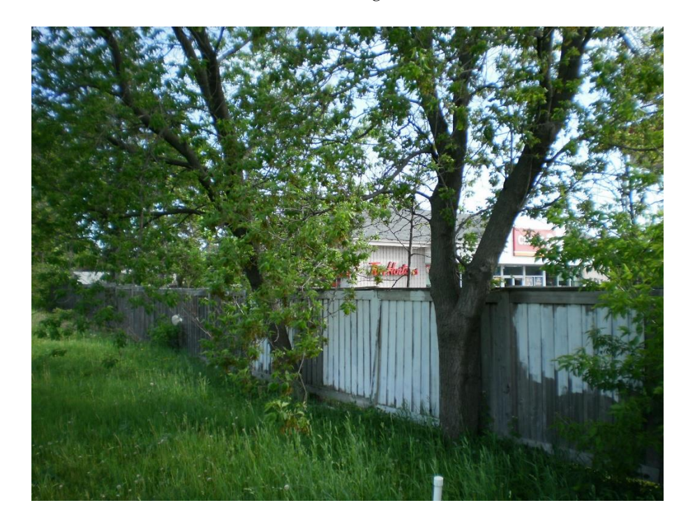
Photo 3 – Manitoba maple along the east site edge. View looking northeast