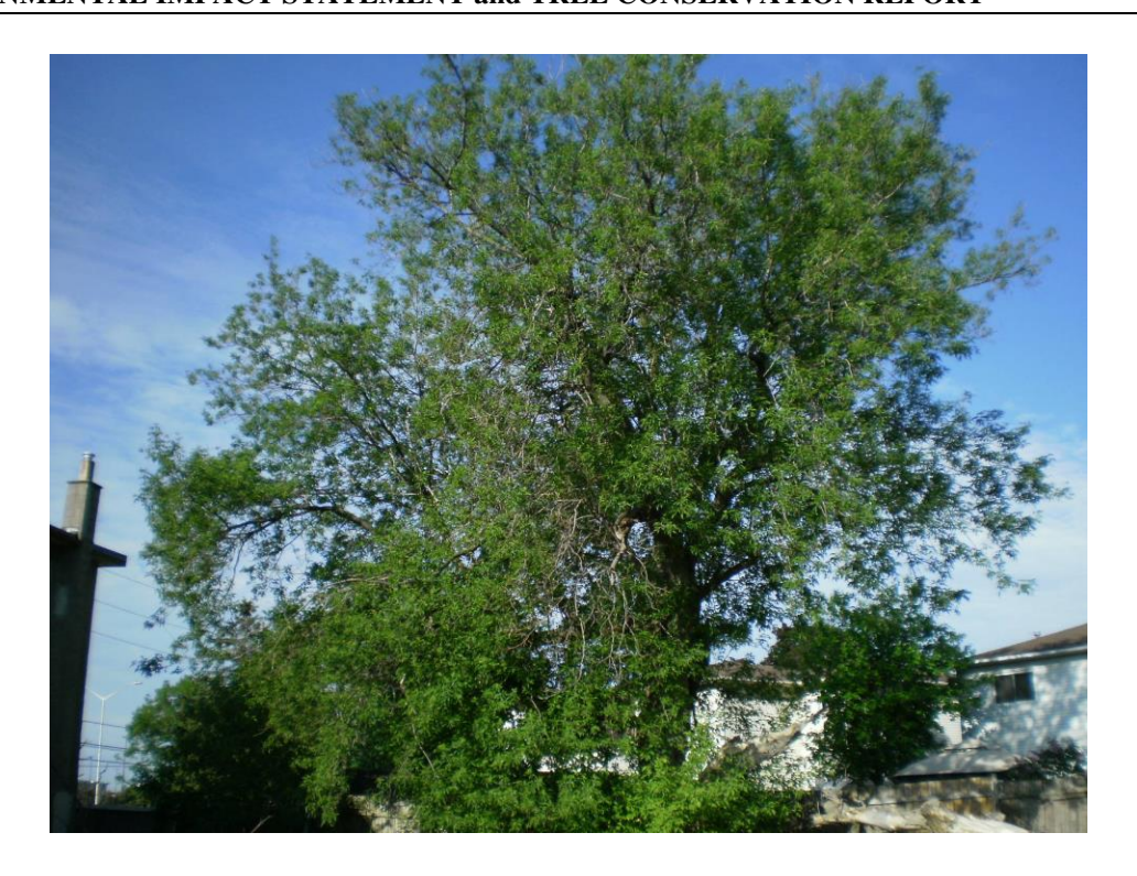
Photo 2 – Mature Manitoba maple along the west edge of the site. View looking west