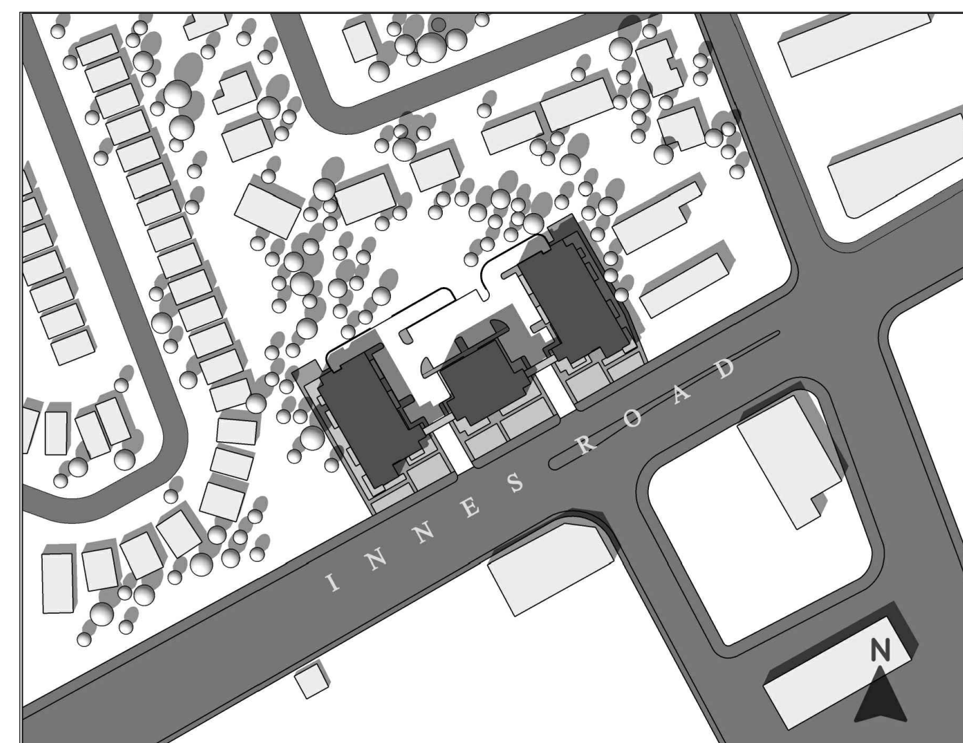
SEP 21ST - 03PM