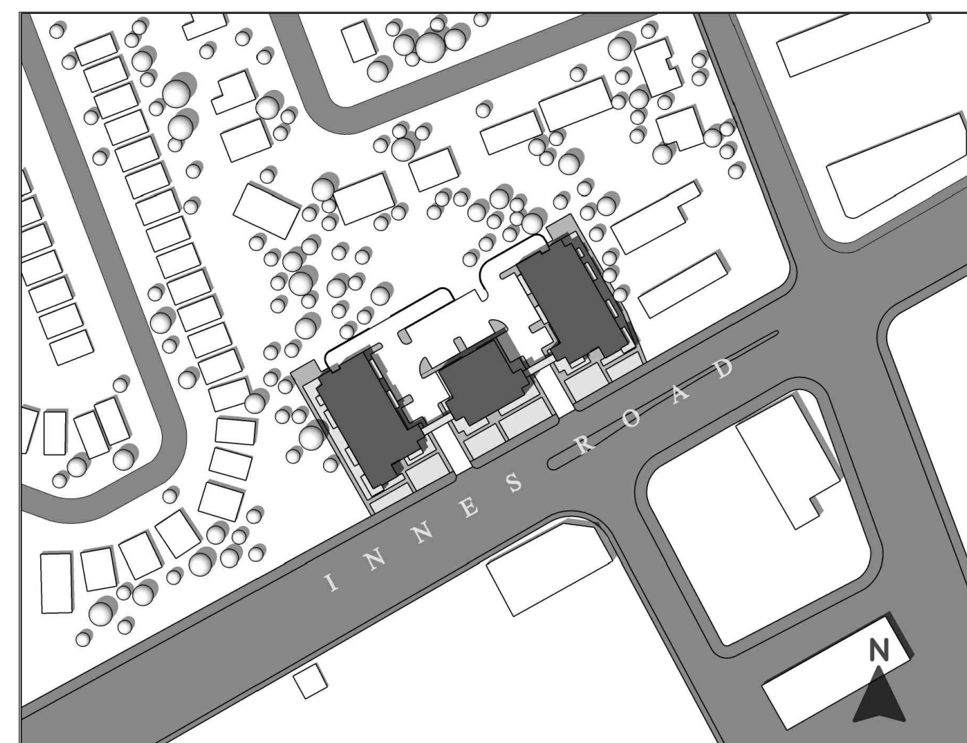
JUN 21ST - 03PM