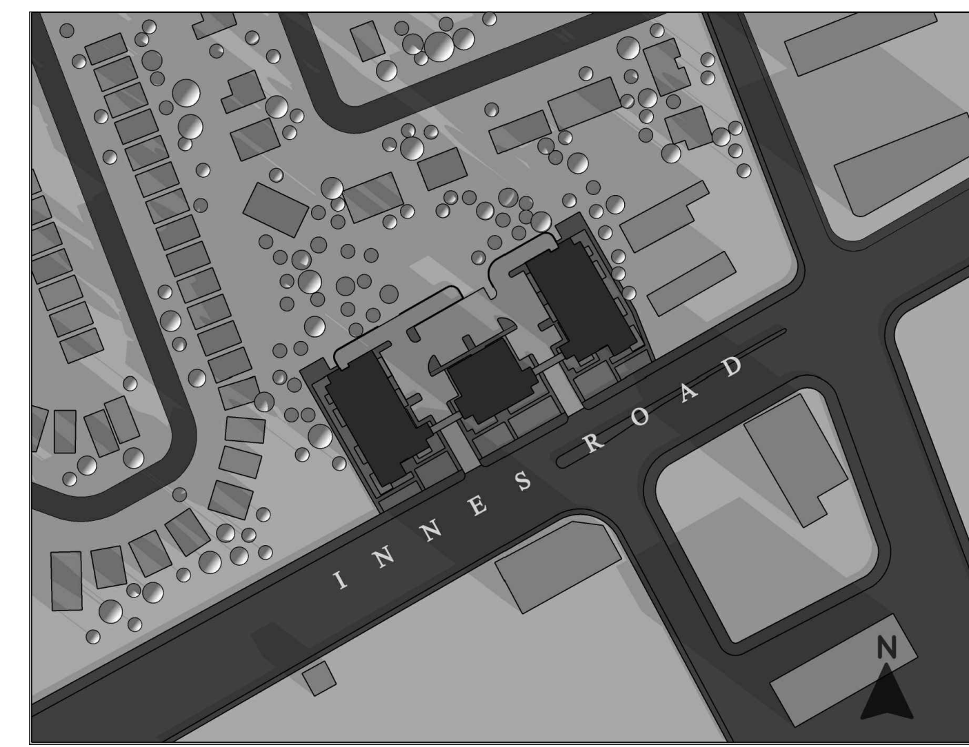
DEC 21ST - 10AM