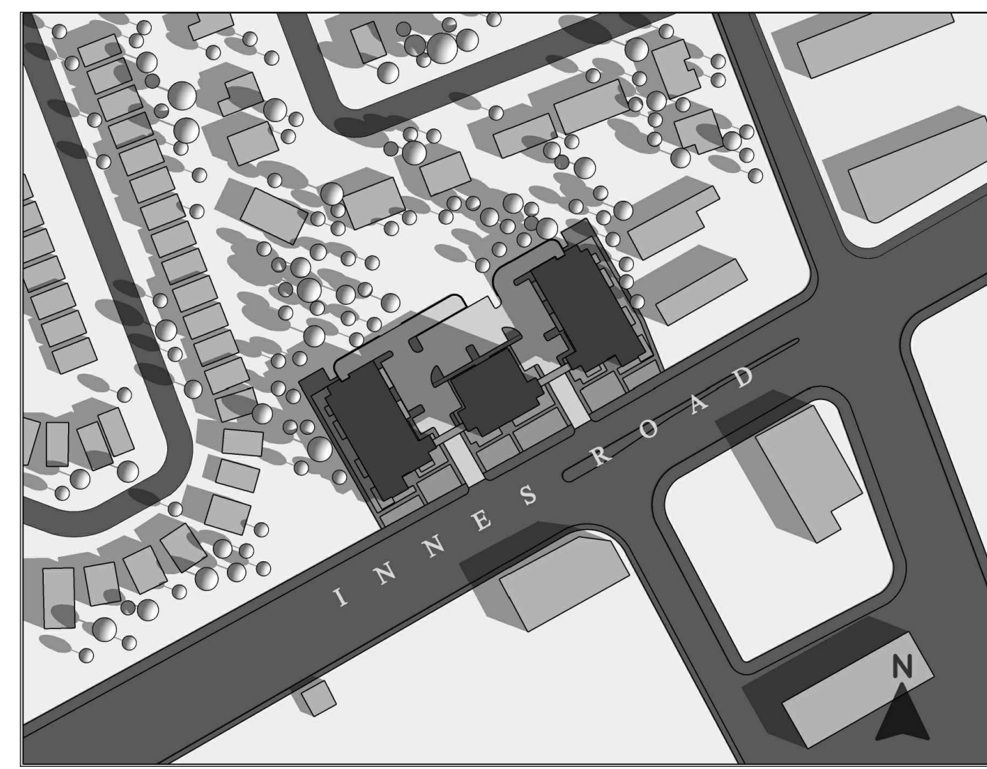
SEP 21ST - 10AM