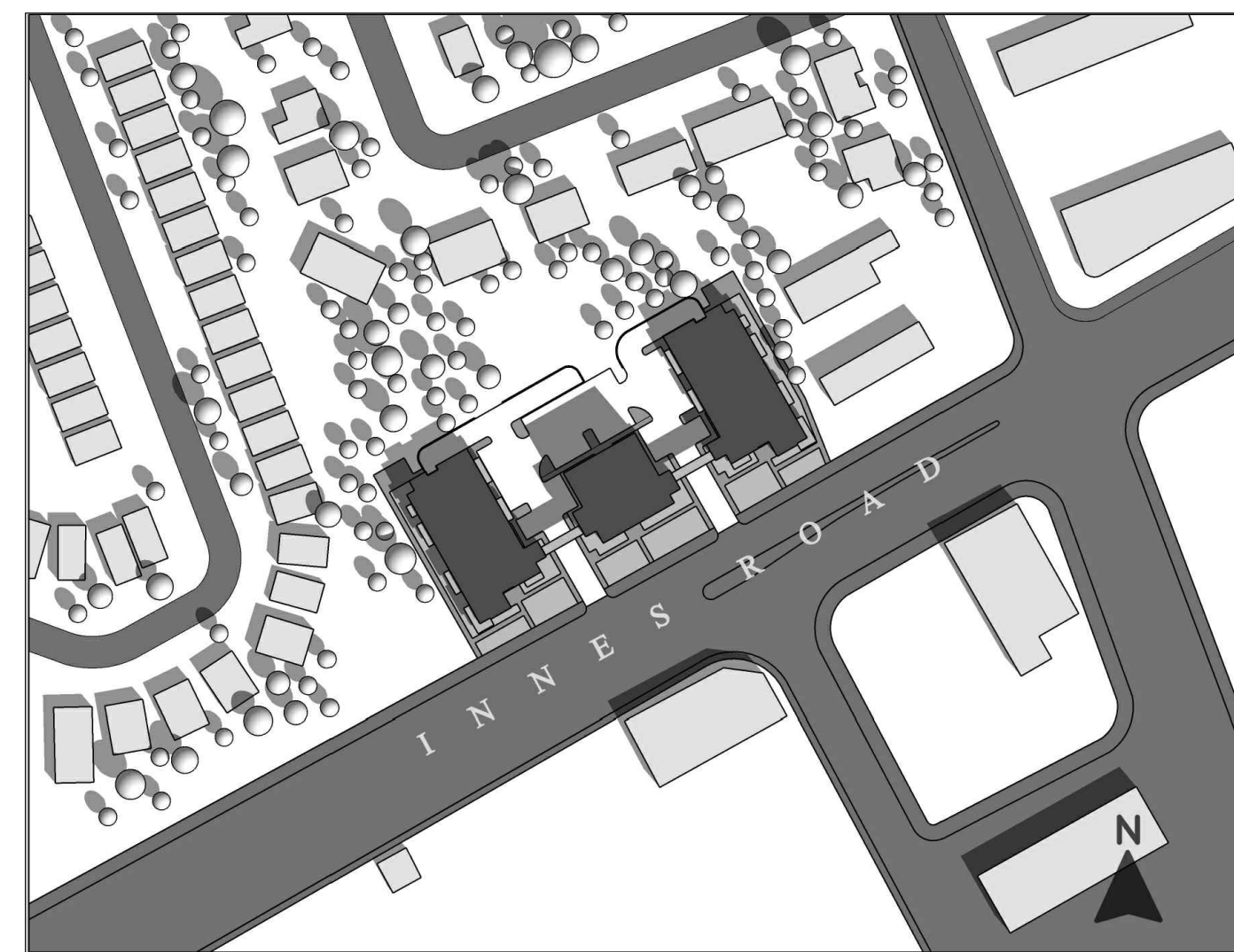
SEP 21ST - 12PM