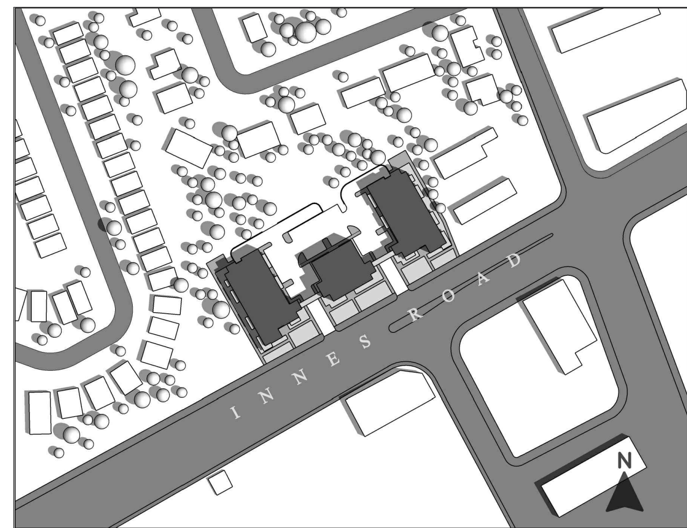
JUN 21ST - 12PM