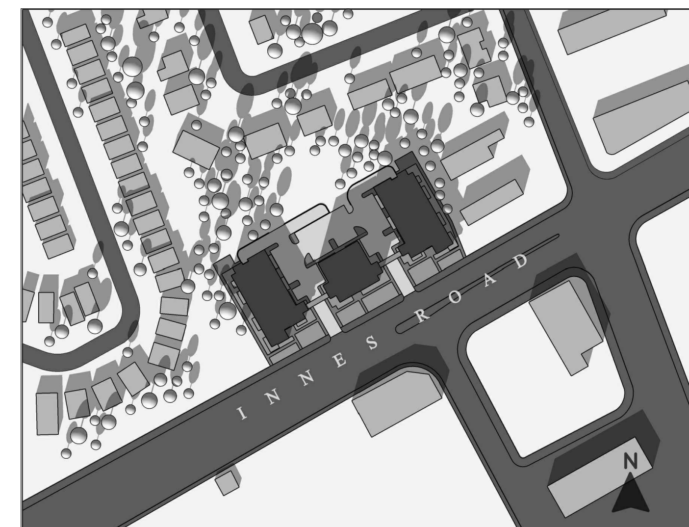
DEC 21ST - 03PM