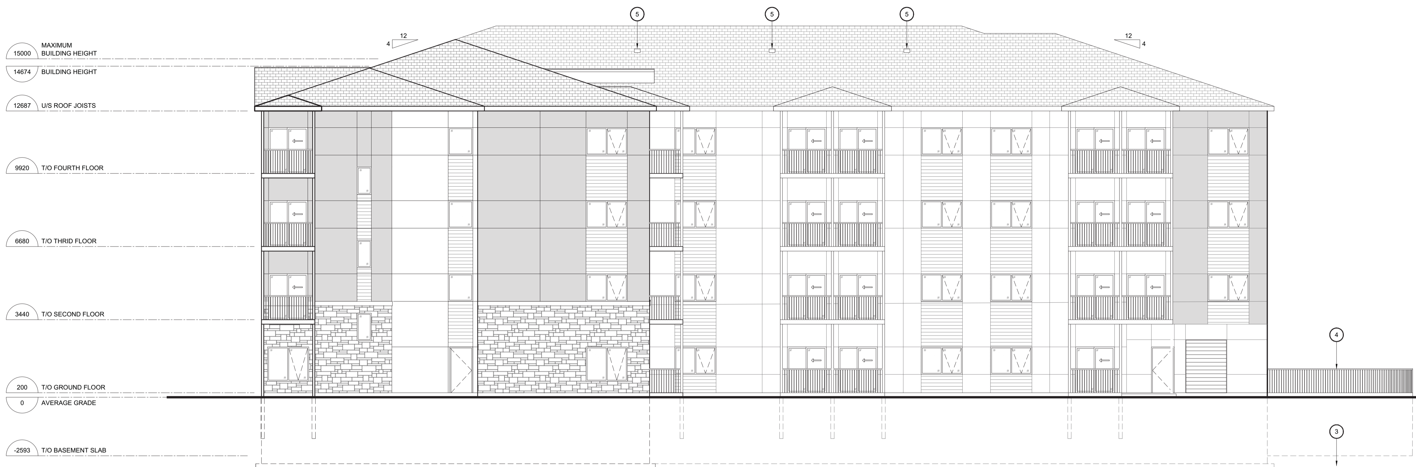
1 A5.2 East Elevation Scale = 1:100