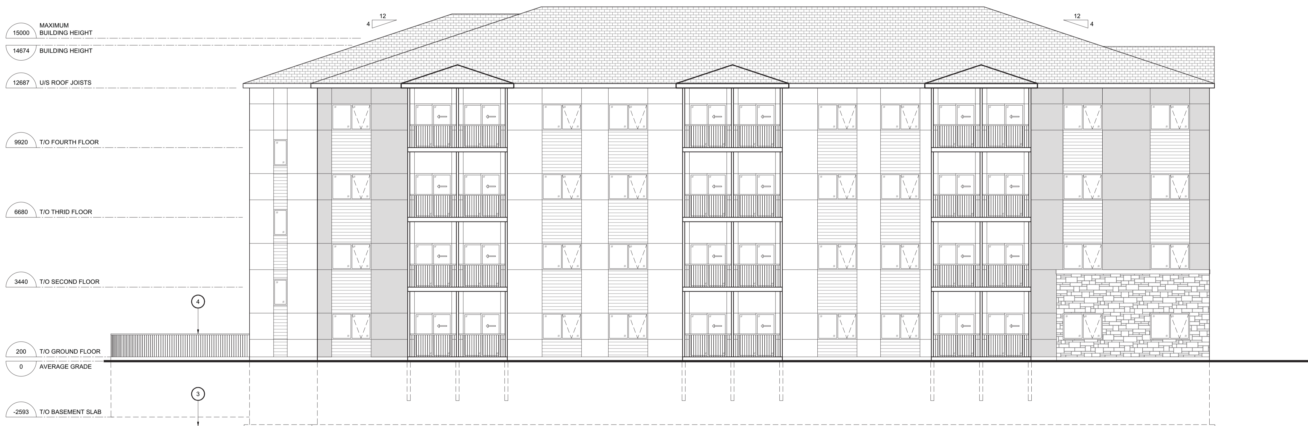
2 A5.2 West Elevation Scale = 1:100

NOTES FOR DRAWING A5.2: REFER TO DRAWING A5.0 FOR NOTES.