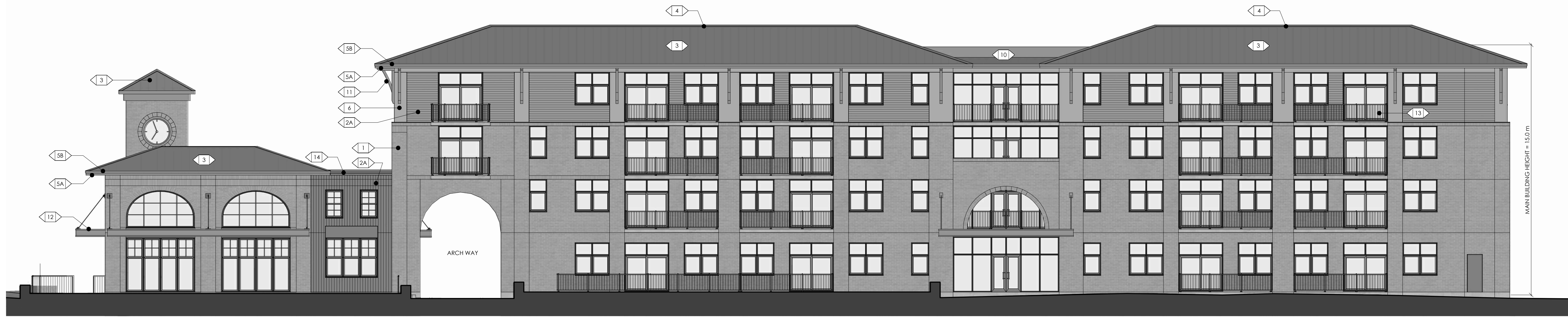
1 NORTH ELEVATION A200 SCALE: 1:125