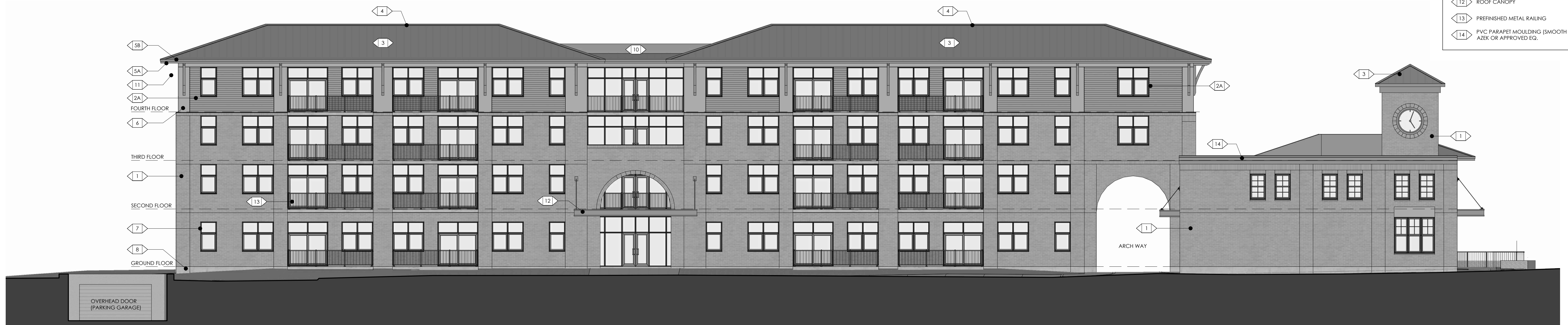
2 SOUTH ELEVATION: PARKING DRIVE AISLE A200 SCALE: 1:125