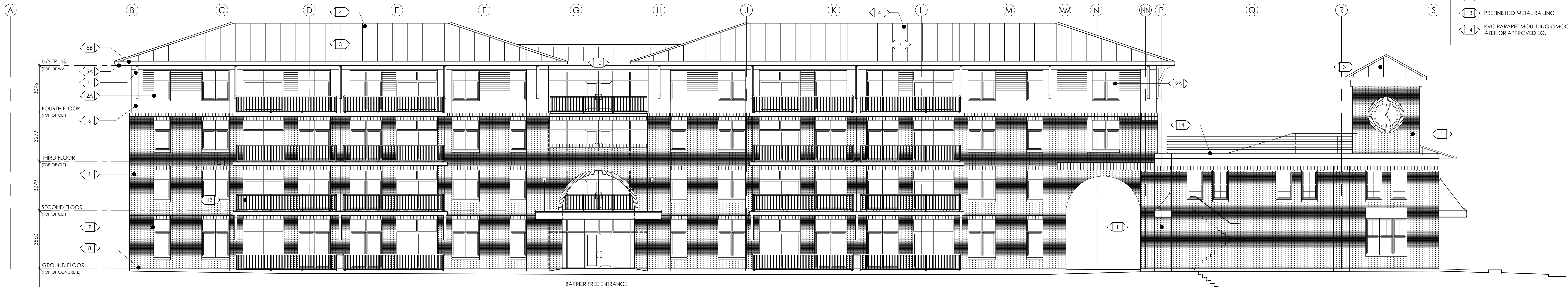
2 SOUTH ELEVATION: PARKING DRIVE AISLE A200 SCALE: 1:125