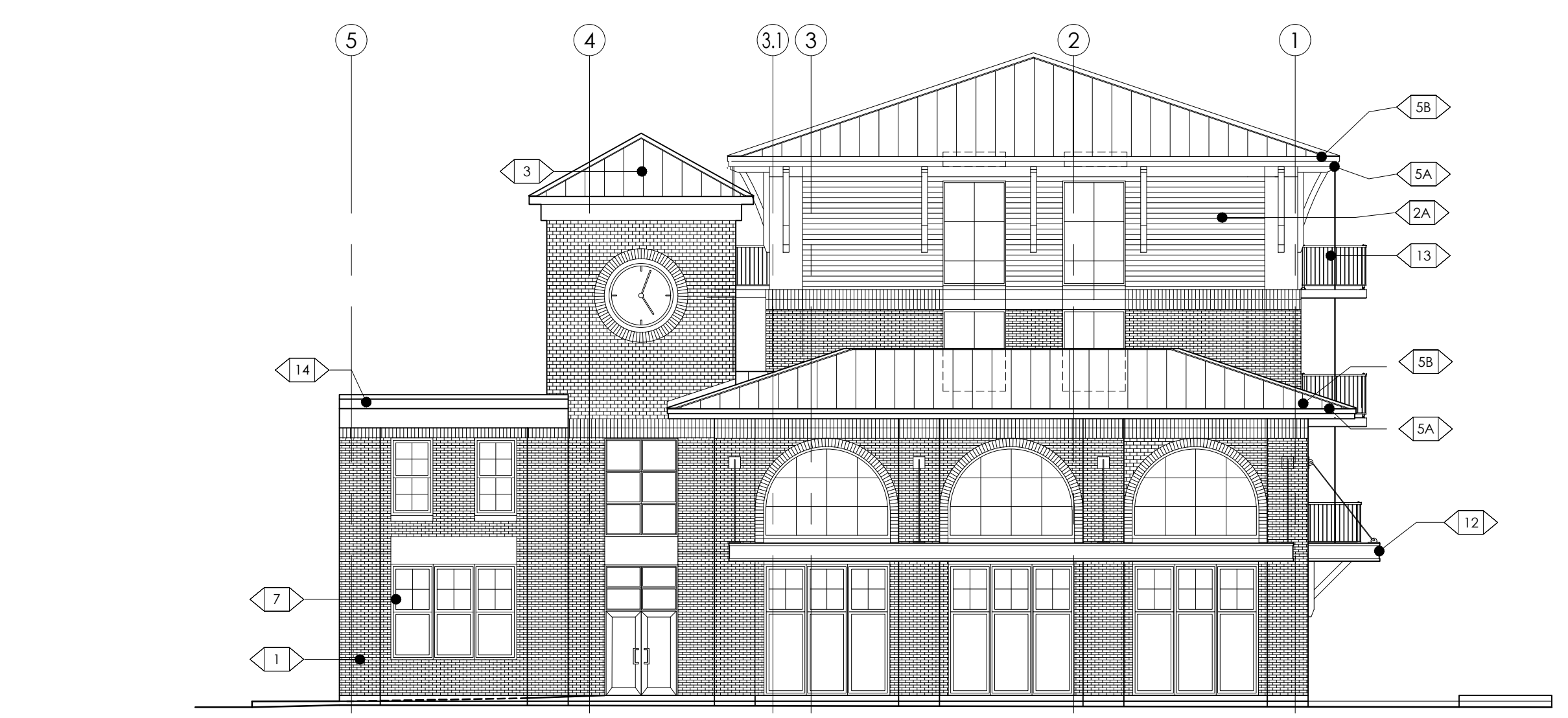
3 EAST ELEVATION: STITTSVILLE MAIN STREET A200 SCALE: 1:125