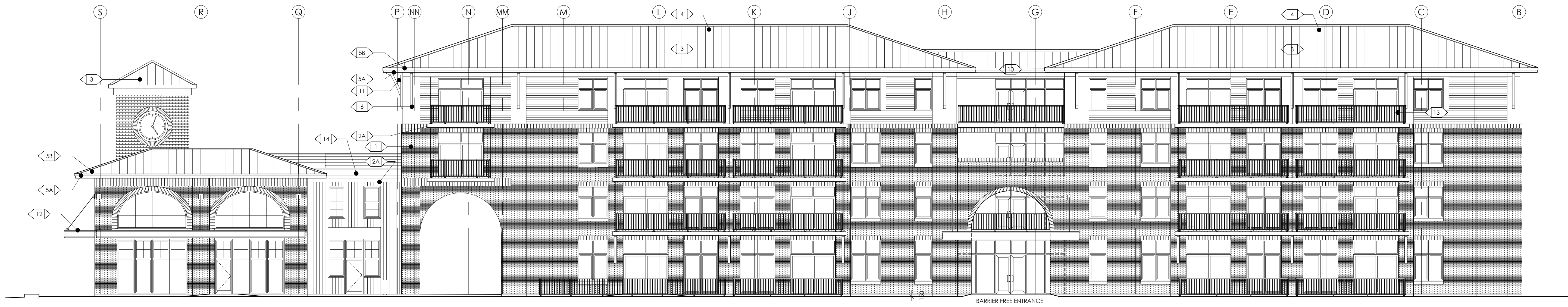
1 NORTH ELEVATION A200 SCALE: 1:125