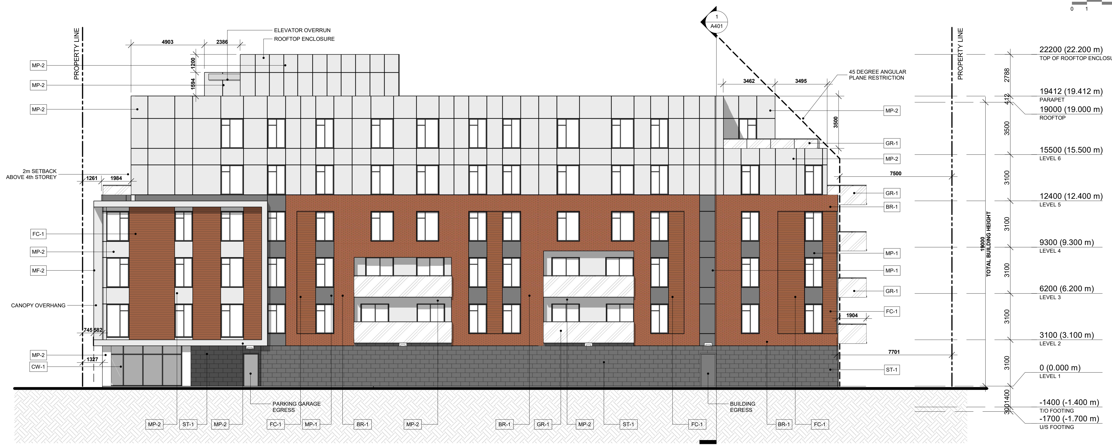
2 WEST ELEVATION 1 : 125

This document and all information herein is confidential and the intellectual property of Rossmann Architects. It is disclosed in confidence on terms that it will not be disclosed to any third party, used, copied, licensed, or reproduced in whole or in any part in any manner or form for manufacturing, rendering or for any other purpose without the written permission of Rossmann Architects. The copyright is retained by Rossmann Architects and Associates Inc. Ce document, ainsi que tous renseignements contenus à l'intérieur, est la propriété de Rossmann Architects. Il est divulgué en confiance sous les termes qu'il ne sera pas divulgué à aucun tiers partie, utilisé, vendu, prêté, licencié ou reproduit en son entier ou en partie d'aucune manière pour la manufacture, soumission ou pour autres fins sans la permission écrite de Rossmann Architects. Le droit d'auteur est retenu par Rossmann Architects.