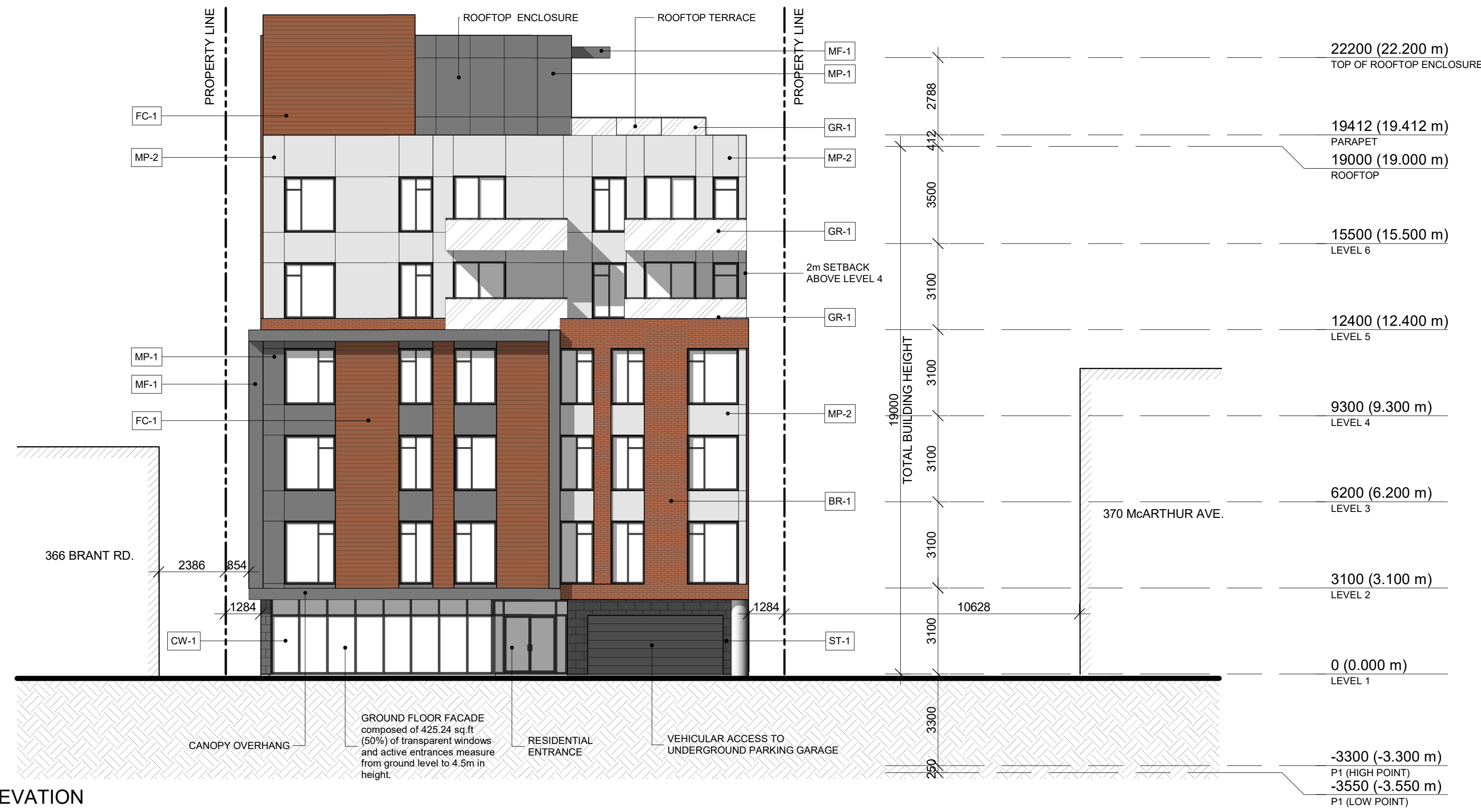
1 NORTH ELEVATION 1:125

GENERAL NOTES NOTE-A: ALL DRAWINGS ARE TO BE READ IN CONJUNCTION WITH ALL OTHER DRAWINGS AND SPECIFICATIONS, INCLUDING OTHER CONSULTANTS DRAWINGS AND SPECIFICATIONS. ANY DISCREPANCIES BETWEEN DRAWINGS WILL BE REPORTED TO THE PROJECT LEAD IMMEDIATELY FOR CLARIFICATION PRIOR TO COMMENCING ANY CONSTRUCTION. NOTE-B: ALL GENERAL SITE INFORMATION AND CONDITIONS HAVE BEEN COMPILED FROM EXISTING PLANS AND SURVEYS. NOTE-C: CONTRACTOR IS RESPONSIBLE TO CHECK AND VERIFY ALL DIMENSIONS ON SITE AND REPORT ALL ERRORS AND / OR OMISSIONS TO THE ARCHITECT. NOTE-D: REFER TO LANDSCAPE PLANN FOR ALL EXTERIOR LANDSCAPING. NOTE-E: DO NOT SCALE DRAWINGS. NOTE-F: ALL CONTRACTORS MUST COMPLY WITH ALL APPLICABLE CODES AND REGULATIONS.