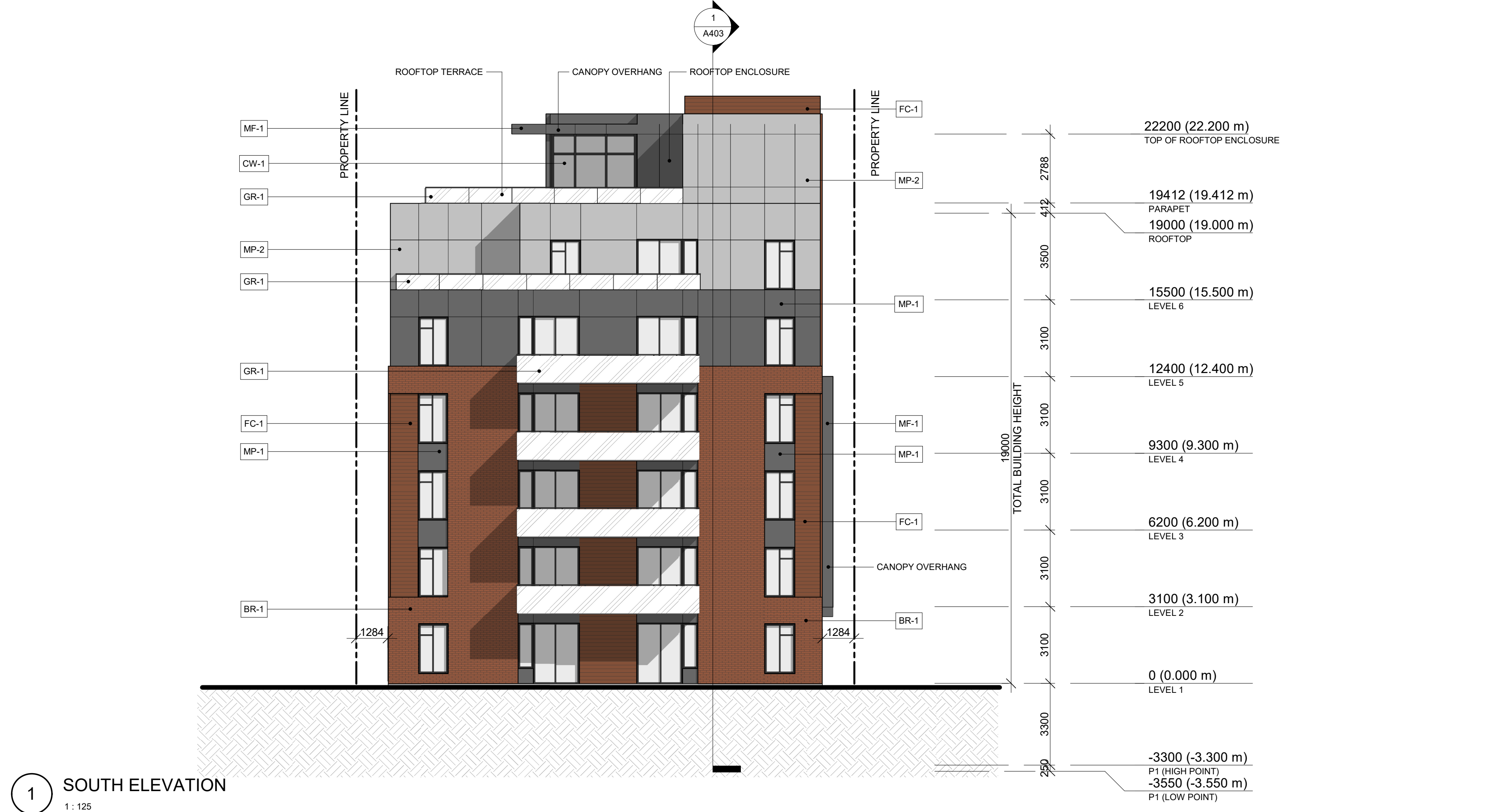
1 SOUTH ELEVATION 1:125

GENERAL NOTES NOTE-A: ALL DRAWINGS ARE TO BE READ IN CONJUNCTION WITH ALL OTHER DRAWINGS AND SPECIFICATIONS, INCLUDING OTHER CONSULTANTS DRAWINGS AND SPECIFICATIONS. ANY DISCREPANCIES BETWEEN DRAWINGS WILL BE REPORTED TO THE PROJECT LEAD IMMEDIATELY FOR CLARIFICATION PRIOR TO COMMENCING ANY CONSTRUCTION. NOTE-B: ALL GENERAL SITE INFORMATION AND CONDITIONS HAVE BEEN COMPILED FROM EXISTING PLANS AND SURVEYS. NOTE-C: CONTRACTOR IS RESPONSIBLE TO CHECK AND VERIFY ALL DIMENSIONS ON SITE AND REPORT ALL ERRORS AND / OR OMISSIONS TO THE ARCHITECT. NOTE-D: REFER TO LANDSCAPE PLANN FOR ALL EXTERIOR LANDSCAPING. NOTE-E: DO NOT SCALE DRAWINGS. NOTE-F: ALL CONTRACTORS MUST COMPLY WITH ALL APPLICABLE CODES AND REGULATIONS.