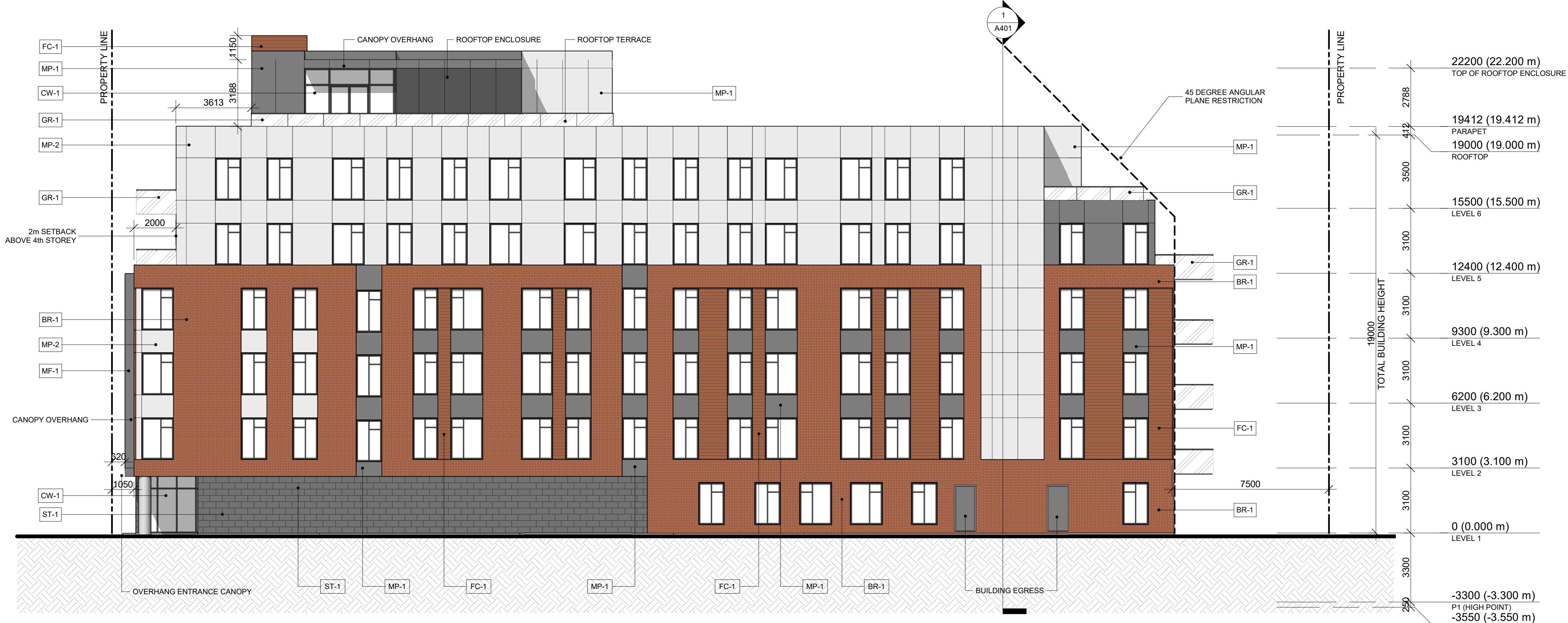
2 WEST ELEVATION 1:125

SURVEYOR ANNIS. OSULLIVAN VOLLEBEKK TLD T 613.727.0850