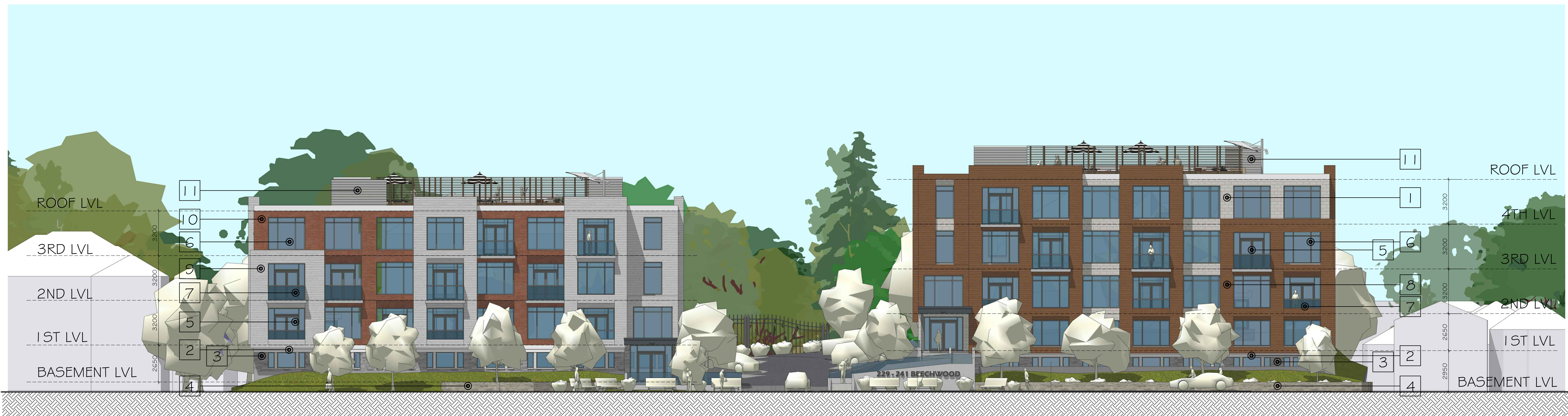
1 EAST ELEVATION A4 1:150