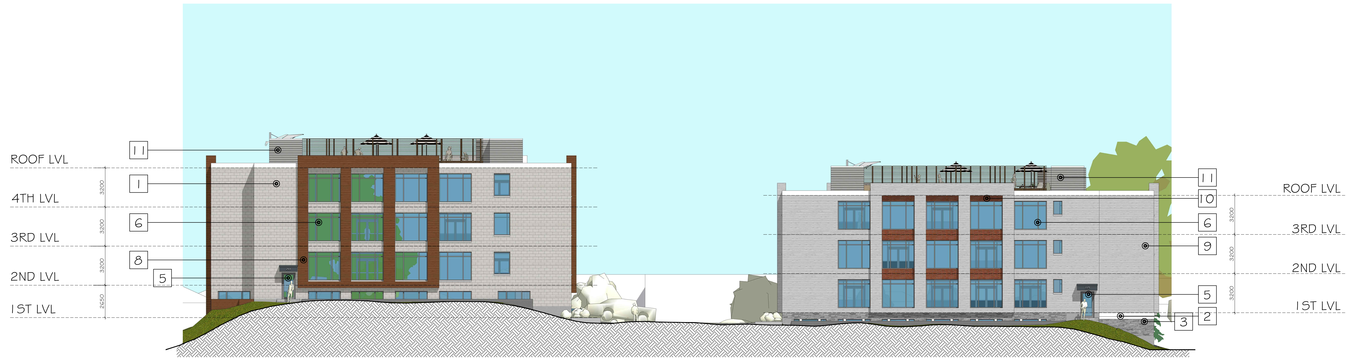
1 WEST ELEVATION A5 1:150