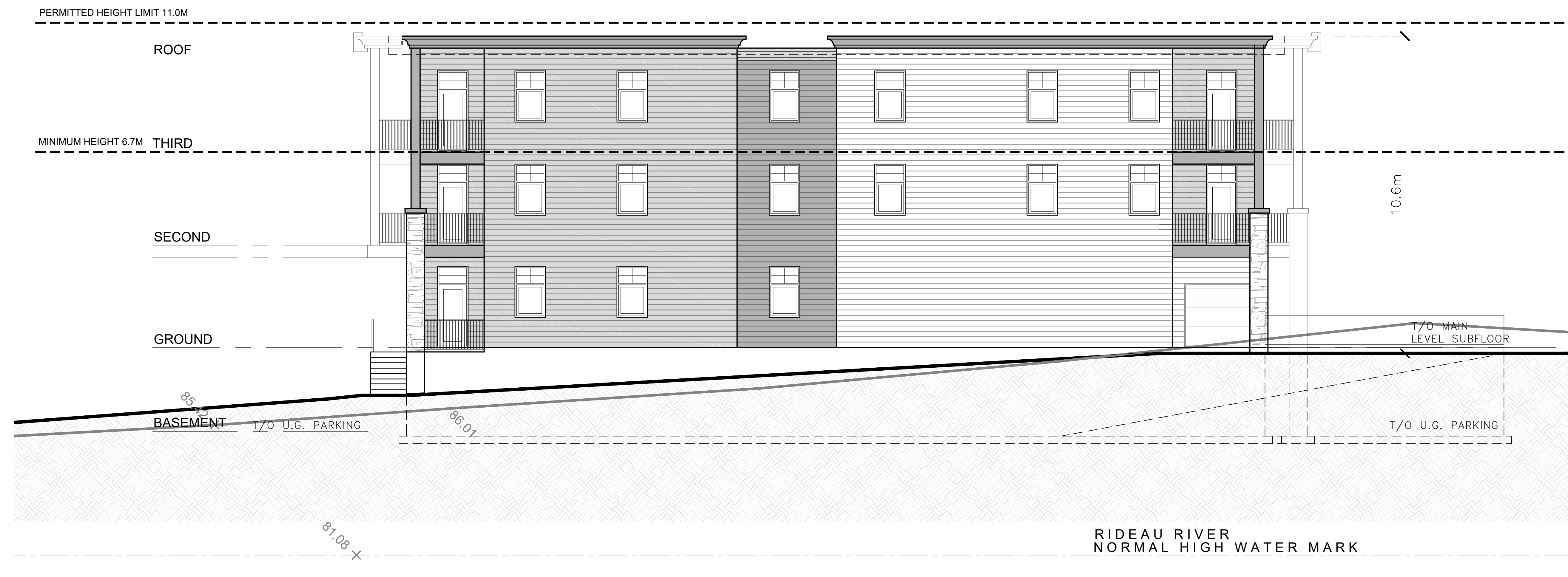
2 LEFT SIDE ELEVATION A-3 SCALE = 1:75