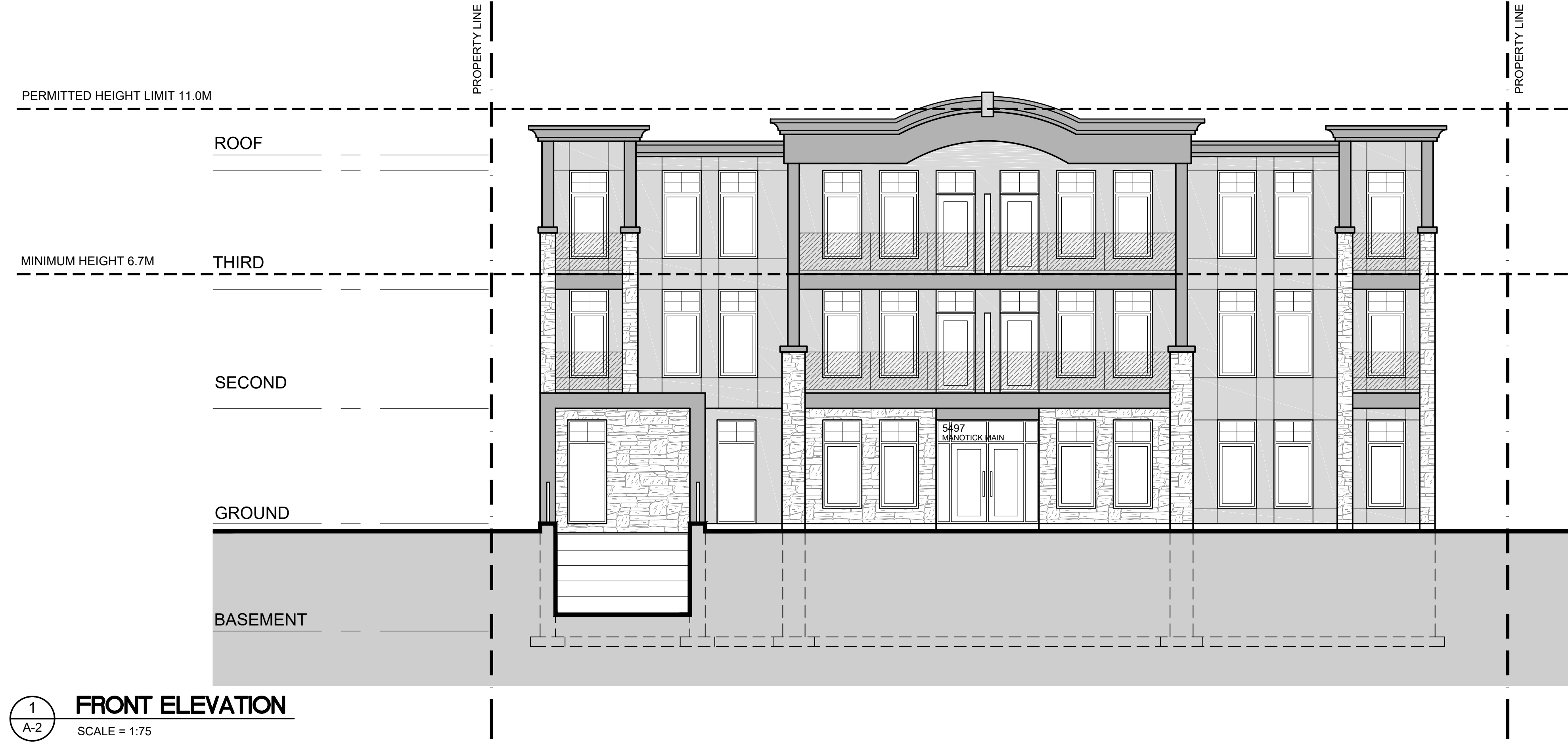
1 FRONT ELEVATION SCALE = 1:75