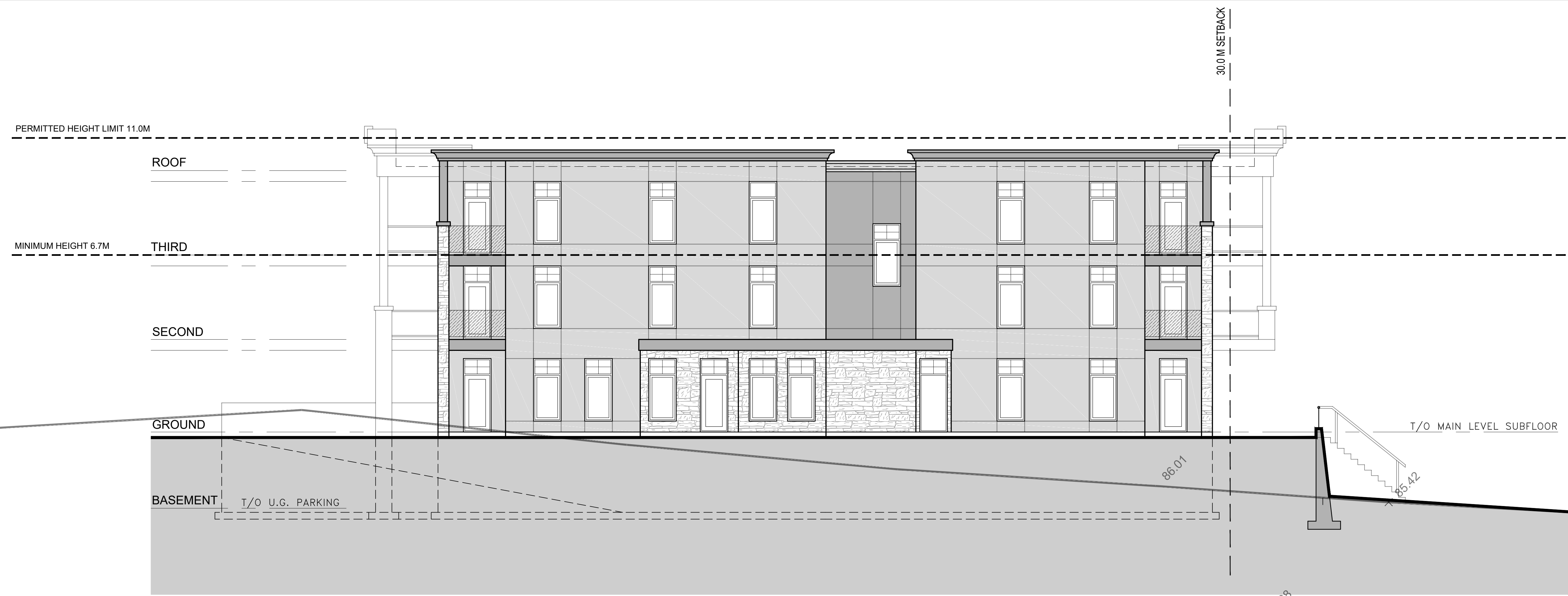
2 RIGHT SIDE ELEVATION SCALE = 1:75