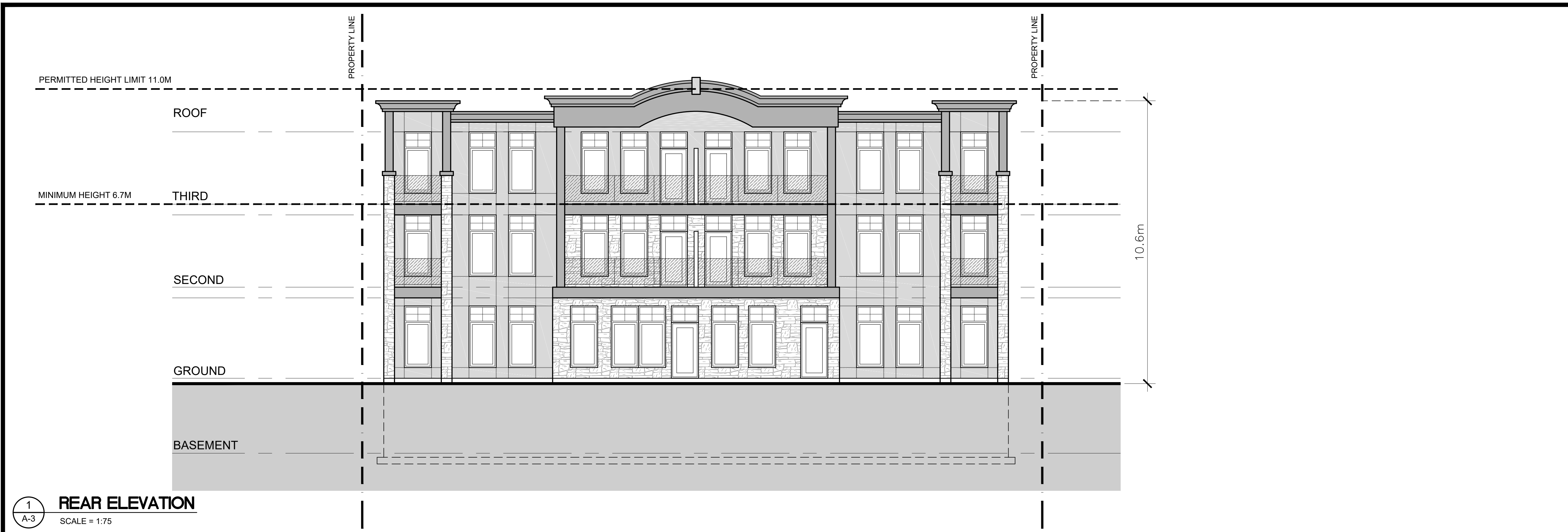
1 A-3 REAR ELEVATION SCALE = 1:75