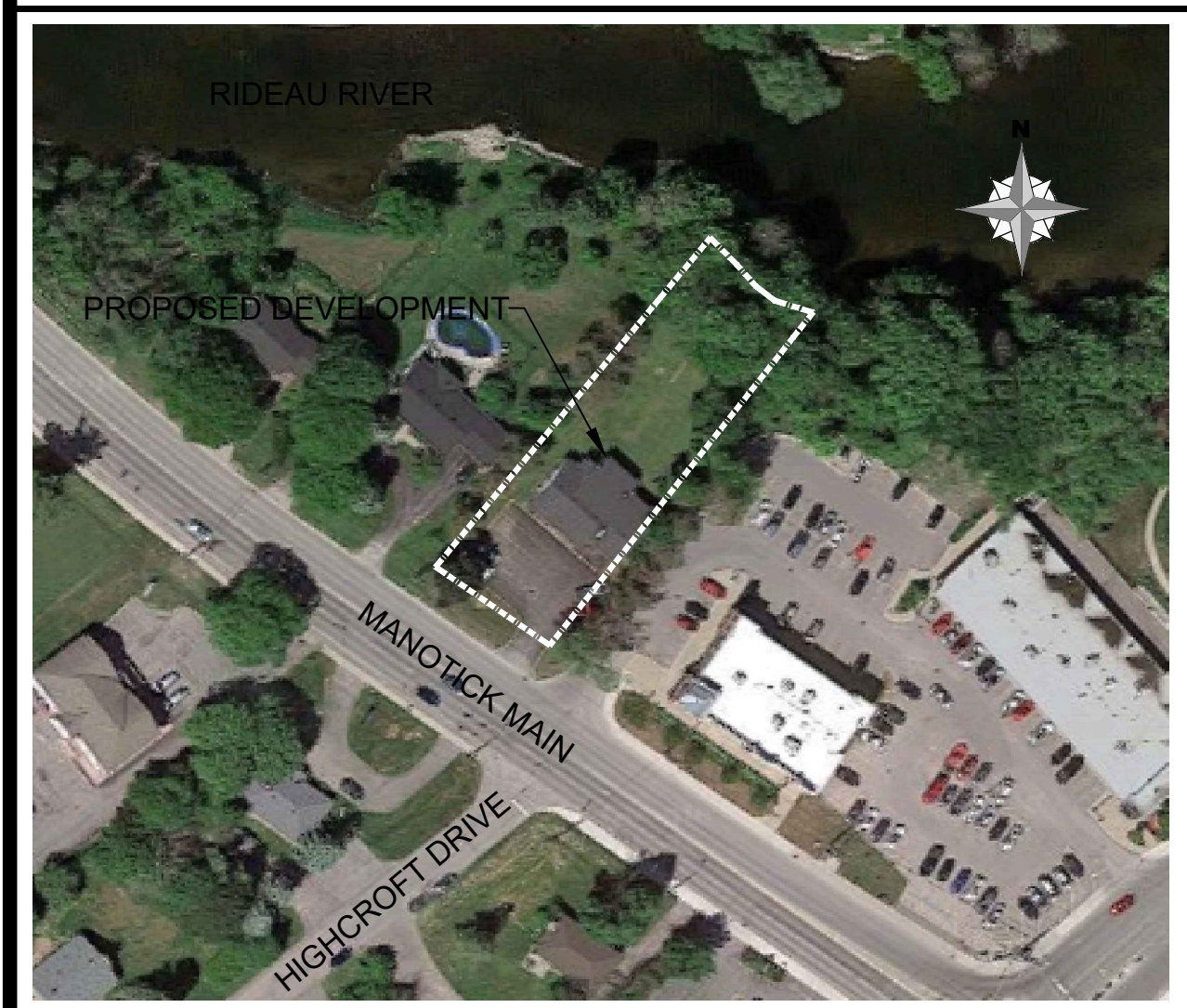
2 LOCATION PLAN SP-01 N.T.S