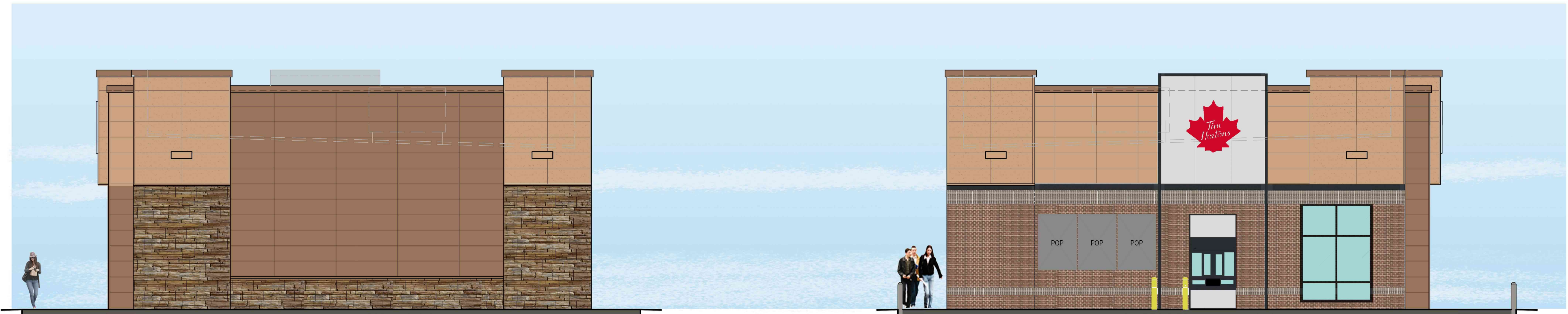
3 "SIDE" (SOUTH) ELEVATION SCALE: 3/16" = 1'-0"