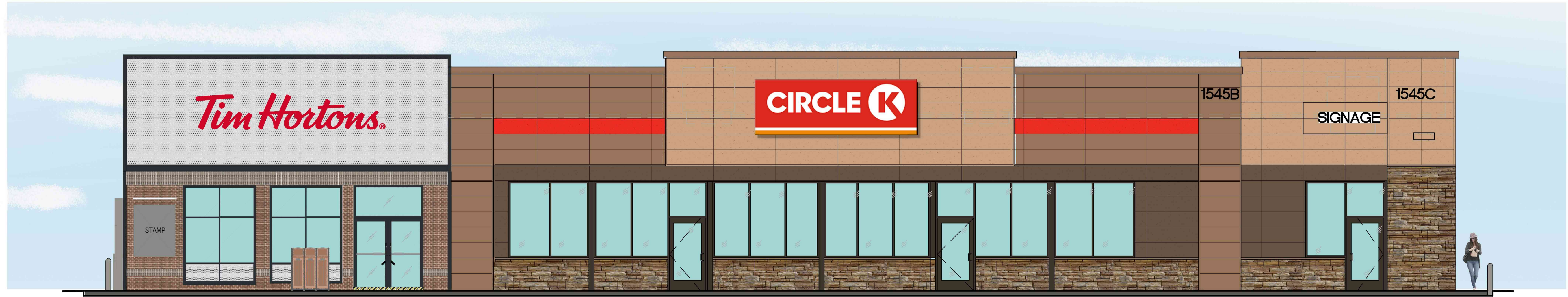
1 "FRONT" (WEST) ELEVATION SCALE: 3/16" = 1'-0"

09/24/21 ISSUED FOR SPA 12/03/21 RE-ISSUED FOR SPA 19/01/22 RE-ISSUED FOR SPA