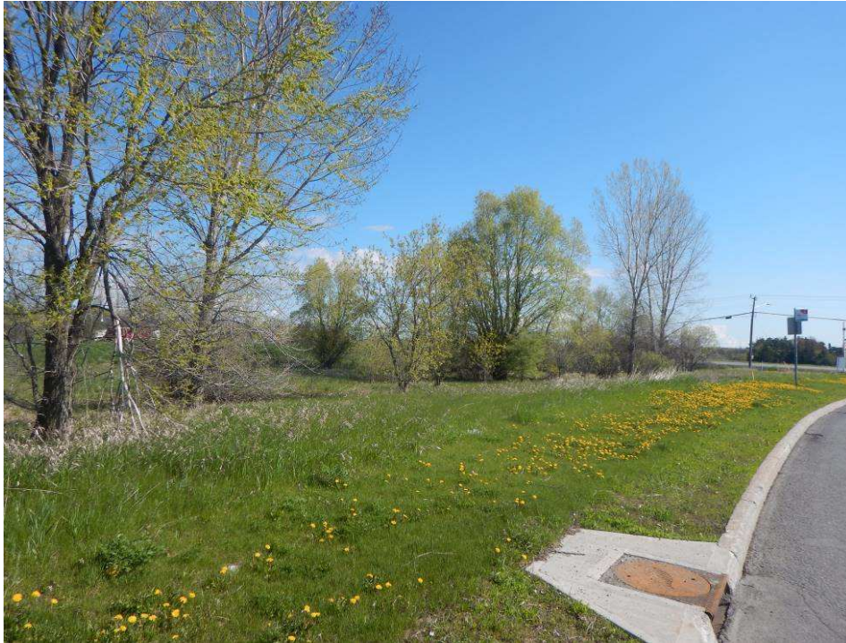
Photo 6 - Small treed area along the east site edge. View looking north