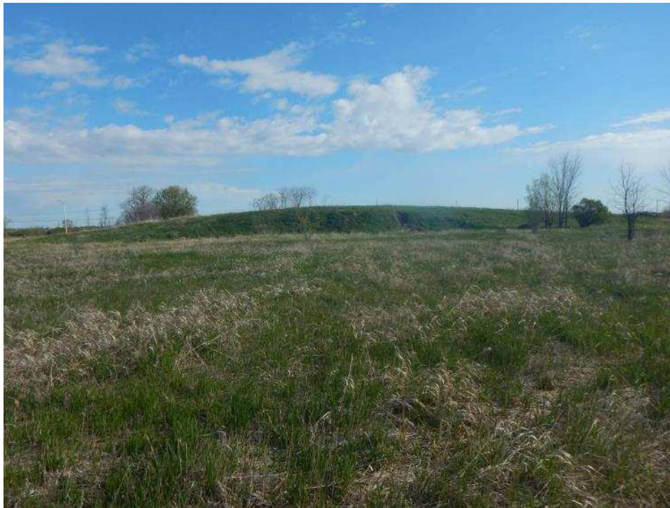
Photo 1 – Cultural meadow habitat dominates the south portion of the site. View looking west

Trembling aspen, white elm, white spruce, and Manitoba maple, between 10 and 30cm dbh, are in other small treed areas in the south portion of the site (Photo 6). Slender willow shrubs are also present.