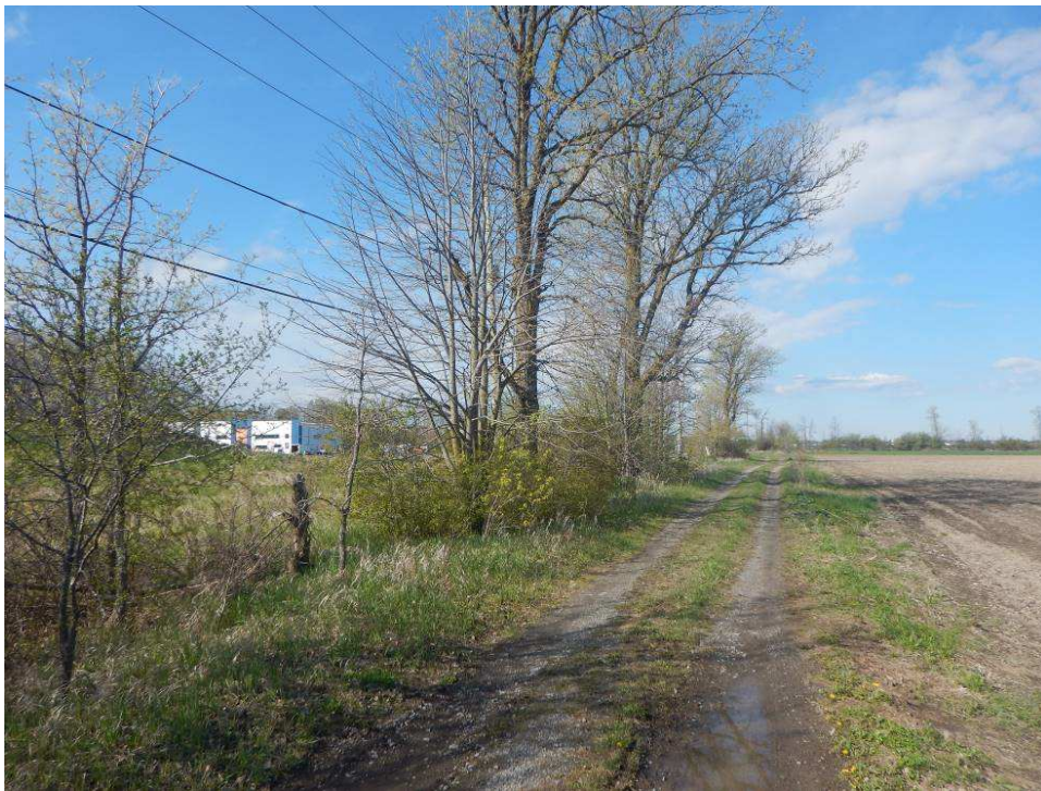
Photo 3 – ‘Windrow’ 4 in the west-central portion of the site. View looking west