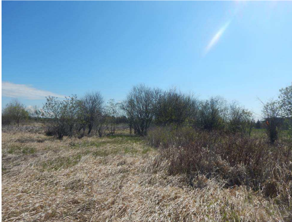
Photo 4 - Small area of cultural thicket in the west-central portion of the site south of 'Windrow 4'. View looking north