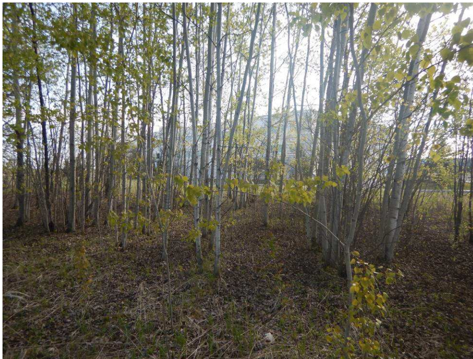
Photo 5 – Trembling aspen and bur oak inclusion in the southwest corner of the site. View looking west