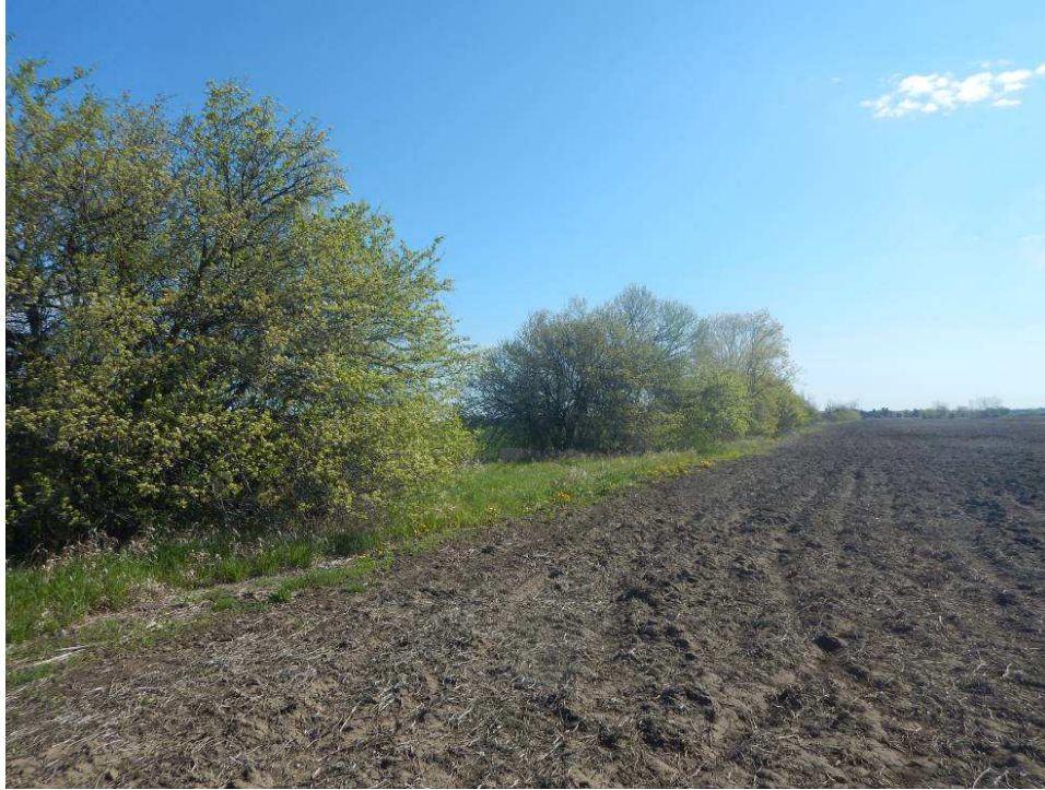
Photo 2 – Scattered shrubs and small trees along the north site edge. View looking east