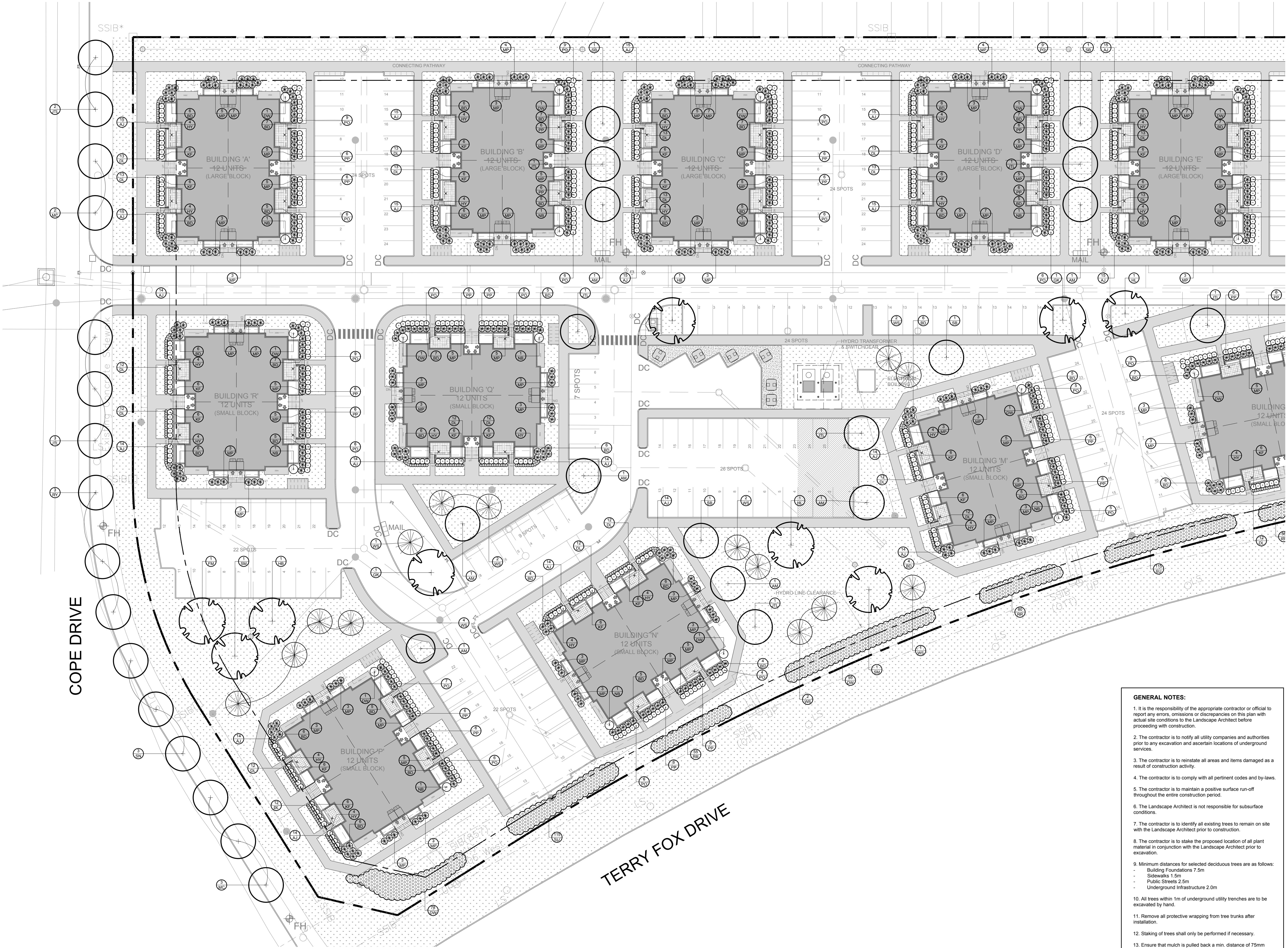
1 LANDSCAPE PLAN L.1 SCALE 1:300