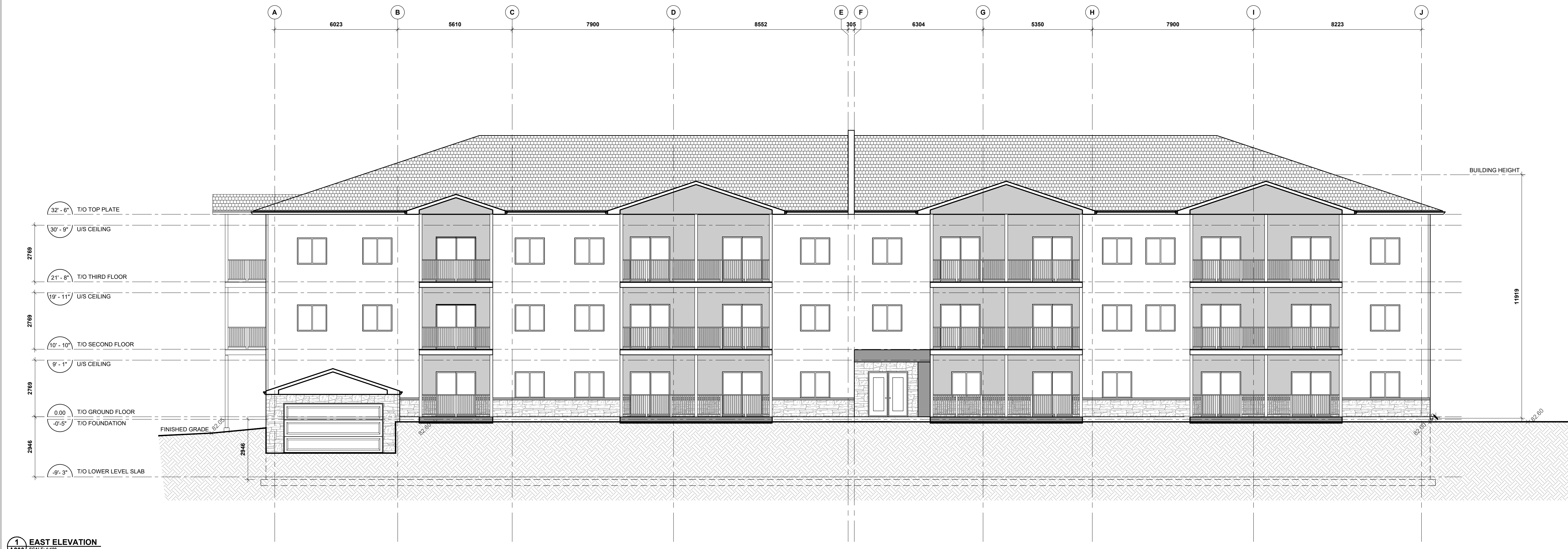
1 EAST ELEVATION SCALE: 1/160