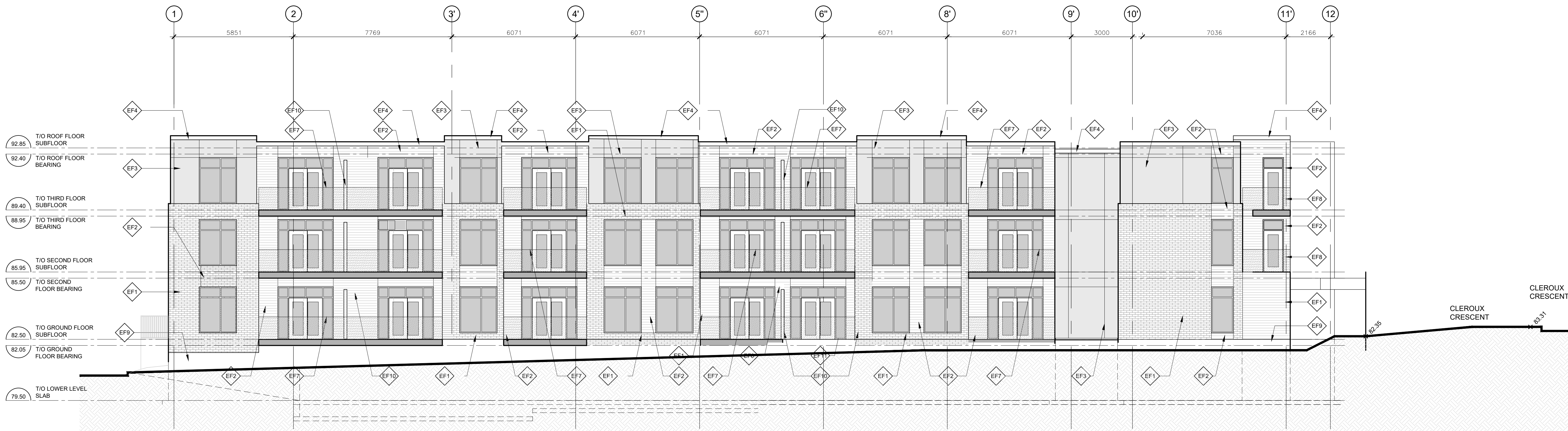
2 BLOCK B EAST ELEVATION ALONG ORIENT PARK DR. SCALE = 1 : 100