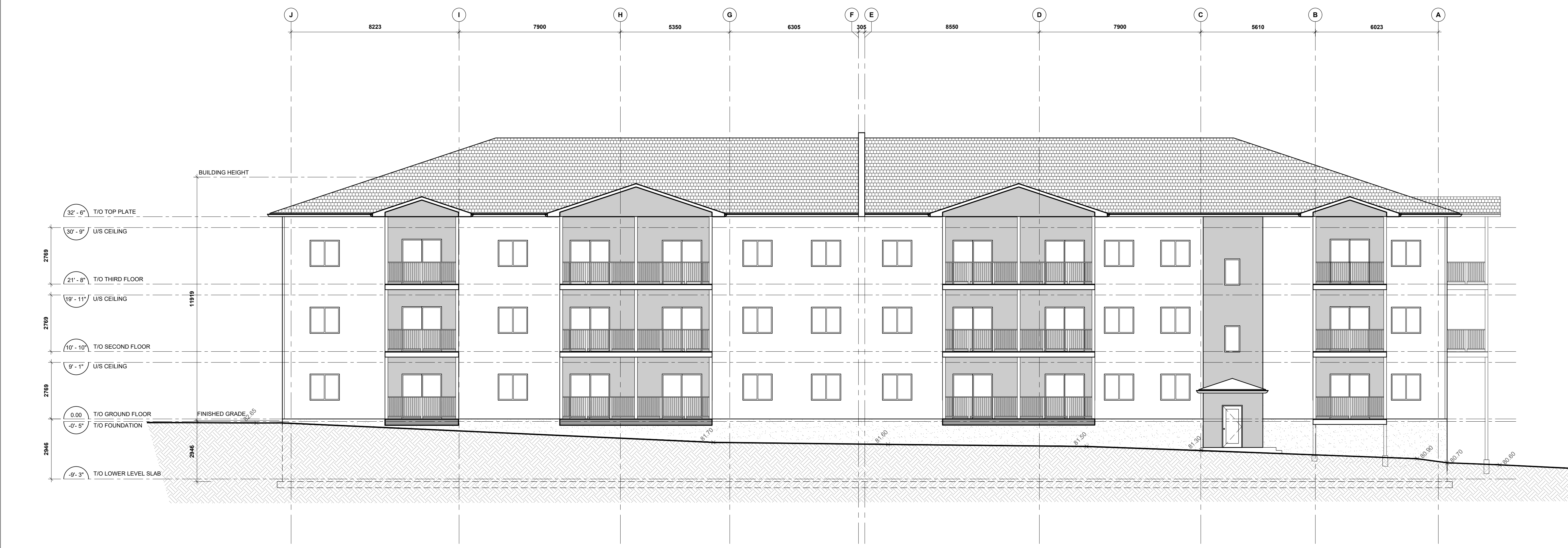
1 WEST ELEVATION SCALE: 1/100