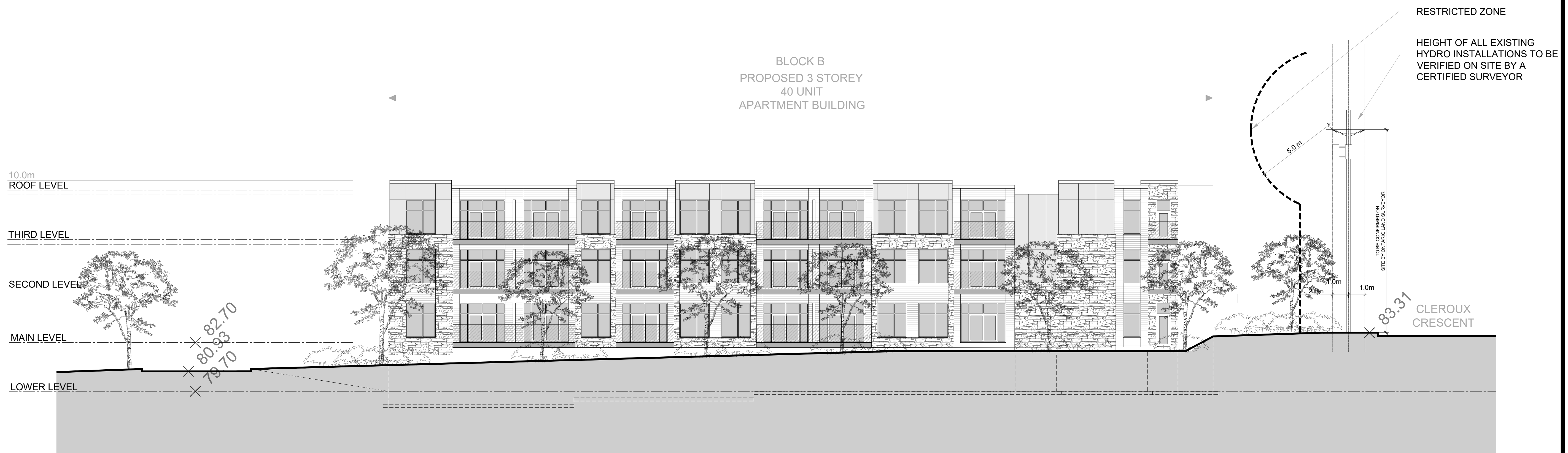
BLOCK B EAST ELEVATION ALONG ORIENT PARK DR.