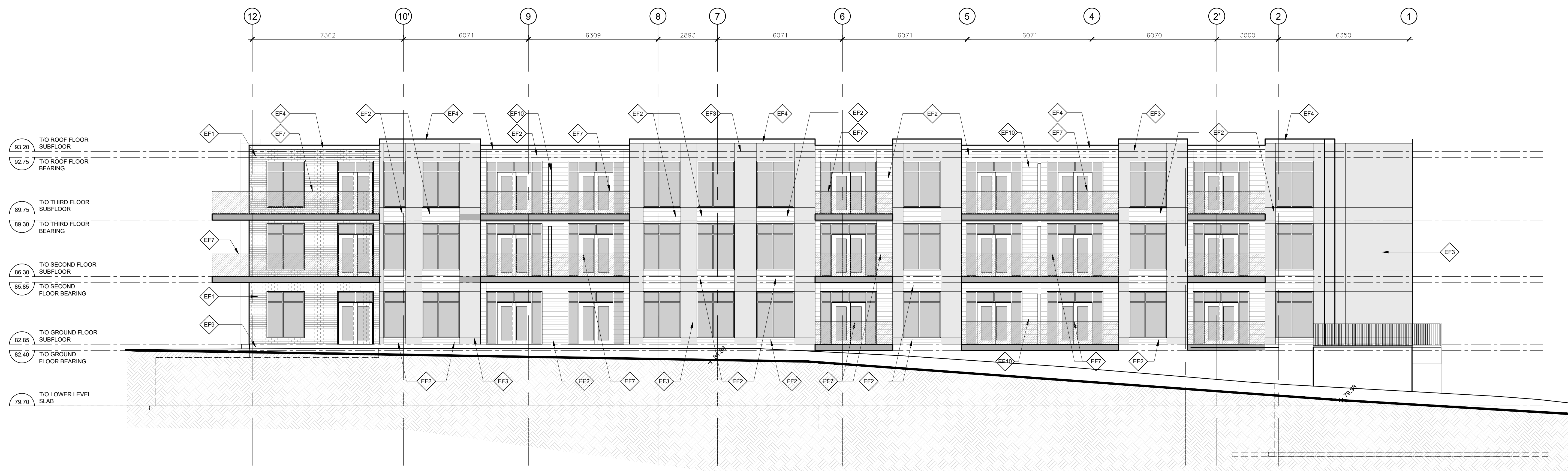
2 BLOCK A WEST ELEVATION SCALE = 1:100