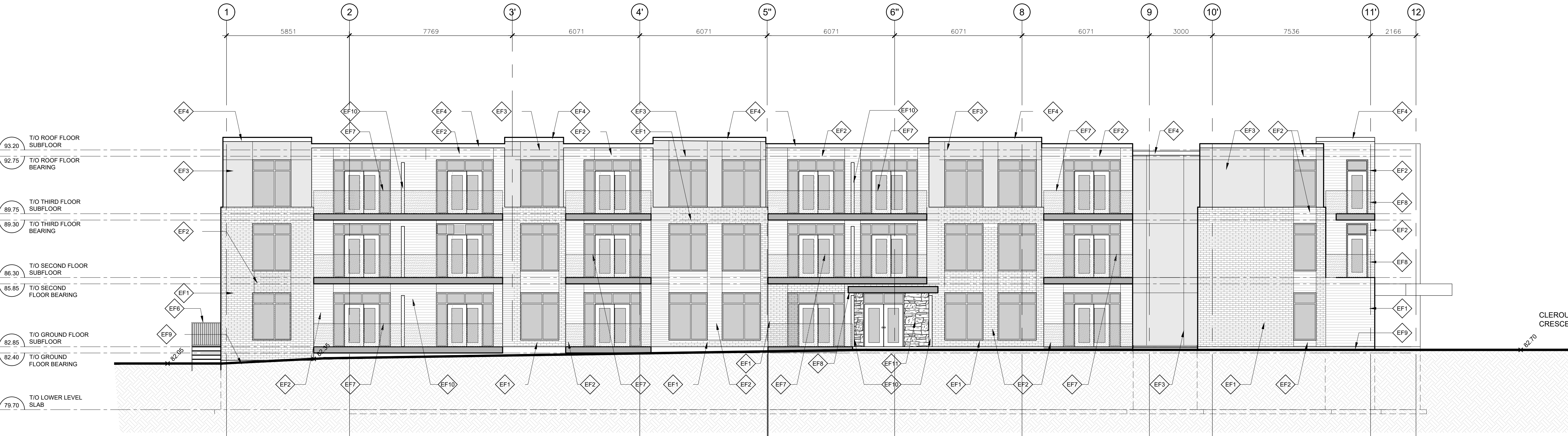
1 BLOCK_A EAST ELEVATION SCALE = 1:100