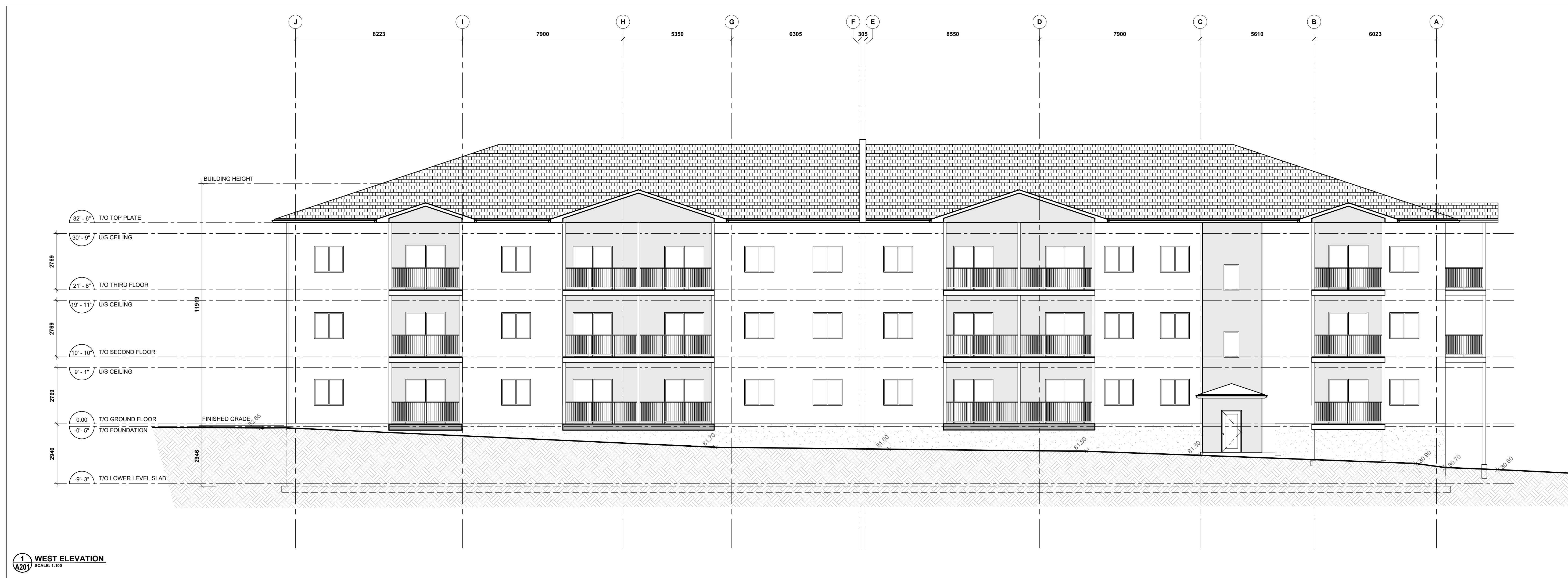
1 WEST ELEVATION AZ01 SCALE: 1/160