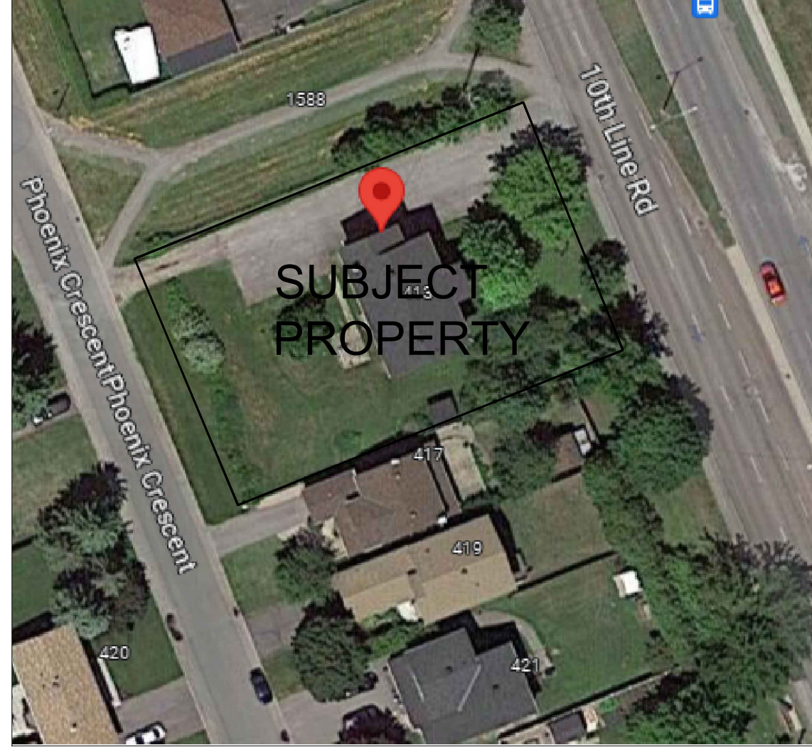
2 LOCATION PLAN SP-01 SCALE = 1:800