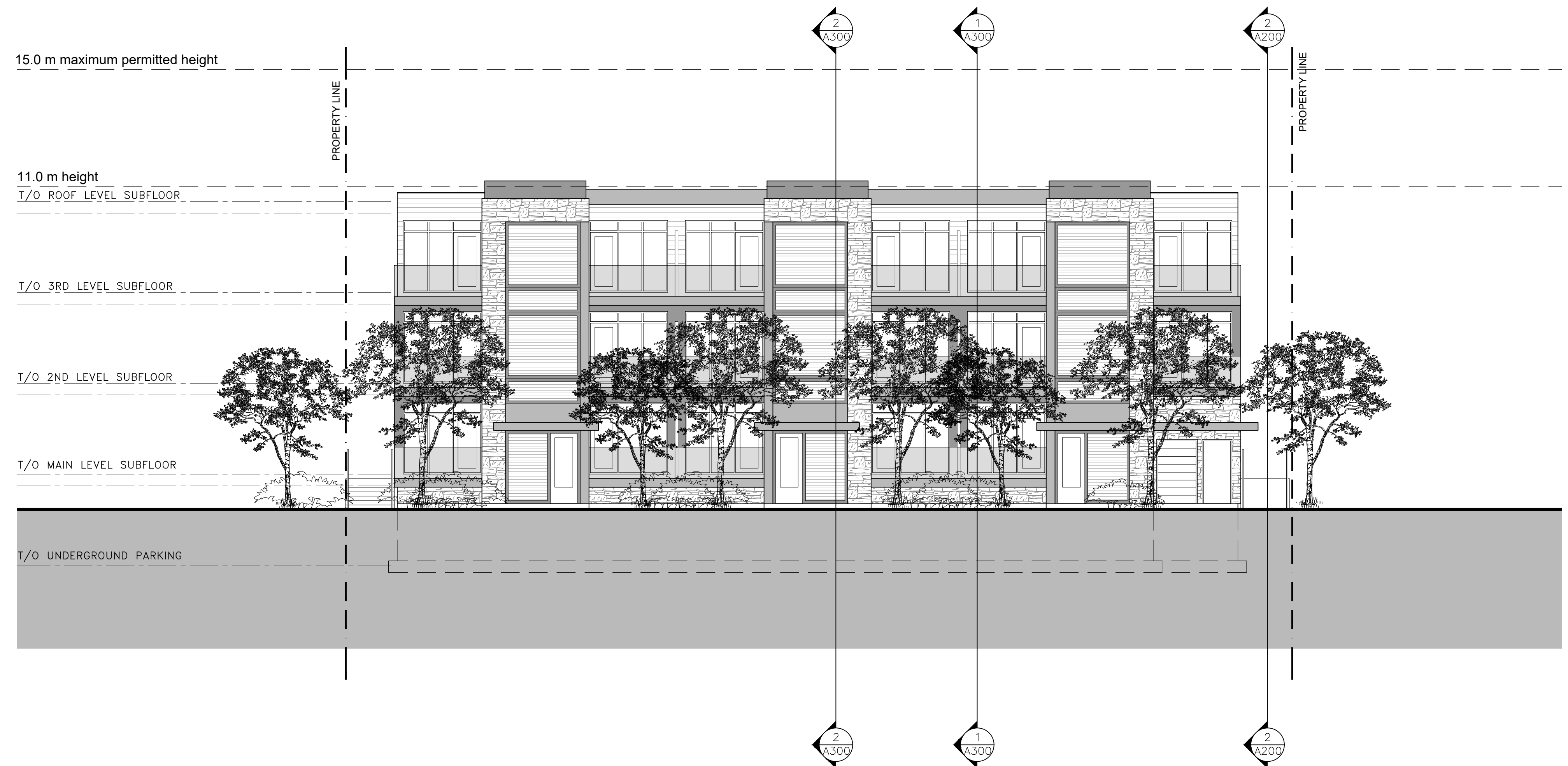
1 WEST ELEVATION ELEVATION (ALONG PHOENIX) A-201 SCALE = 1:100