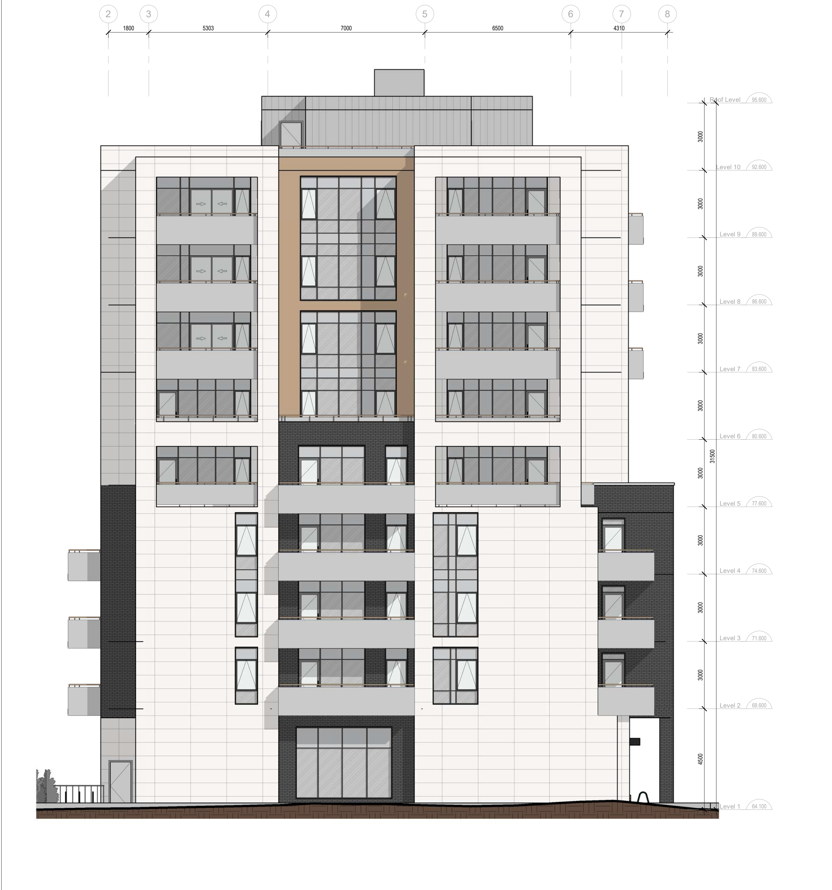
1 WEST ELEVATION A-201 SCALE 1:100