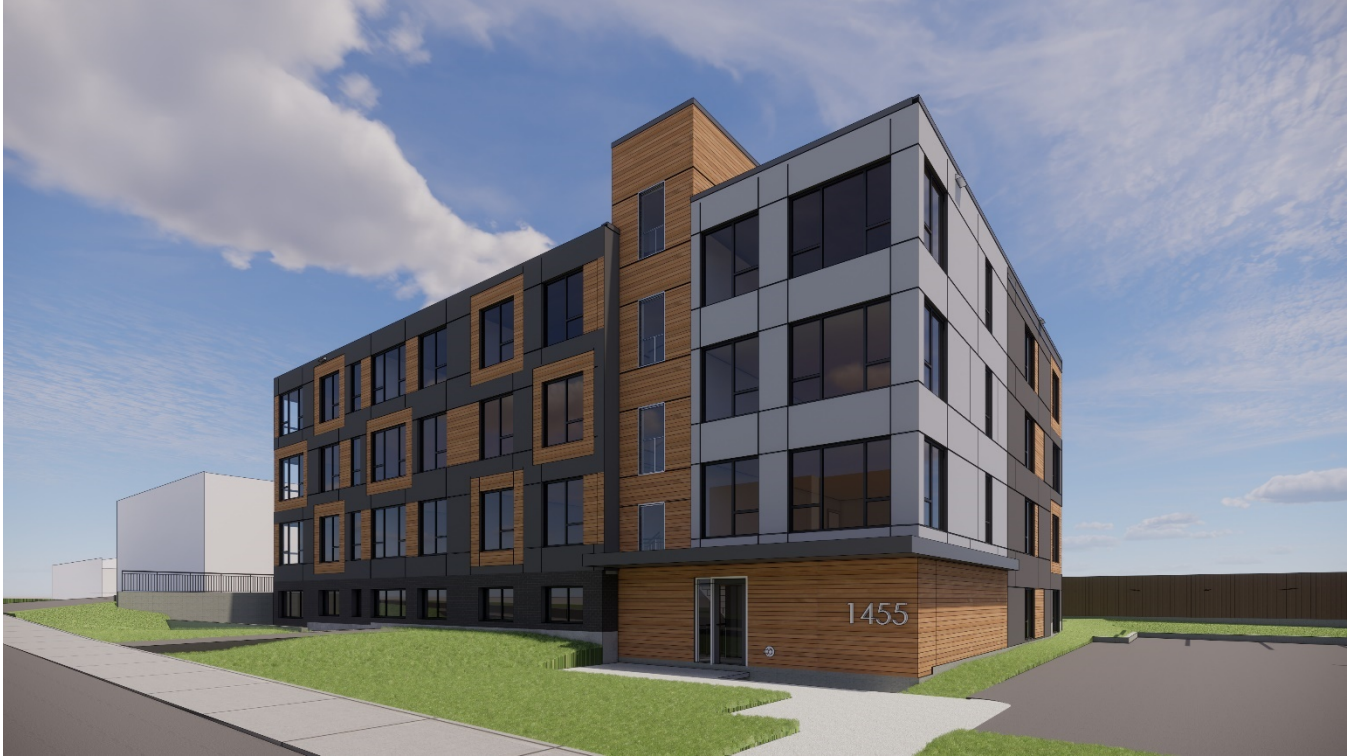
Figure 1 Revised building design.

Further, the Residential Fourth Density zone is intended to enable a wider range of low-rise, multi-unit infill housing, while respecting compatibility and context sensitive design. Provisions of the R4 zone facilitate building form and typology that constitutes the "missing middle" range of affordable mid-density housing suitable to a wide range of household types, incomes and tenures, as directed by the Official Plan.