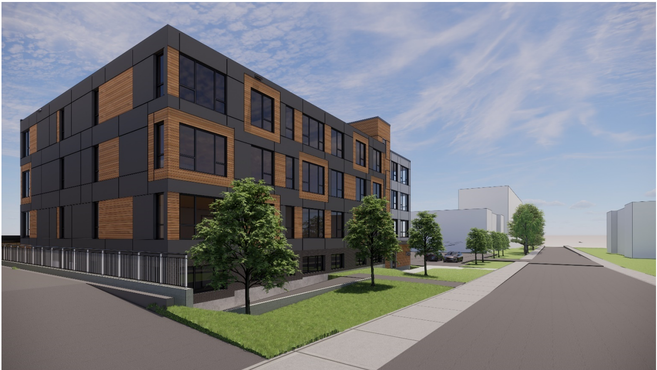
Figure 3 Revised Building Design.

The Zoning By-law Amendment proposes to address specific provisions of the R4UC zone through the application of a site specific zoning exception to the lands. The special exception would provide relief from specific provisions of the zone related to the interior yard setback, rear-yard setback, landscaping, maximum height, and site layout provisions.