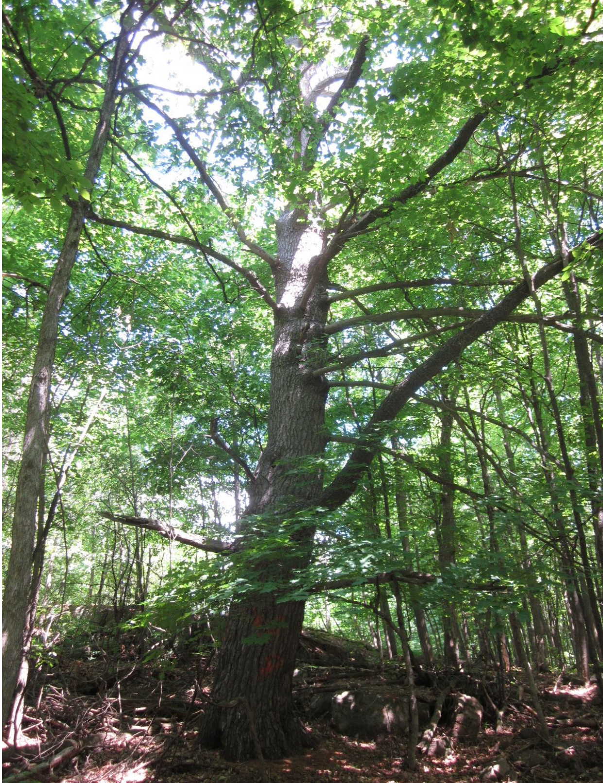
Picture 4. Living veteran white pine tree at 180 Kanata Avenue property (notice canopy opening beneath living crown of pine)