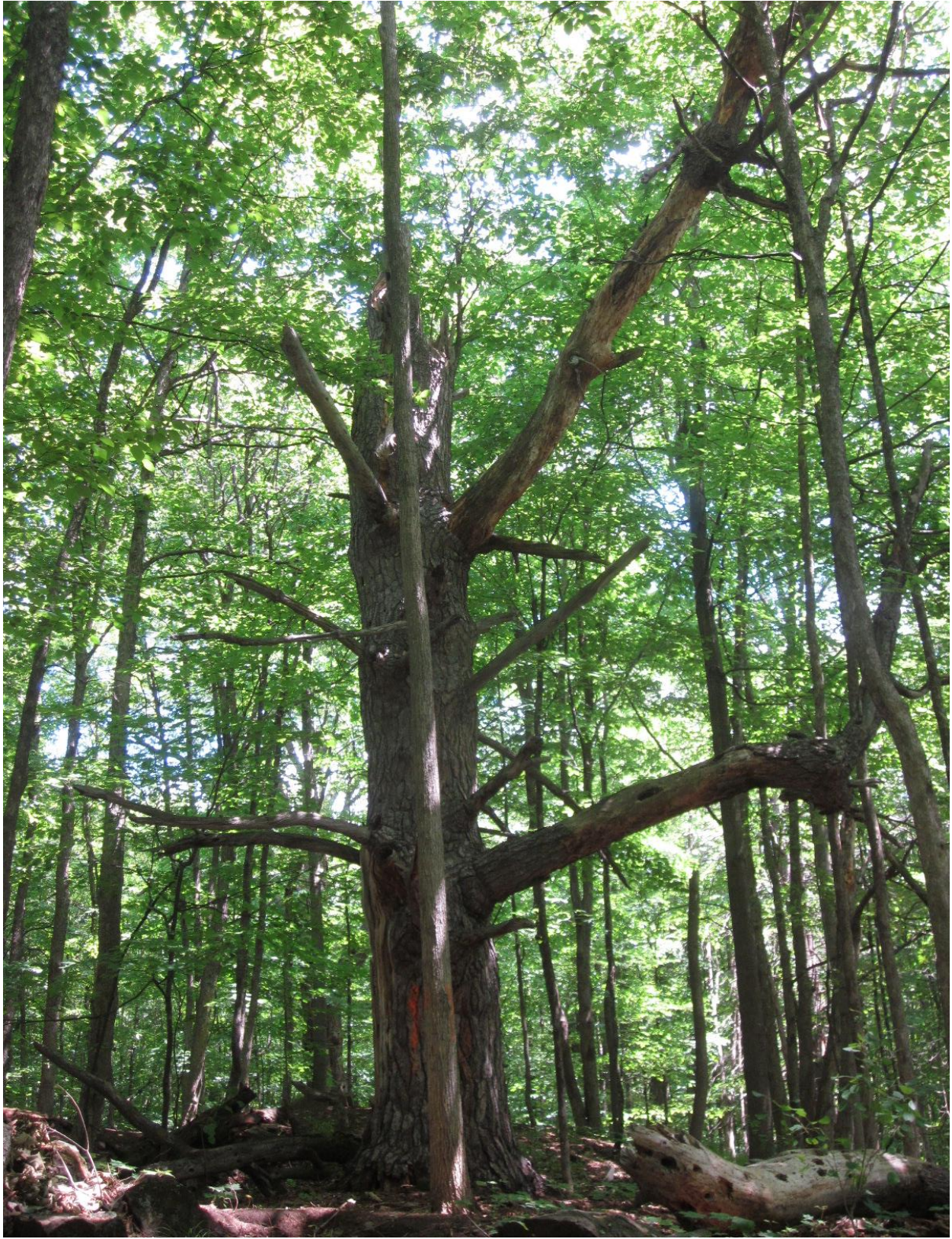
Picture 5. Standing dead veteran white pine tree at 180 Kanata Avenue property (notice closed canopy above broken stem)