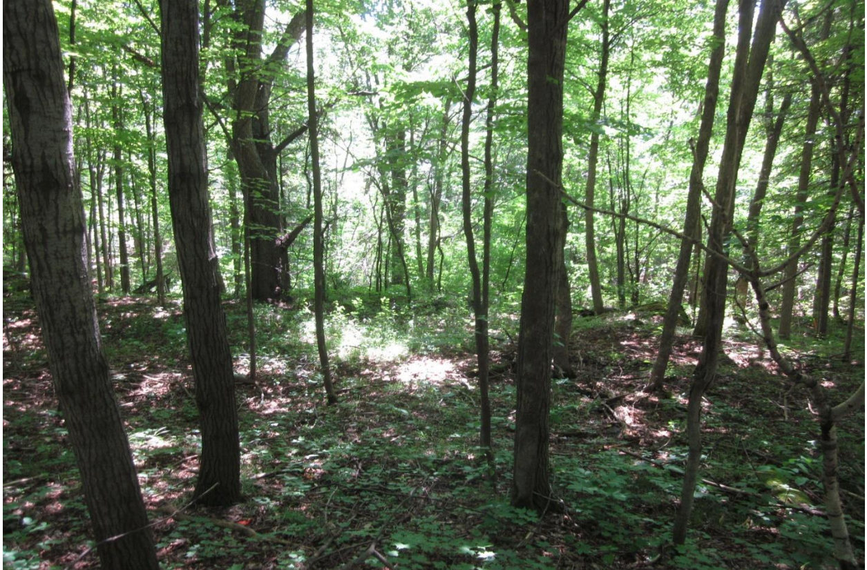
Picture 1. Typical over- and understory conditions at 180 Kanata Avenue property (looking southeastward)