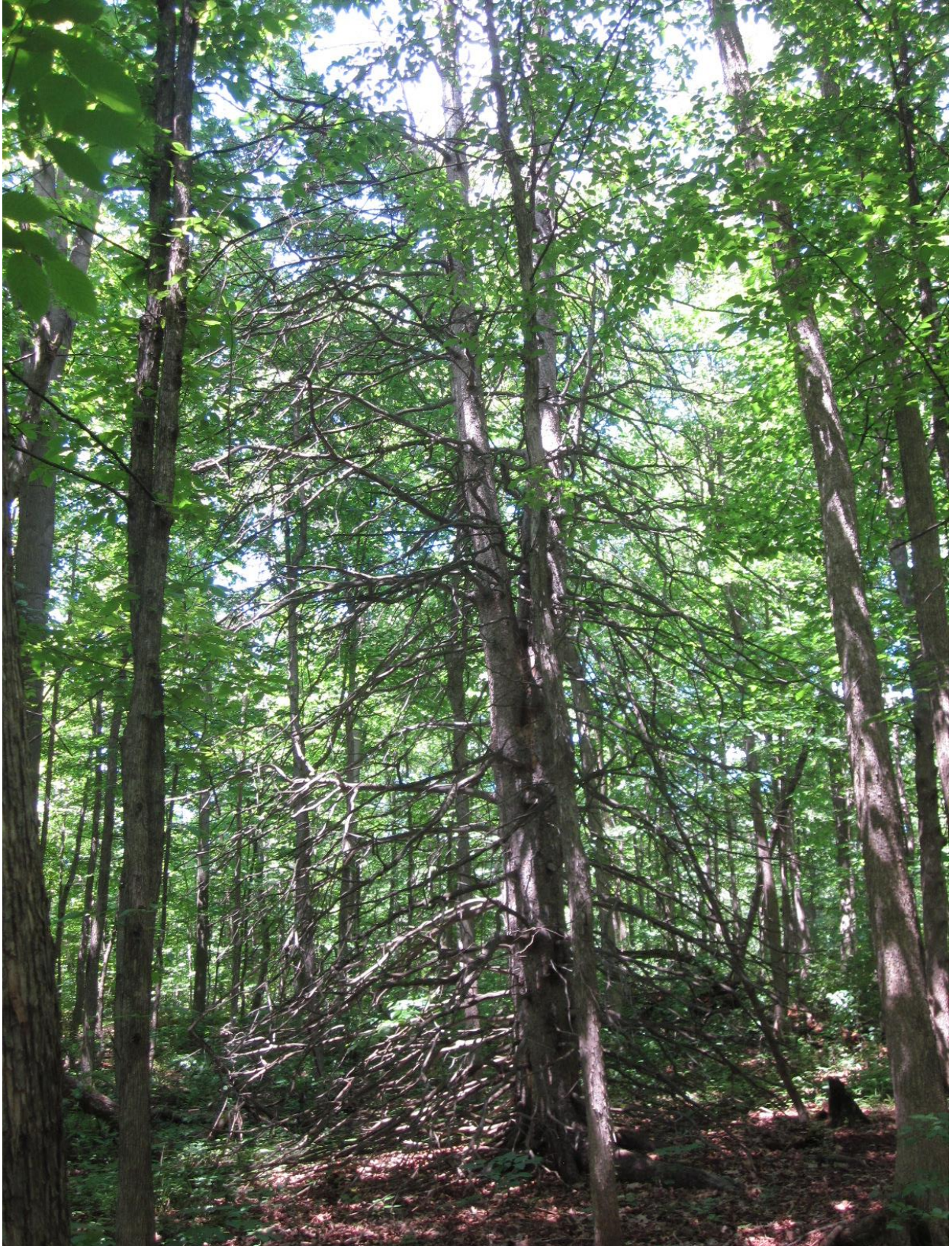
Picture 3. Recently dead veteran white spruce at 180 Kanata Avenue property