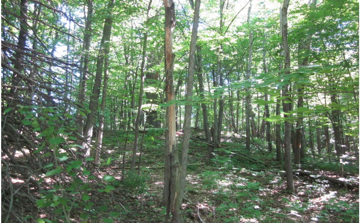
Picture 2. Typical over- and understory conditions at 180 Kanata Avenue property (looking northeastward)