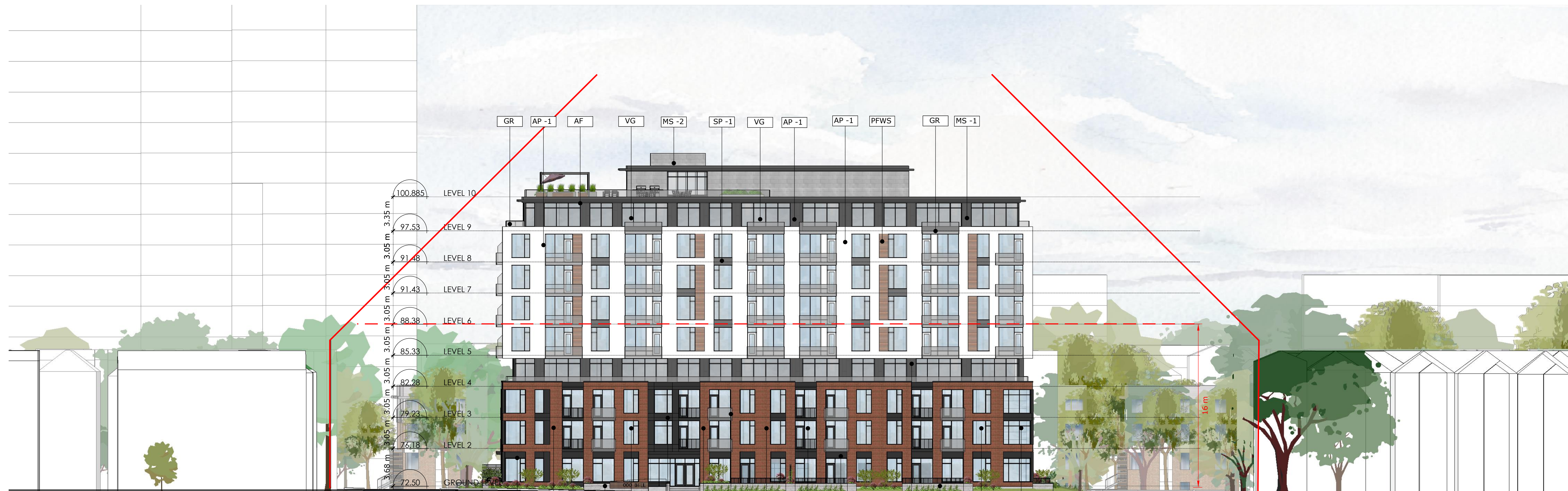
2 EAST ELEVATION