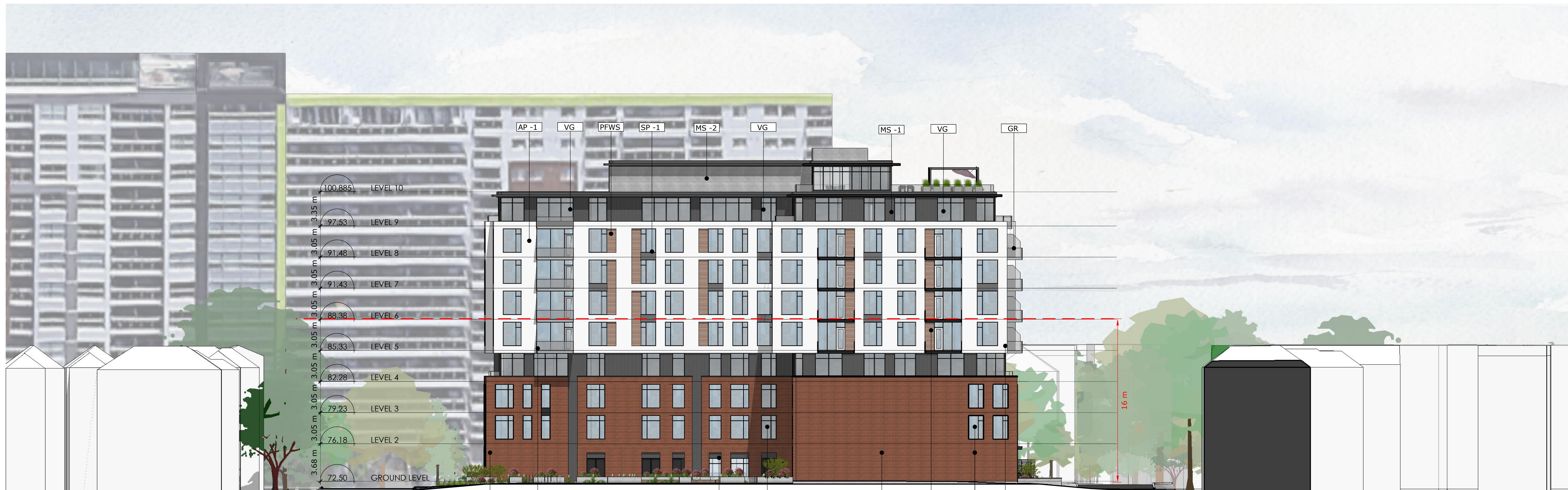
2 WEST ELEVATION