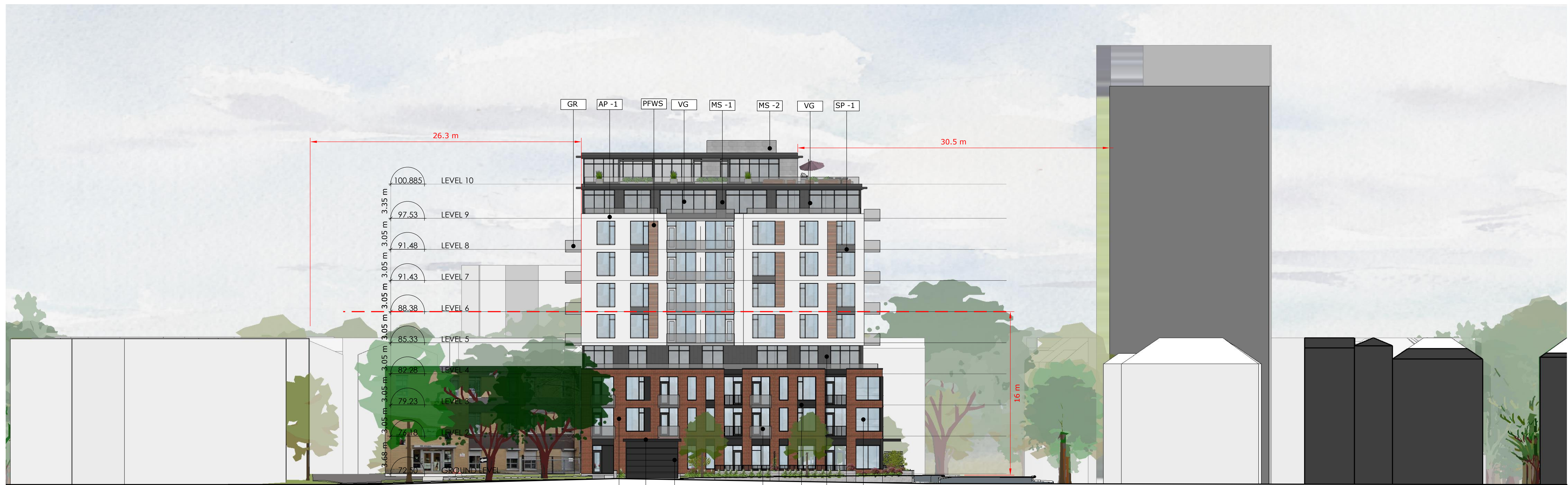
1 SOUTH ELEVATION