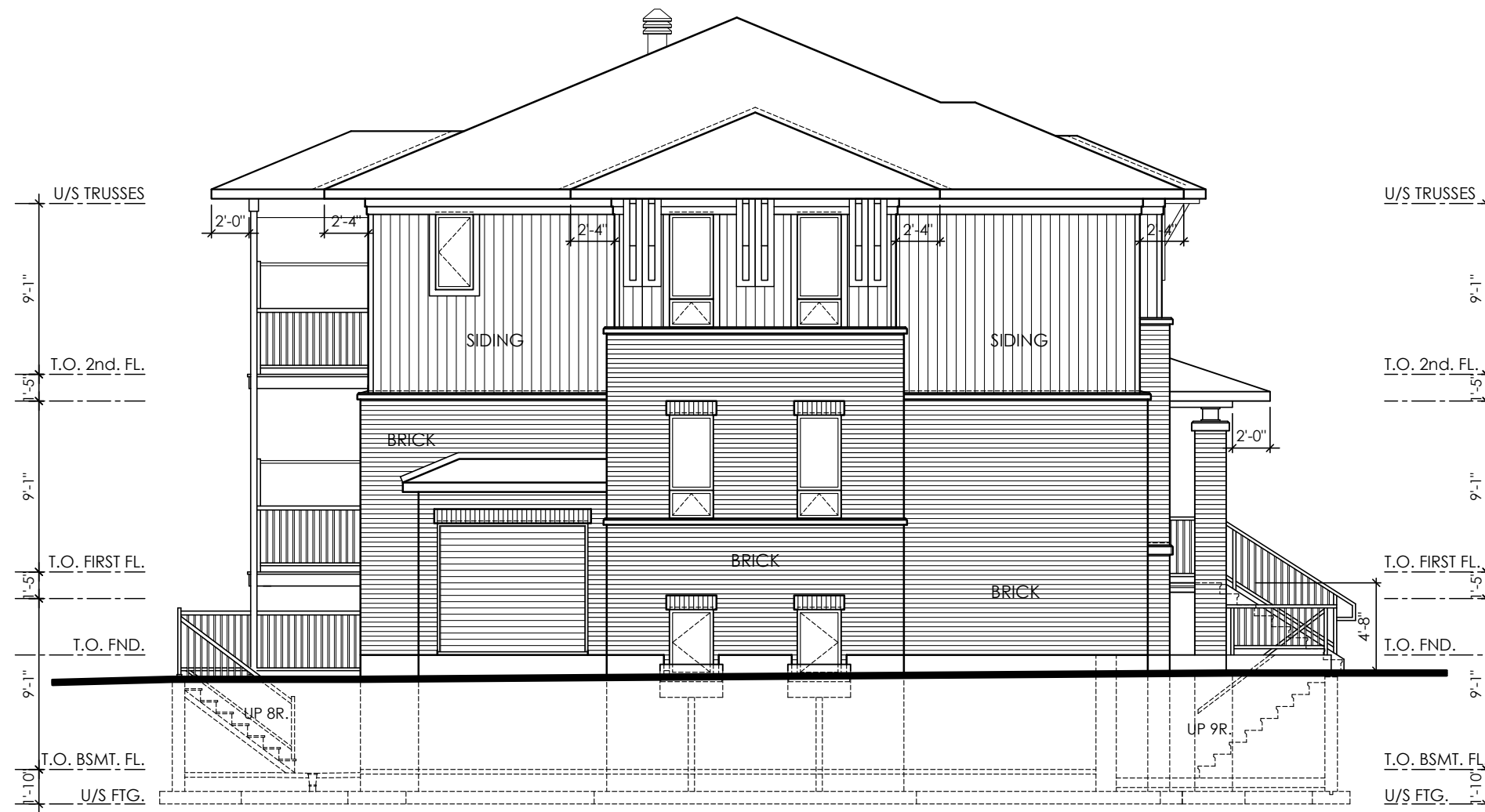
END UNIT UNIT 'A' UNIT 'B' UNIT 'C' END UNIT, STREET SIDE ELEVATION