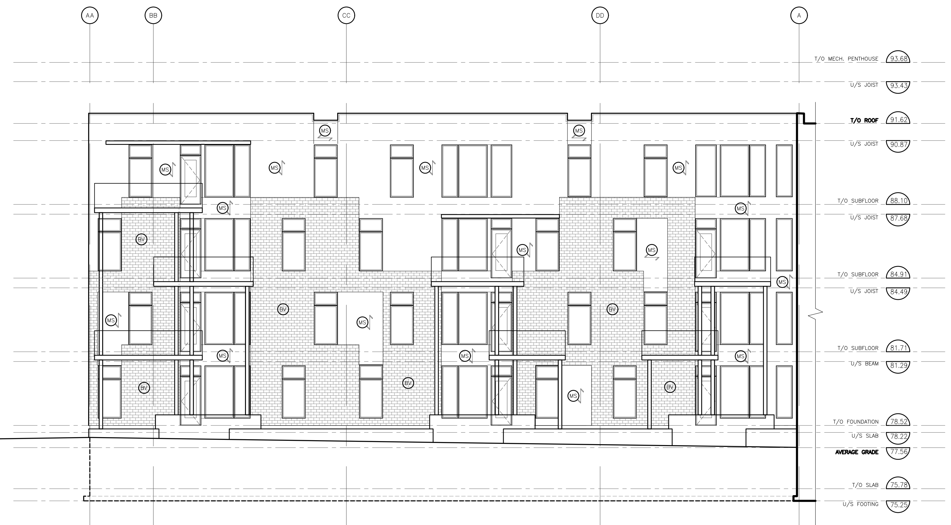
2 SOUTH ELEVATION 1 T : 100