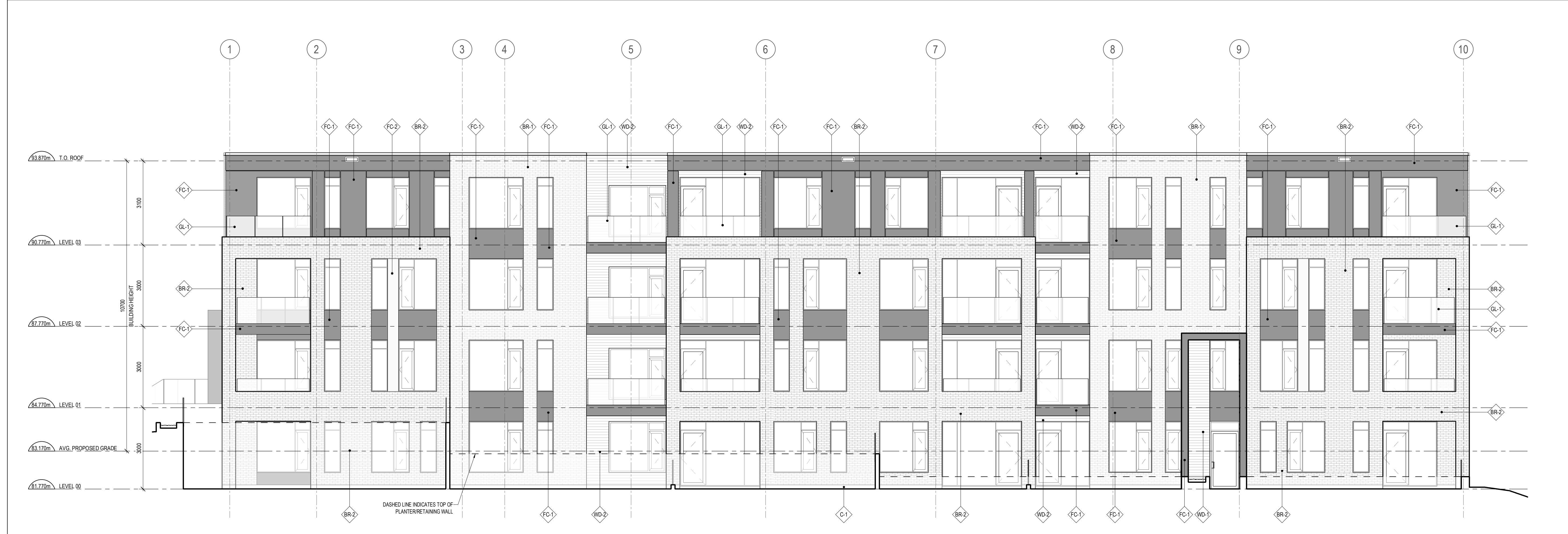
1 EAST ELEVATION A201 SCALE: 1 : 75