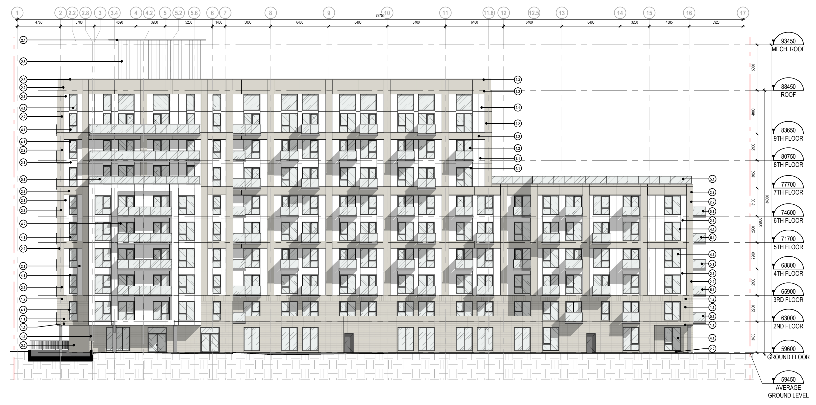
EAST ELEVATION 1 : 200 2 SPC-14

FILE NUMBER: D07-12-21-0015 PLAN NUMBER: 18597