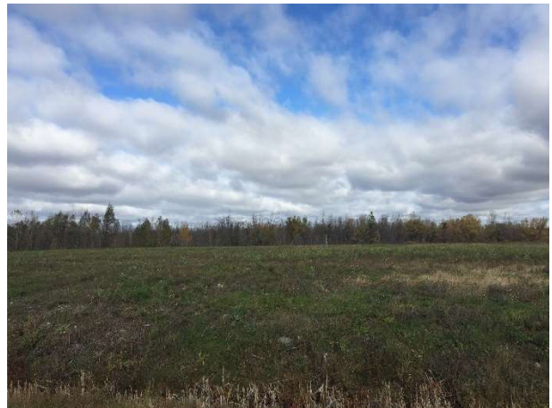
View looking north across the development site