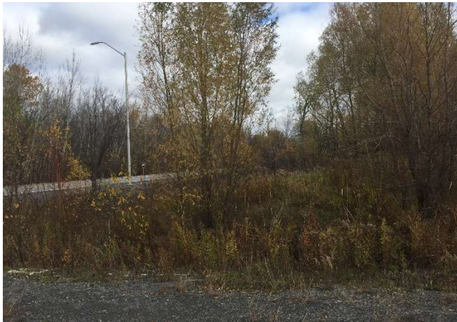
View looking northeast along Rideau Rd

The existing trees occur in two zones along the north side of the property. The generally level “roadside” adjacent to the roadside ditch is comprised of grasses, scrub vegetation, and occasional young trees. The slope that rises to where filling previously occurred is a young forest in various stage of maturation and decline. The vegetated slope extends approximately 10 metres into the building setback for most of its length. At the northeast corner, the slope steps back from the roadway and extends approximately 30 metres into the building setback.