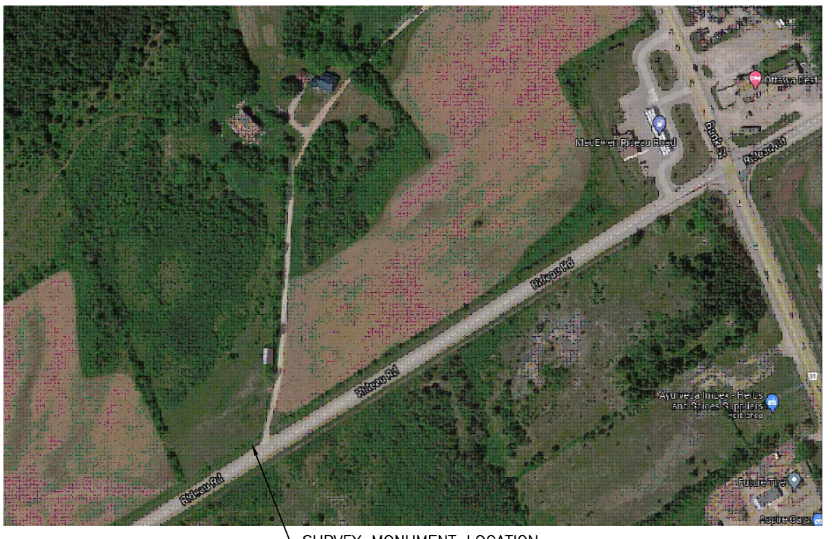
SURVEY MONUMENT LOCATION

NOTE OF CAUTION THE GEODETIC COORDINATES OF EVERY ITEM INCLUDED AS PART OF THIS DOCUMENT HAVE NO LEGAL VALUE. THE SITE LAYOUT MUST BE COMPLETED USING THE OFFICIAL BENCHMARKS OF AN ACCREDITED LAND SURVEYOR.