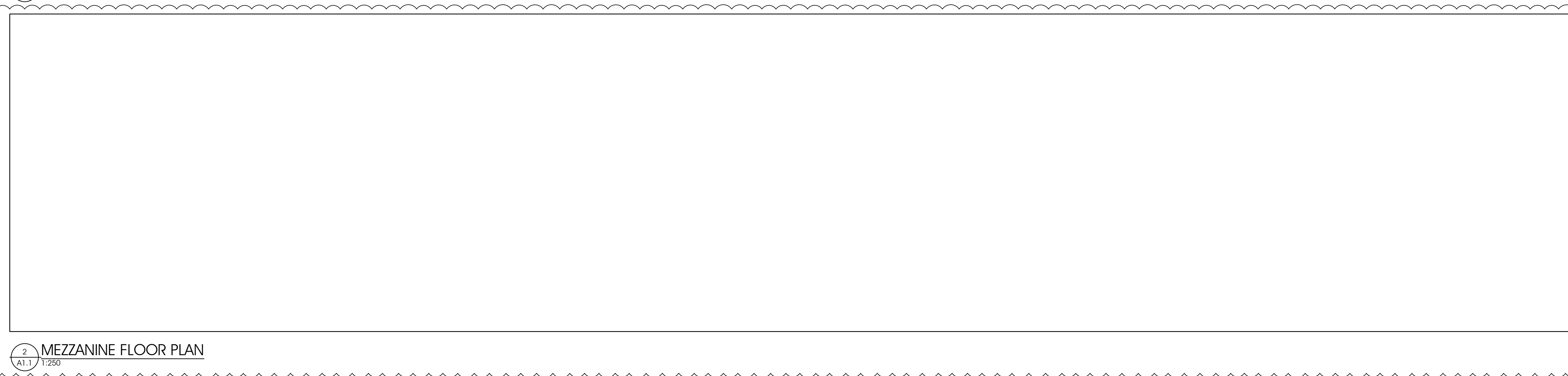
2 MEZZANINE FLOOR PLAN A1.1 1:250