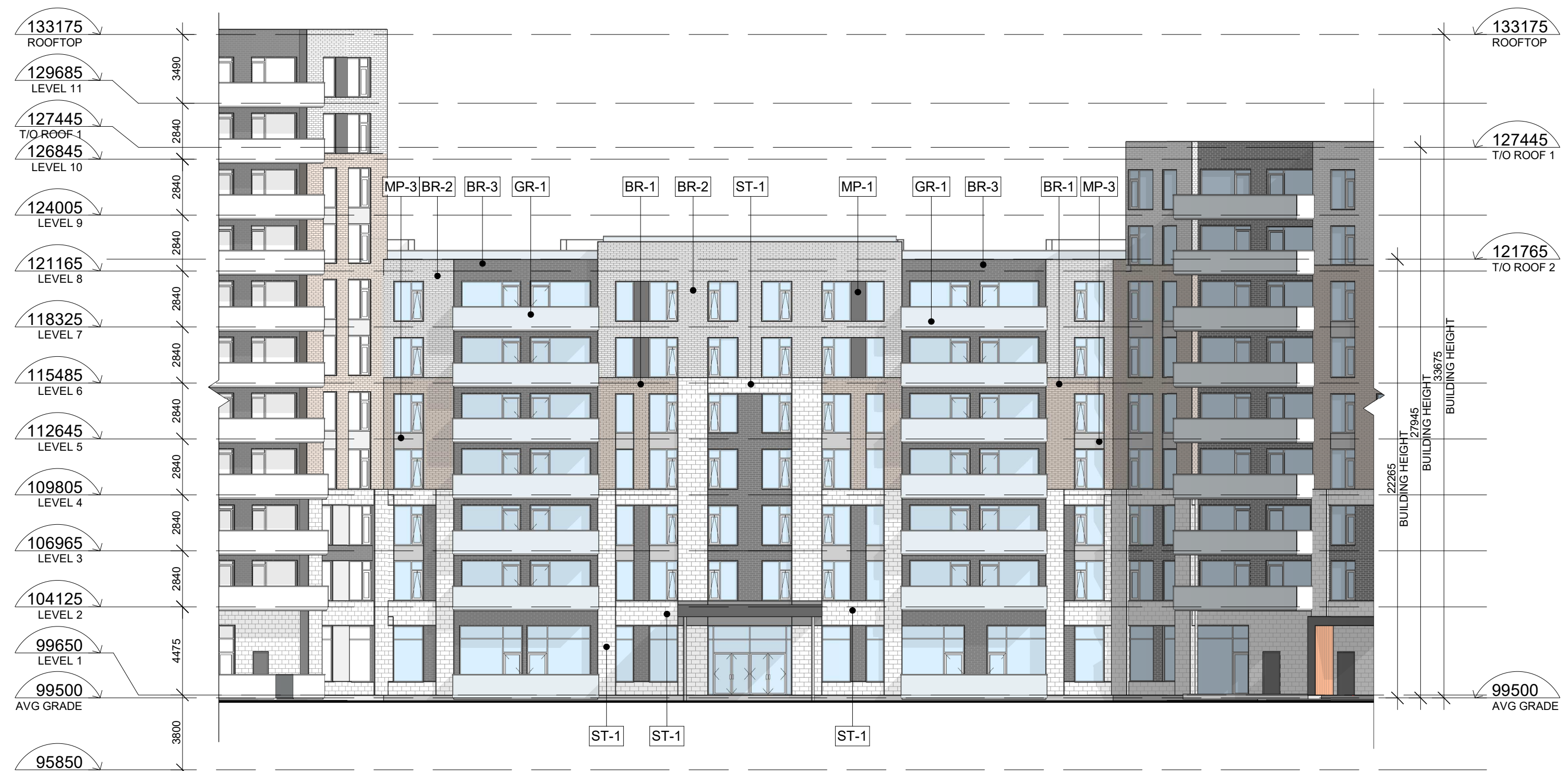
3 NORTH ELEVATION - CENTER BUILDING - CENTRE 1 : 200